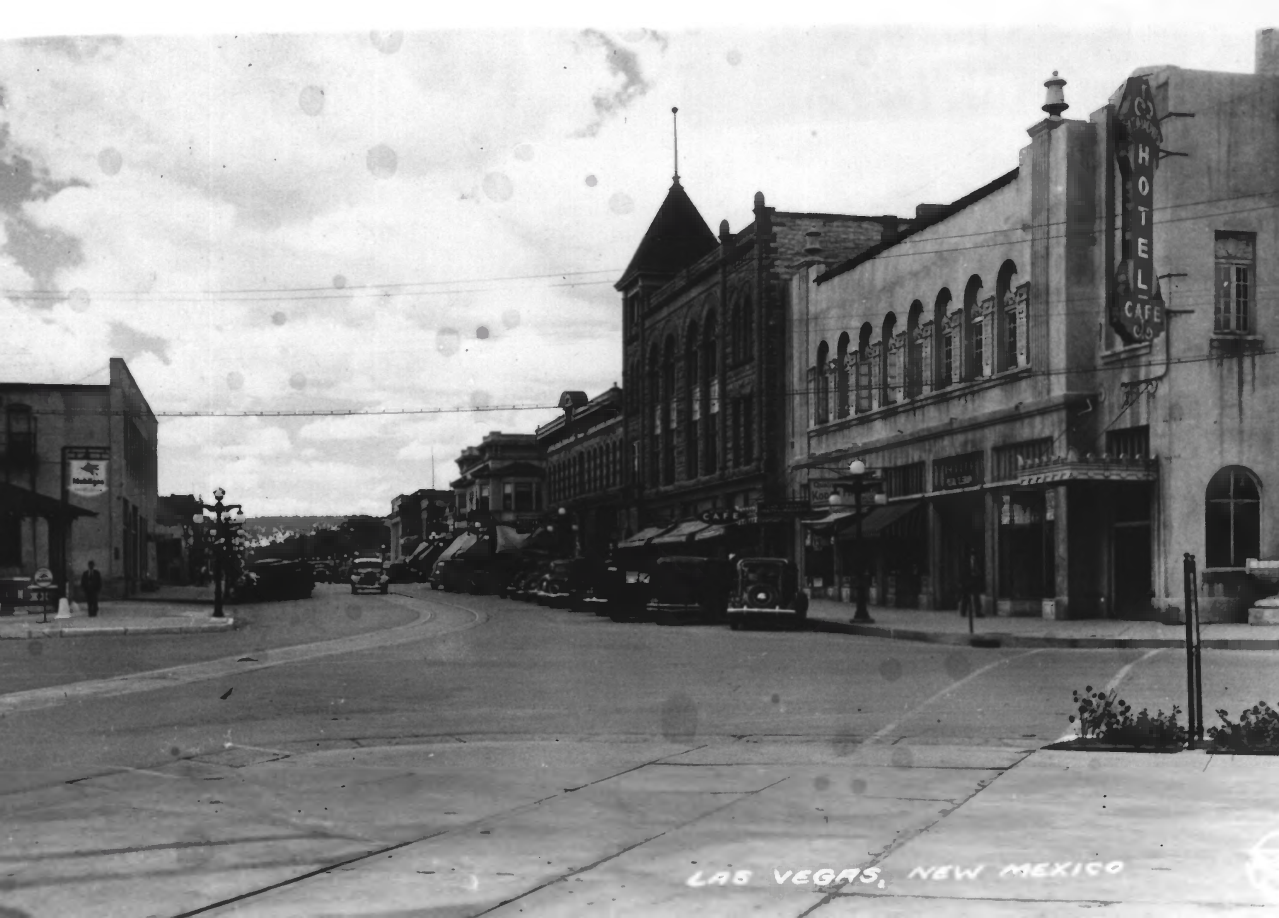
LAS VEGAS, NEW MEXICO