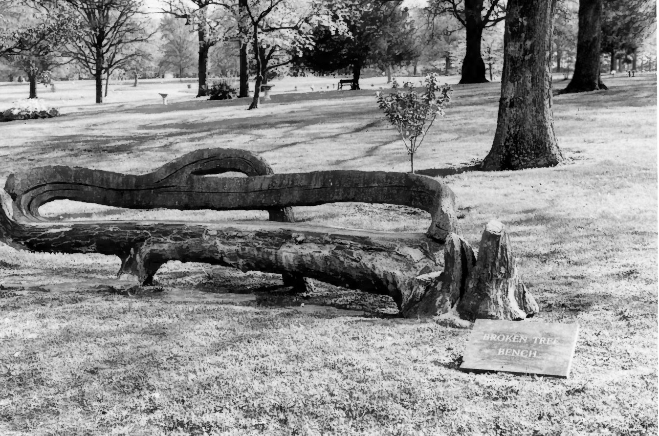
BROKEN TREE BENCH