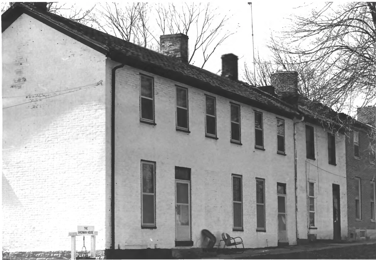
THE SHERMAN HOUSE