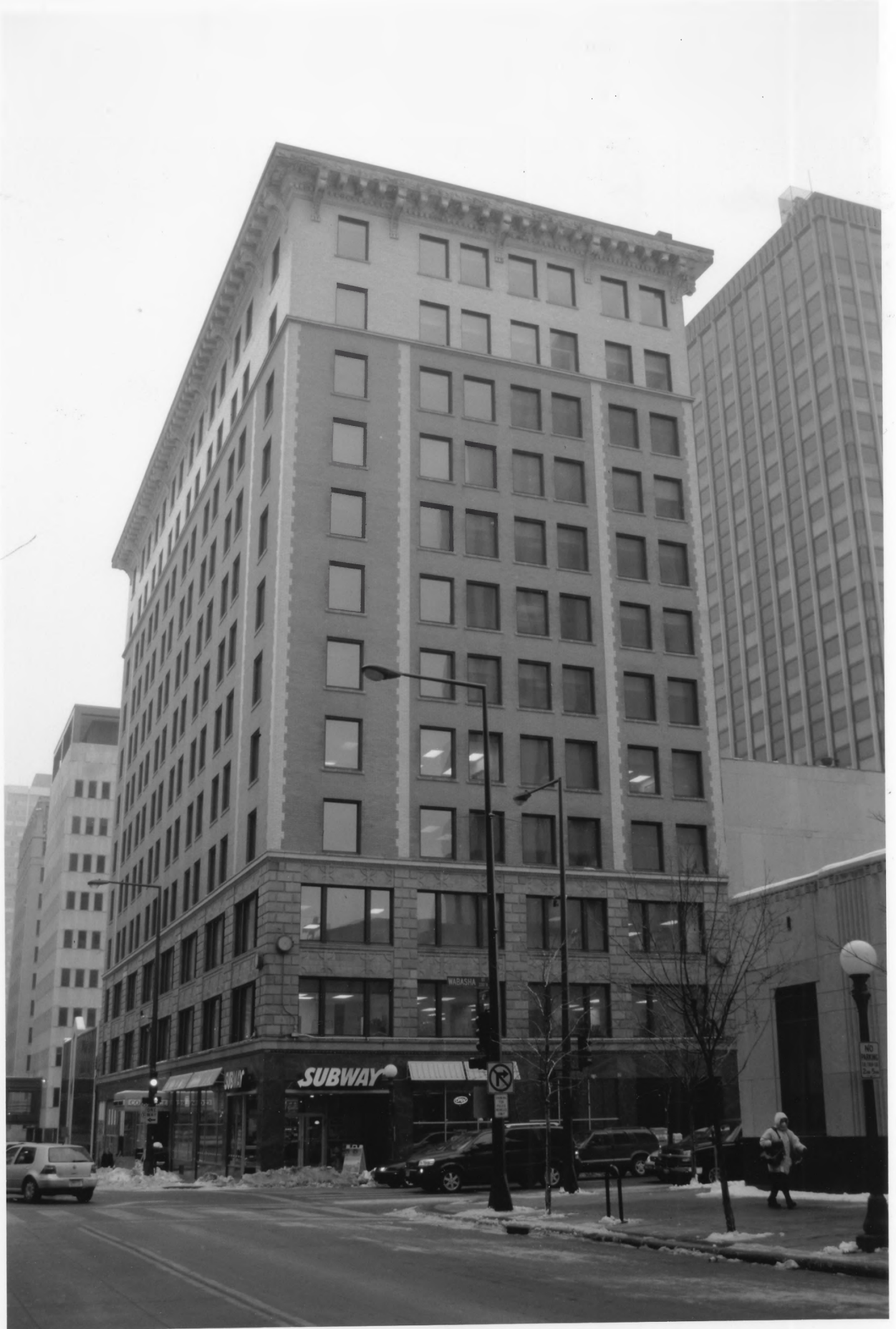
015020-1 COMMERCE BUILDING RAMSEY CO., MN