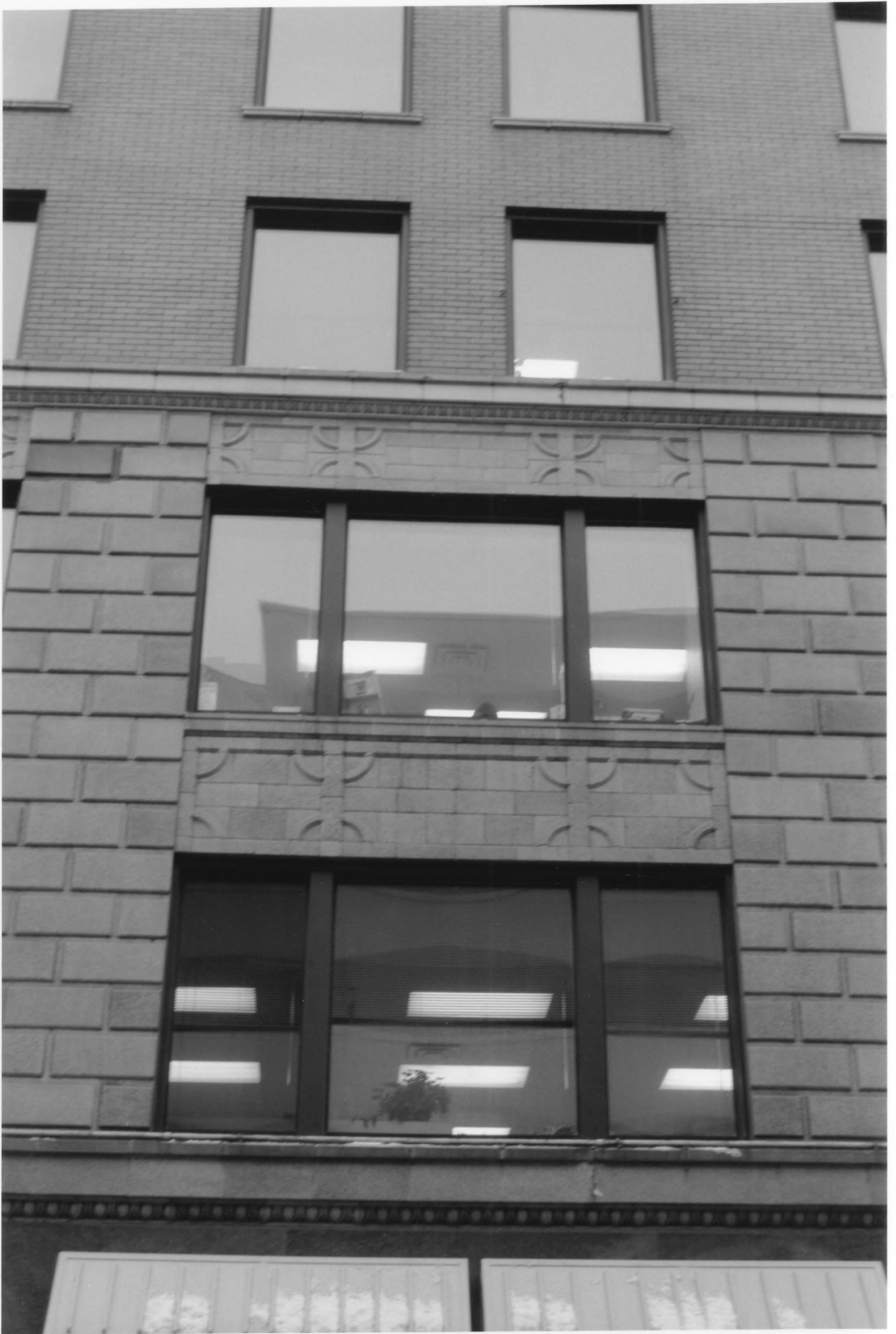
COMMERCE BUILDING RAMSEY CO., MN 015020-5