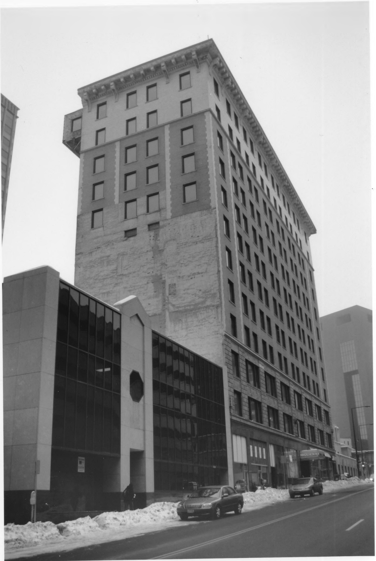
COMMERCE BUILDING RAMSEY CO., MN 015020-2