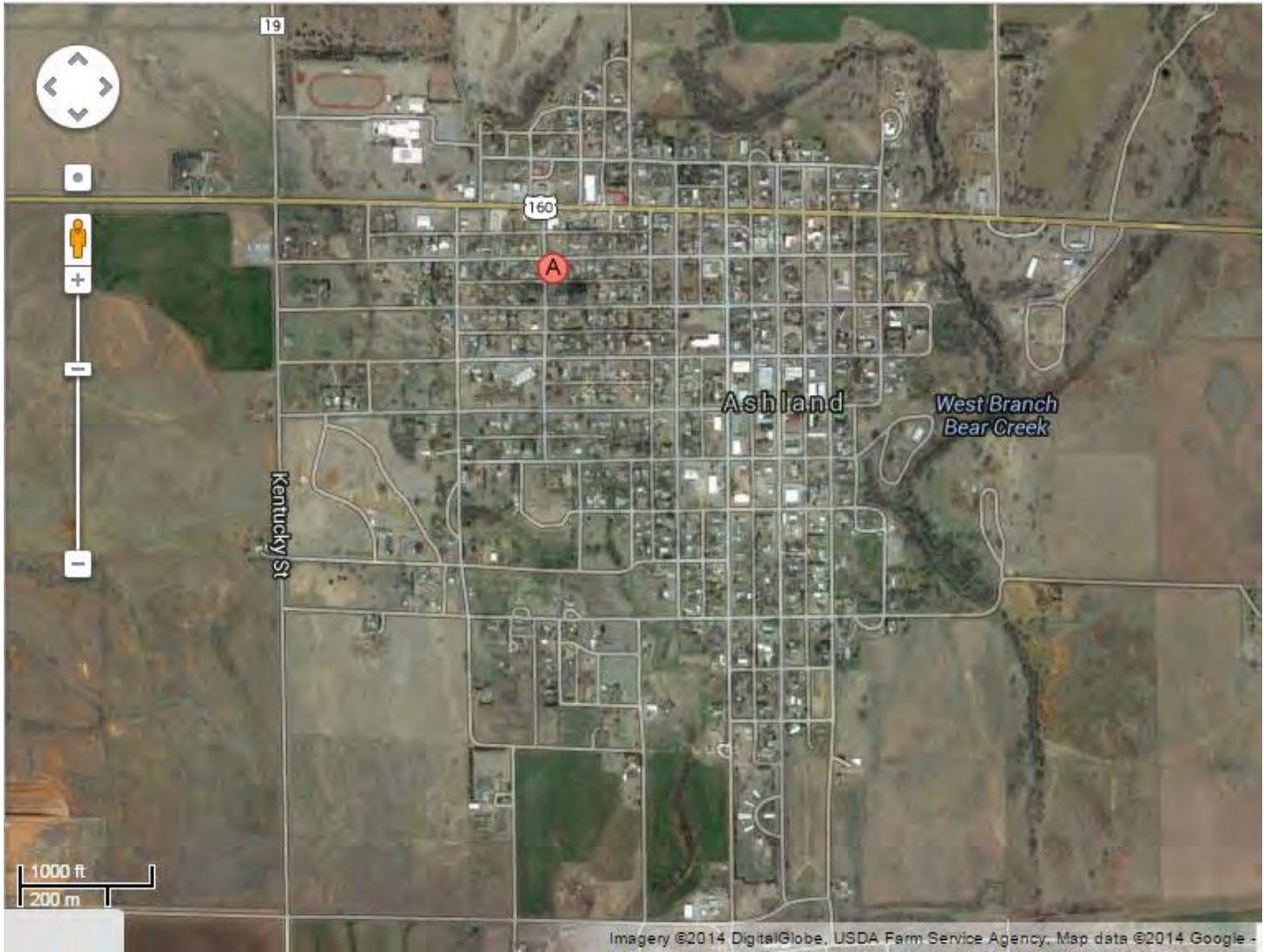
Figure 1: Contextual Map, Google Maps, 2014. The "A" denotes the location of the Girl Scout Little House.