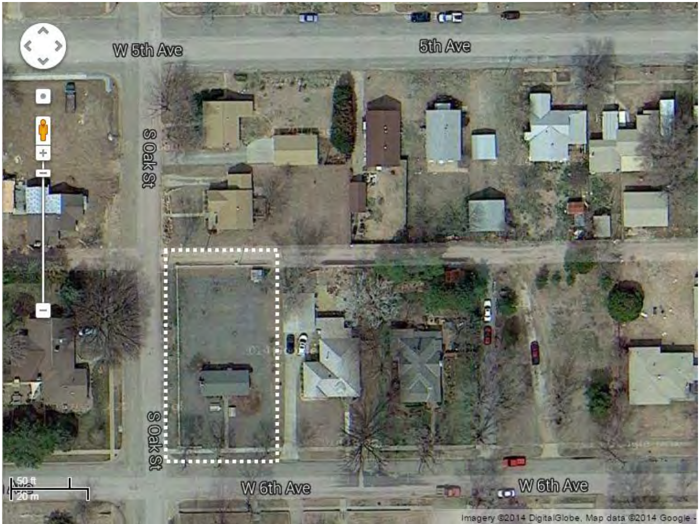
Figure 2: Close-In Map, Google Maps, 2014.