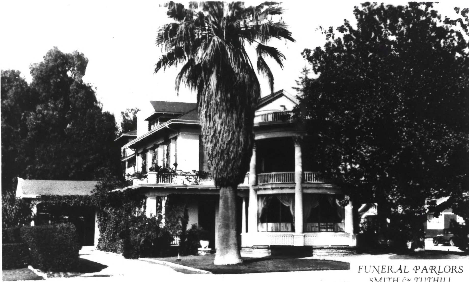
FUNERAL PARLORS SMITH & TUTHILL SANTA ANA, CALIF.