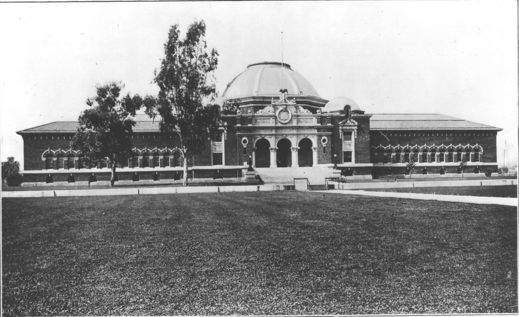
MUSEUM OF HISTORY, SCIENCE AND ART, EXPOSITION PARK