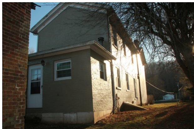
One-story 1970s addition