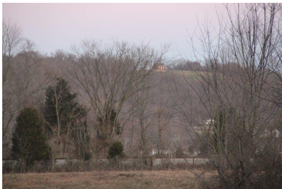
Sroufe House & Outbuildings