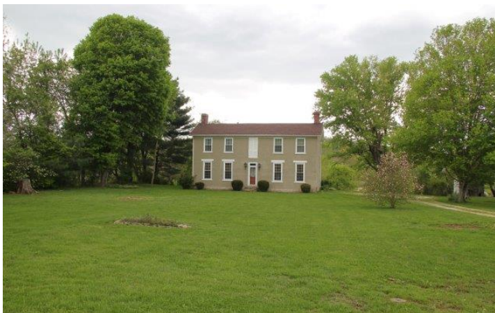
Stroufe House (from highway)

property is flat and grassy. There are several large trees on the acreage around the north and west property boundaries. Walkabout Lane runs along the east edge of the property. This lane connects another property, north of the Stroufe House, with the highway.