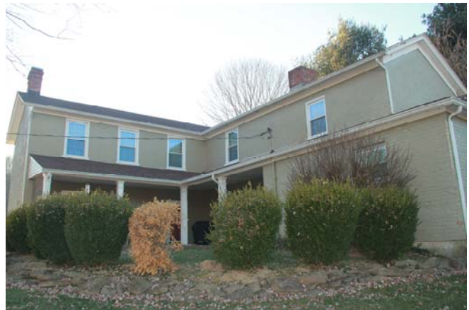
Back side (on left) and east side of ell (at right)