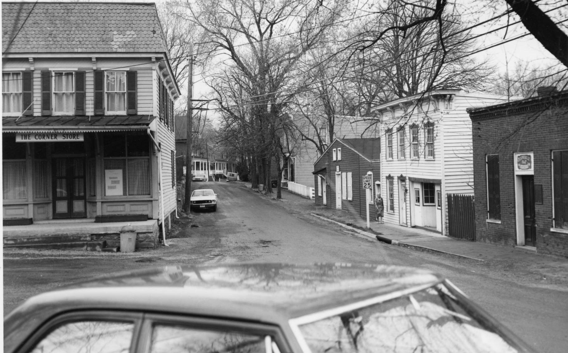
Looking south on 2nd Street from Main Street, Waterford, Virginia