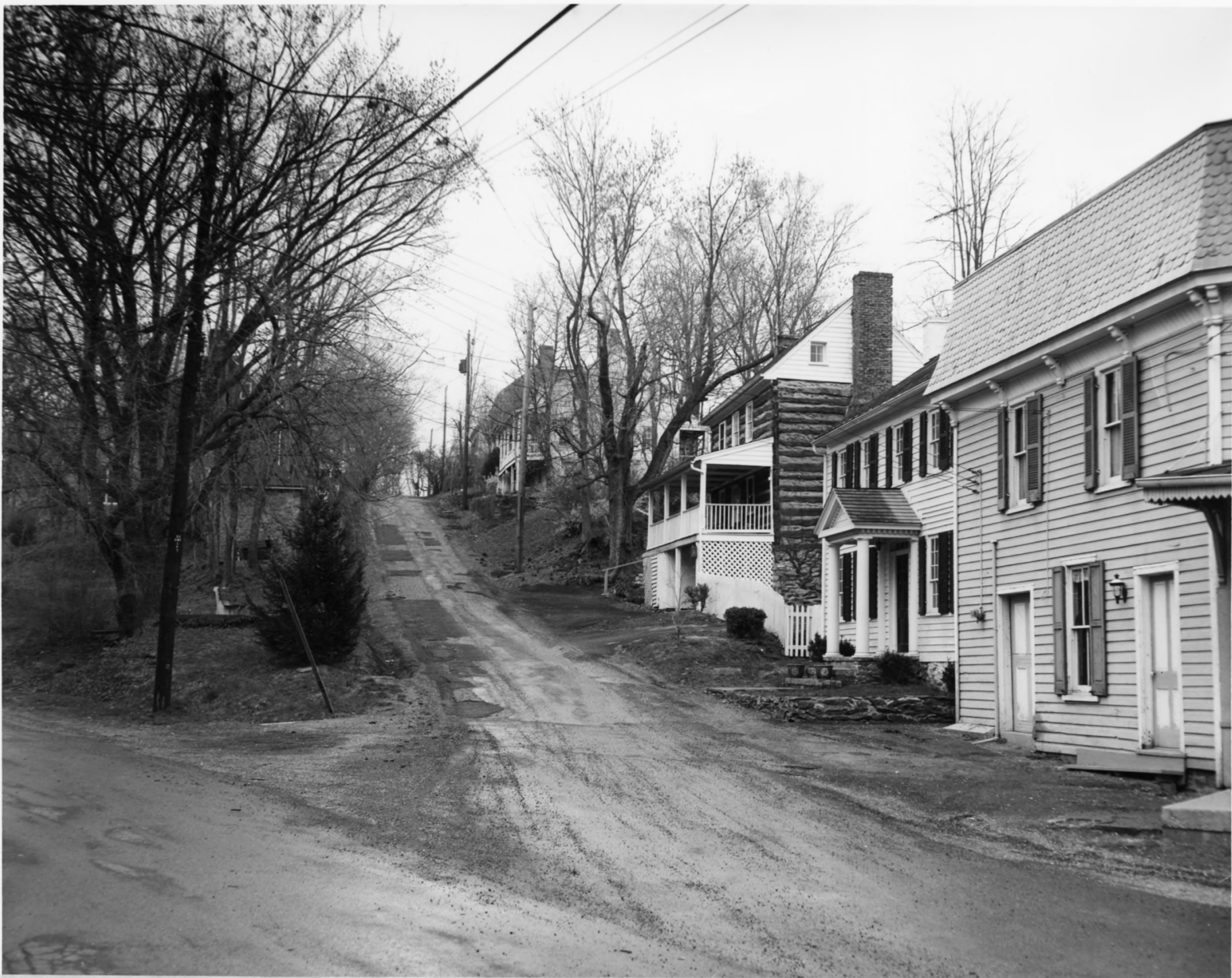
Country Store, Waterford, Virginia