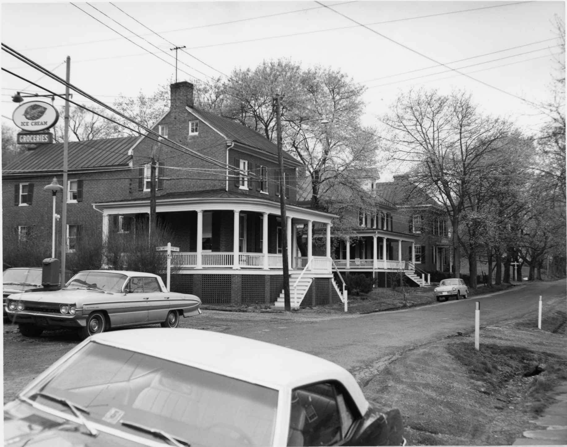
East side of Second Street, Waterford, Virginia