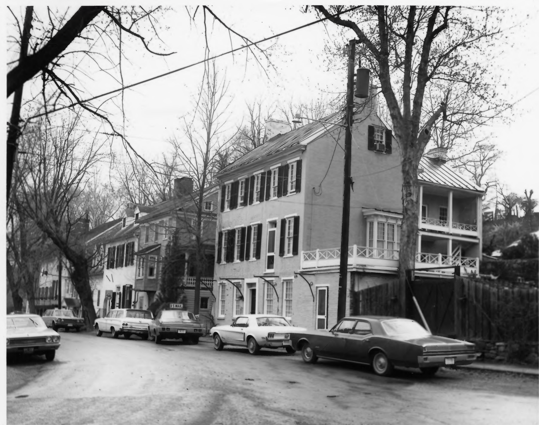
North side of Main Street, Waterford, Virginia