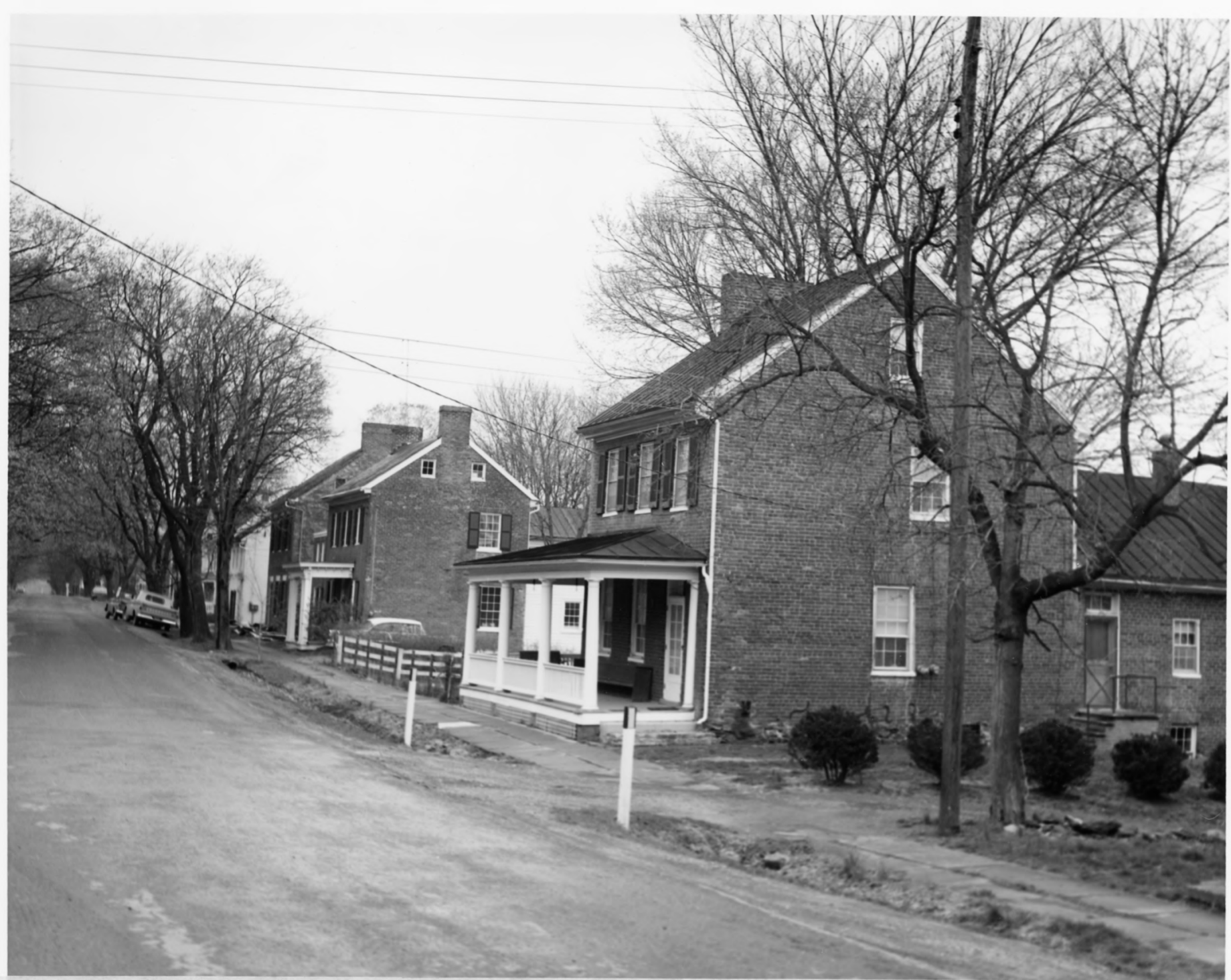
West side of Second Street, Waterford, Virginia