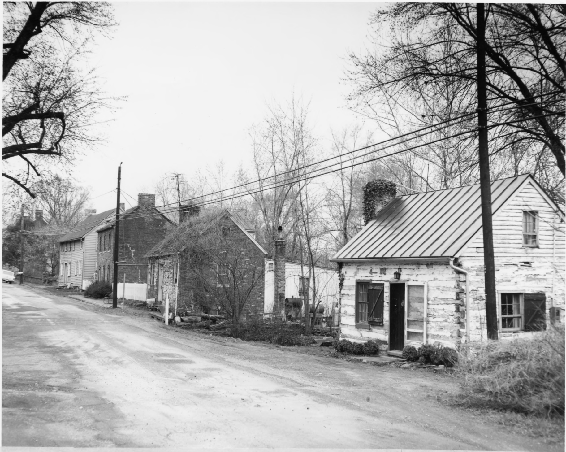
South side of Main Street, Waterford, Virginia