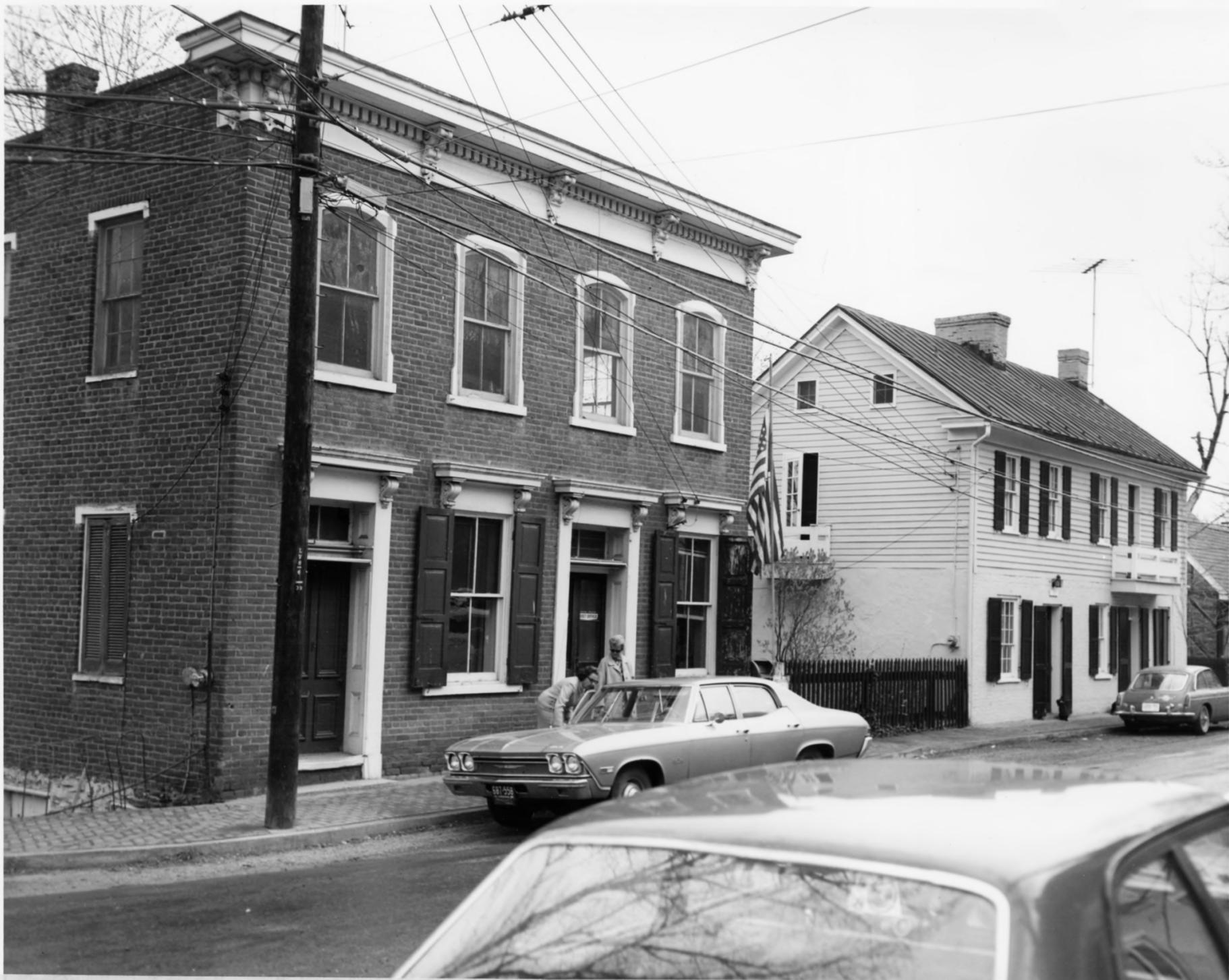
Post Office, 2nd and Main Streets, Waterford, Virginia