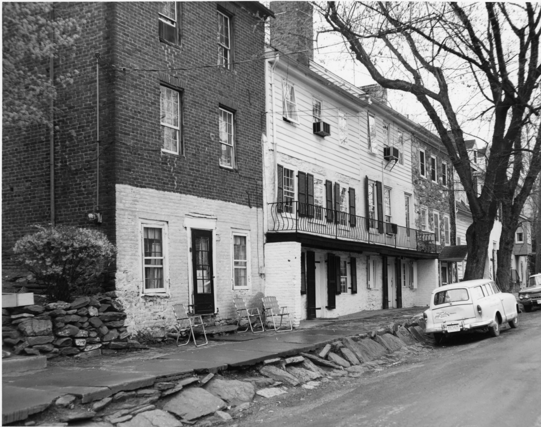
North side of Main Street, Waterford, Virginia