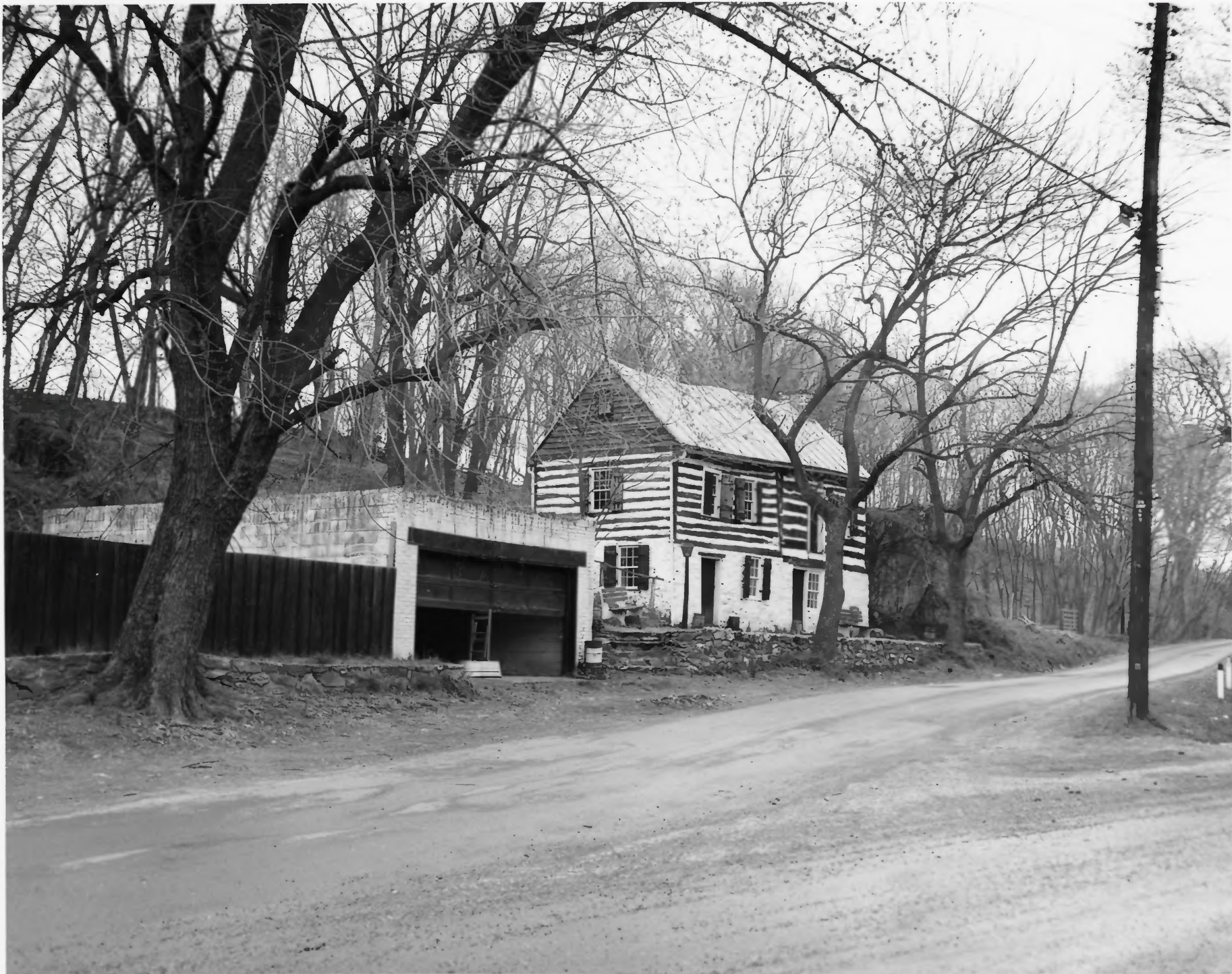
Water and Main Streets, Waterford, Virginia