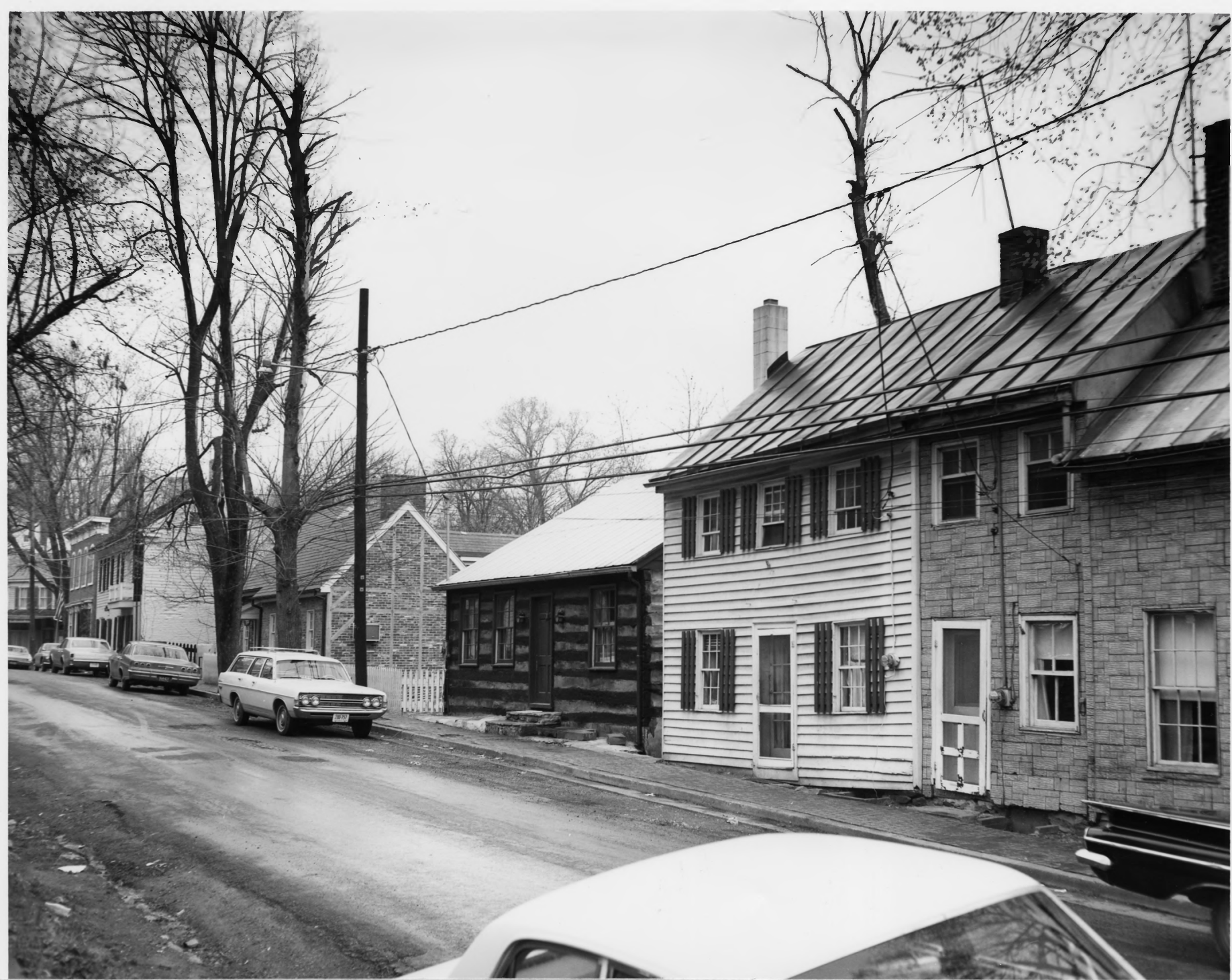
South side of Main Street, Waterford, Virginia