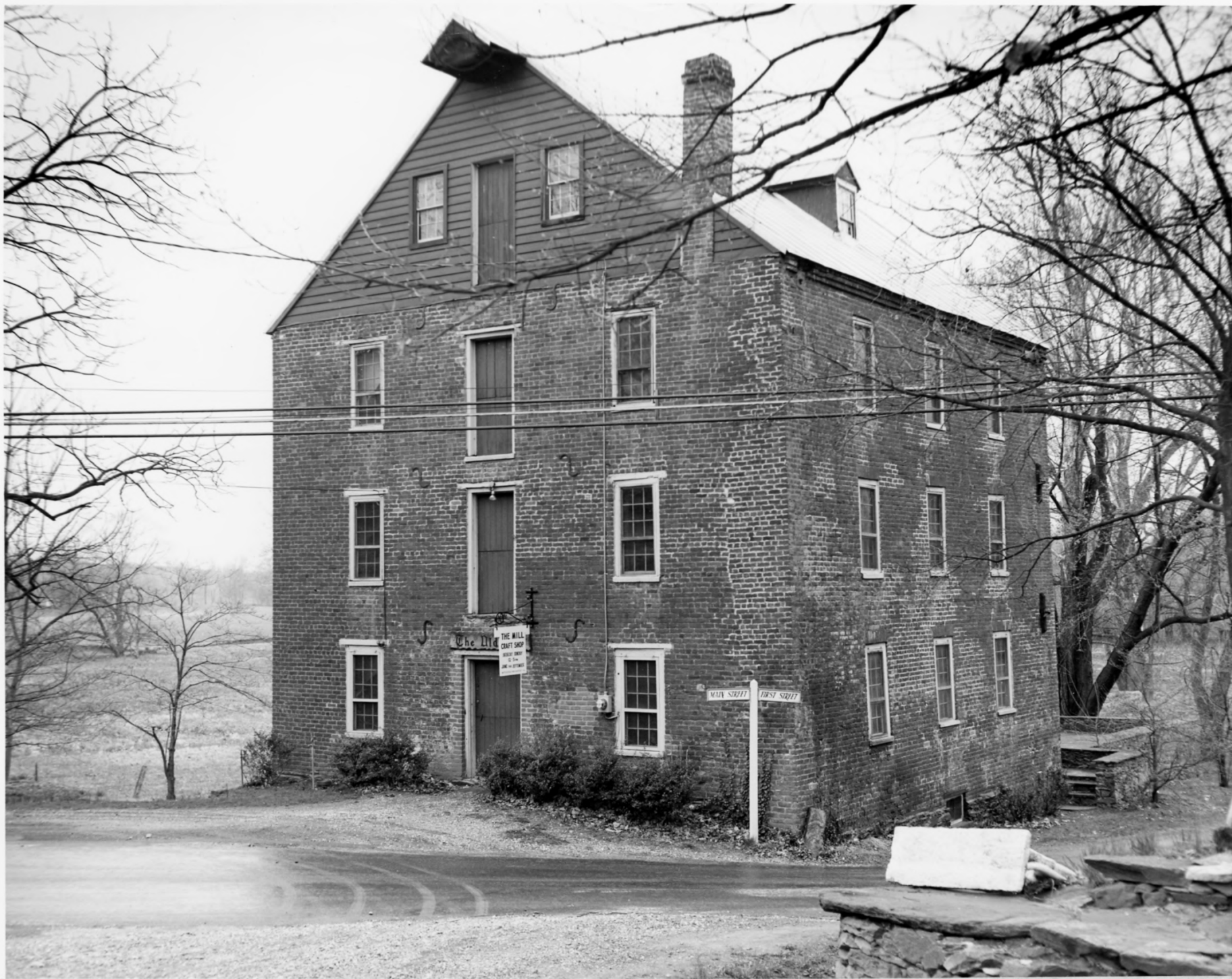
Old Mill, Waterford, Virginia