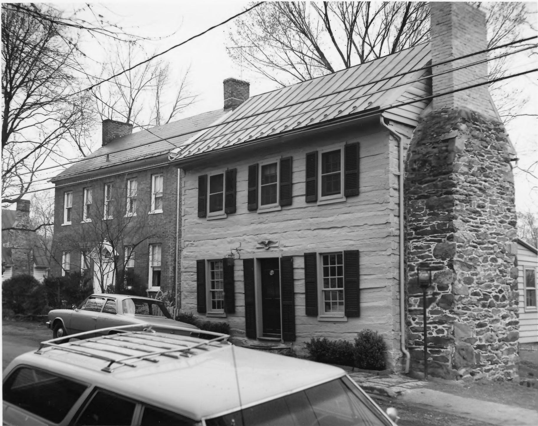
South side of Main Street, Waterford, Virginia