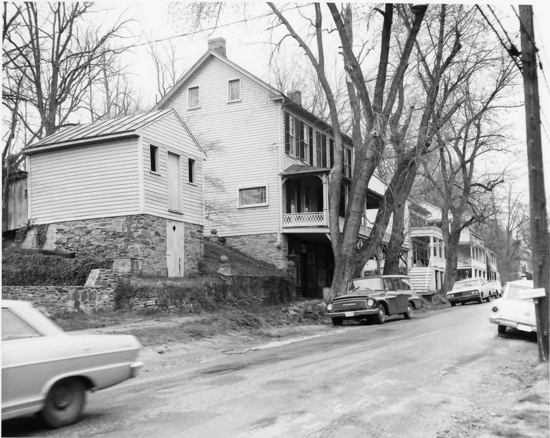
North side of Main Street, Waterford, Virginia