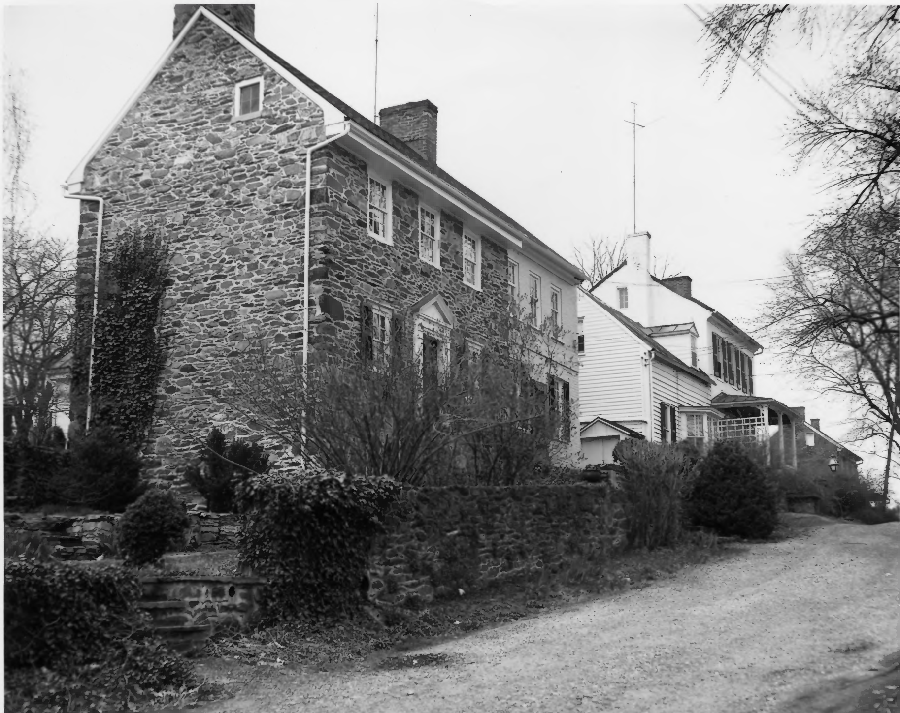
First and Bond Streets, Waterford, Virginia