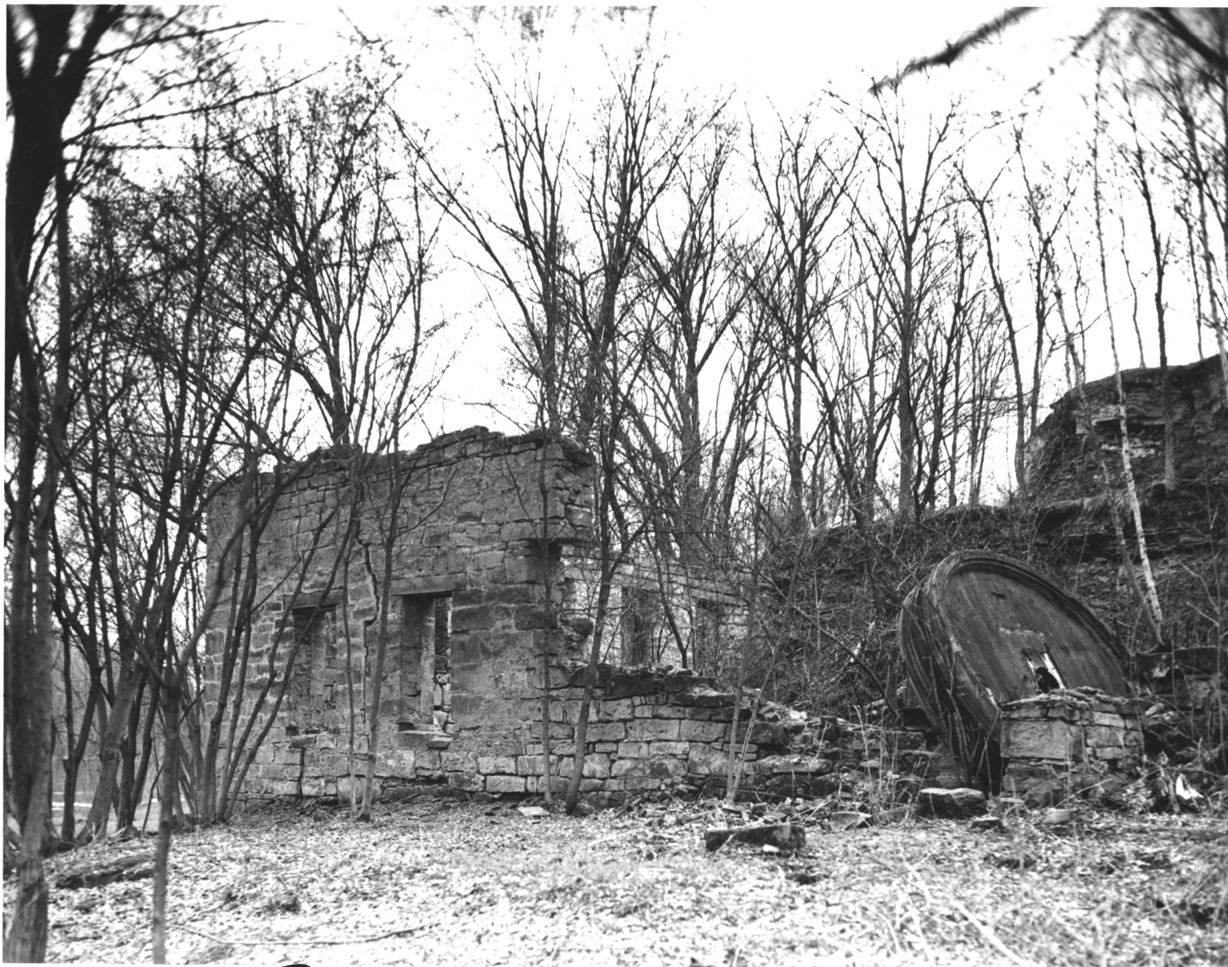
RUINS of 1873 Engine House