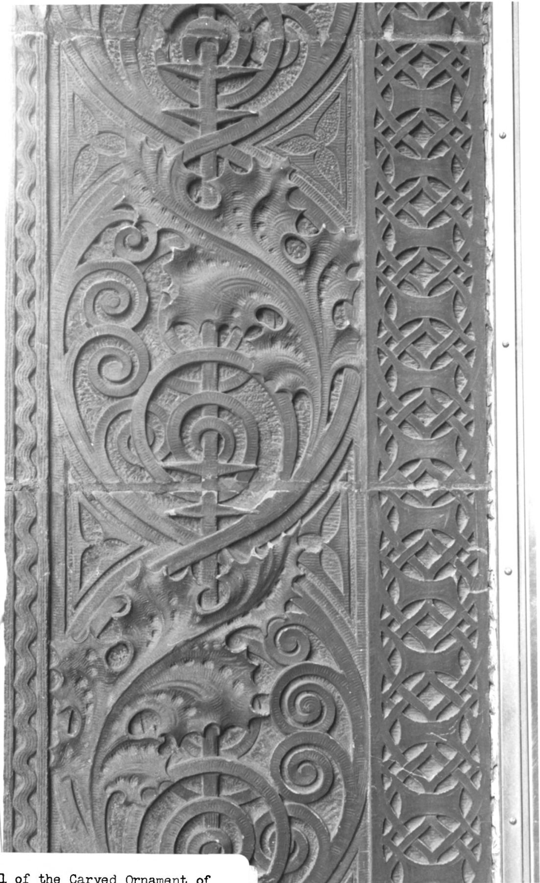
8. Detail of the Carved Ornament of the South Entrance