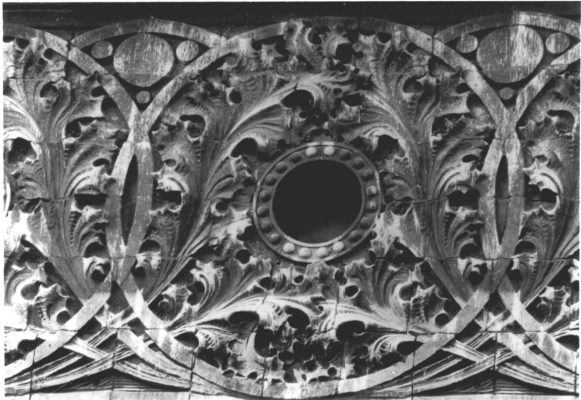
4. Detail of the Cornice