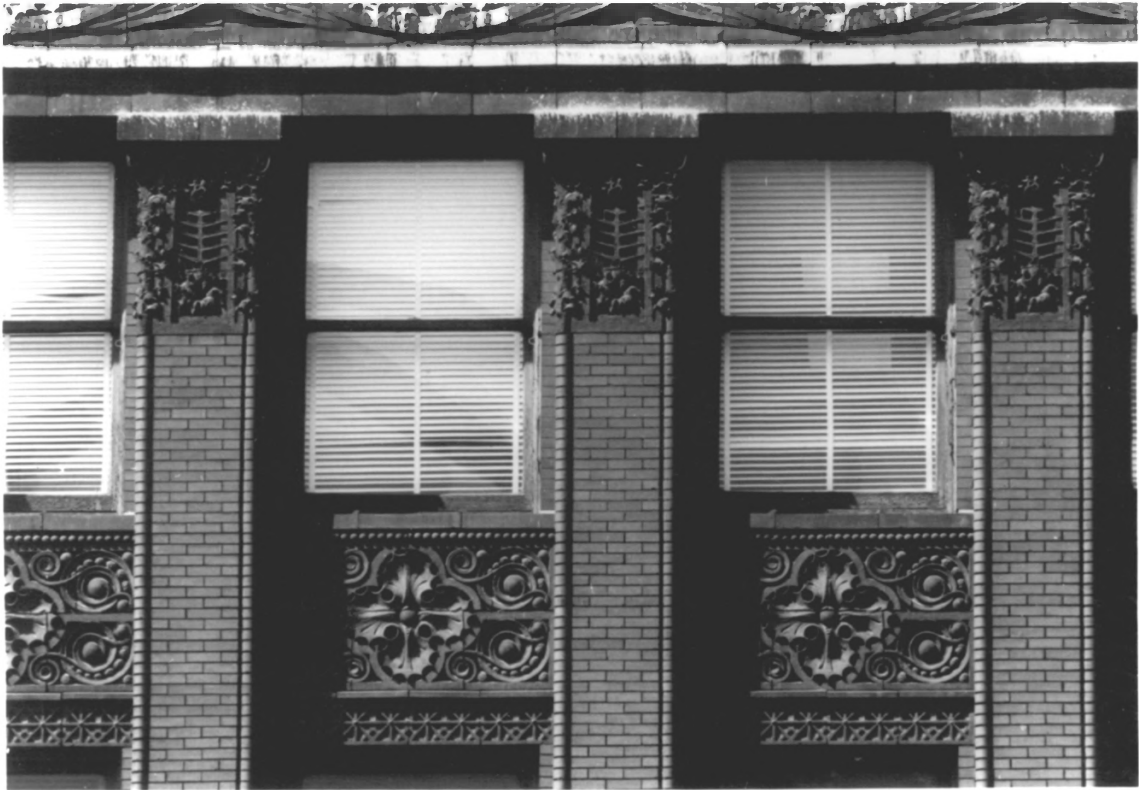
5. Detail of the Ninth Floor