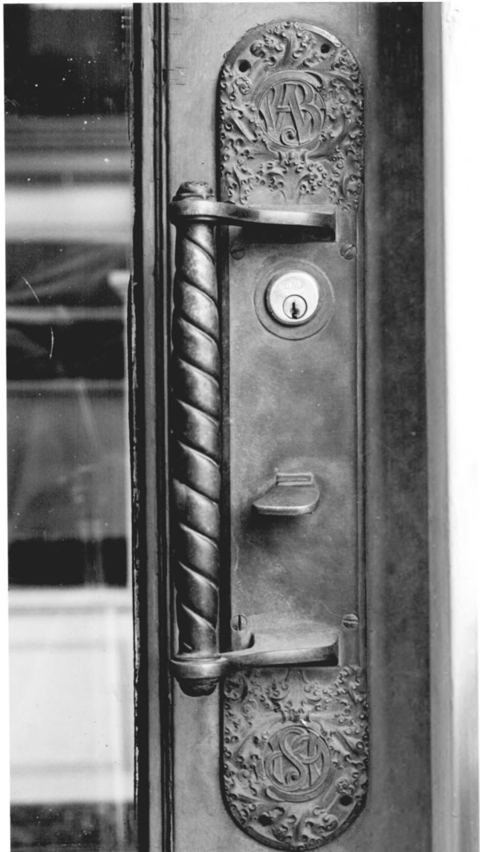
9. Detail of a Shopfront Doorplate: WB 1891