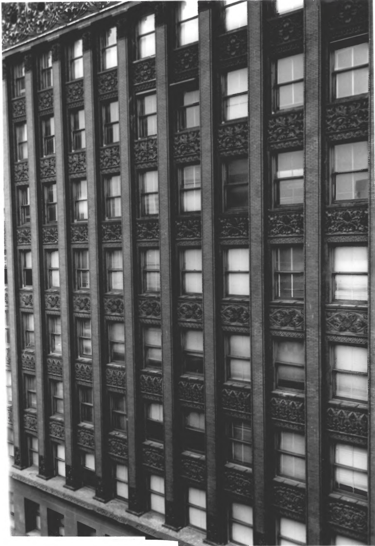
3. View of the East Front