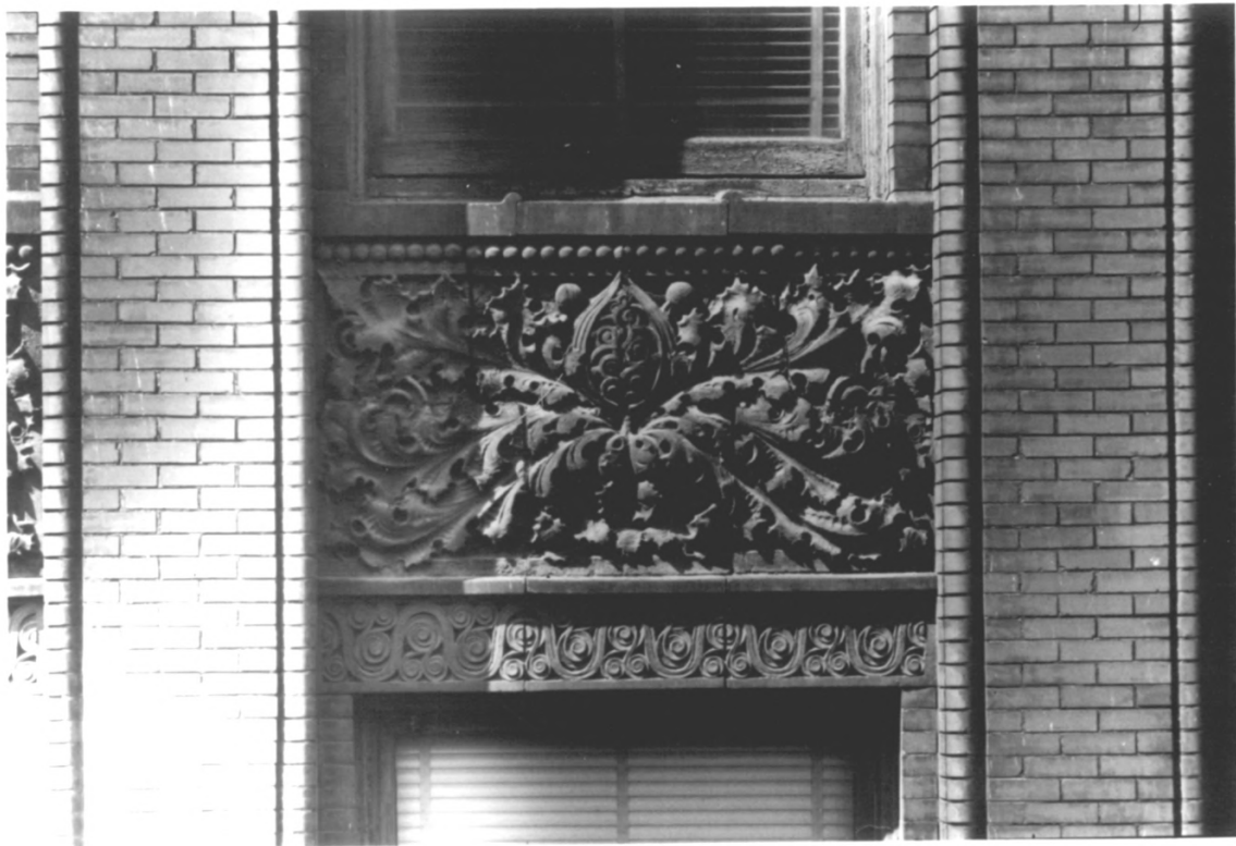
6. Detail of the Spandrel under the 7th Story Sill