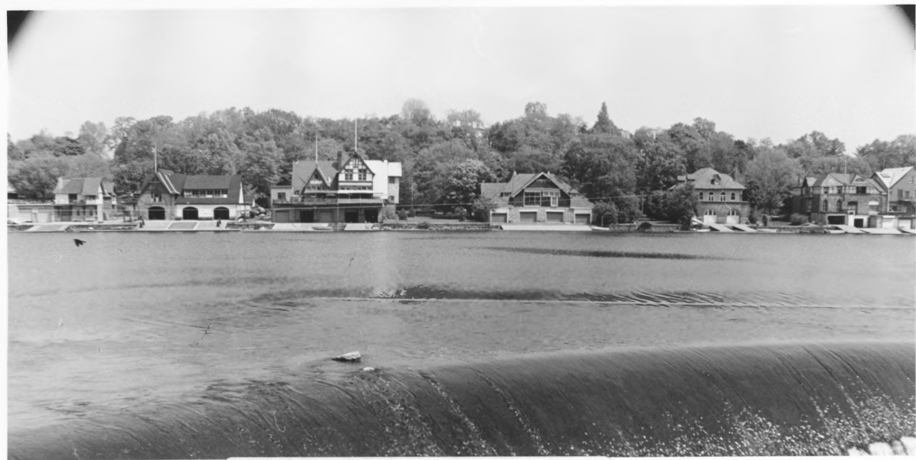
Mid-portion of Boathouse Row. From right to left: #5, 6, 7-8, 9, 10, and 11. (Fairmount Park Commission, 1985)