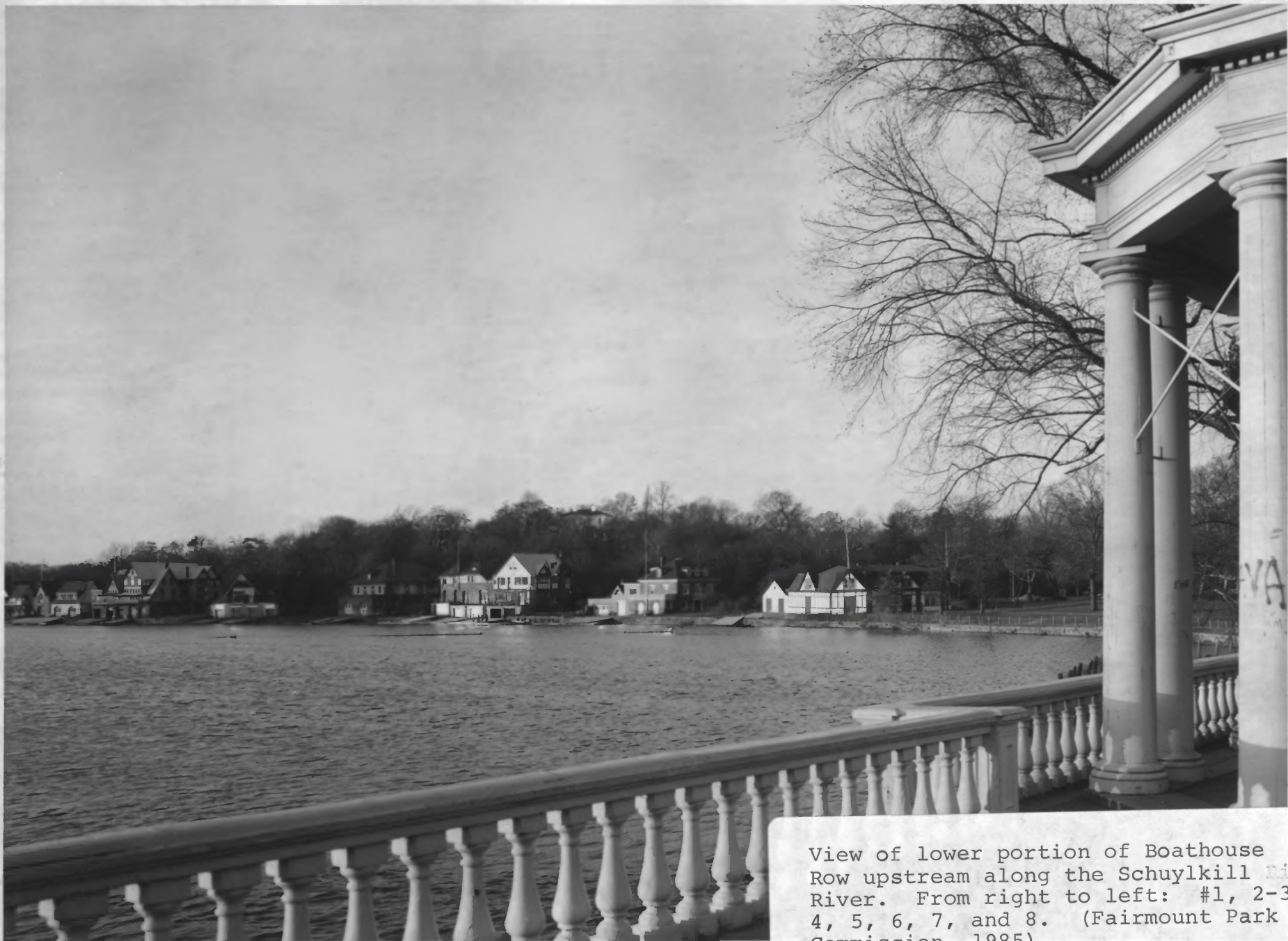
View of lower portion of Boathouse Row upstream along the Schuylkill River. From right to left: #1, 2-3, 4, 5, 6, 7, and 8. (Fairmount Park Commission, 1985)