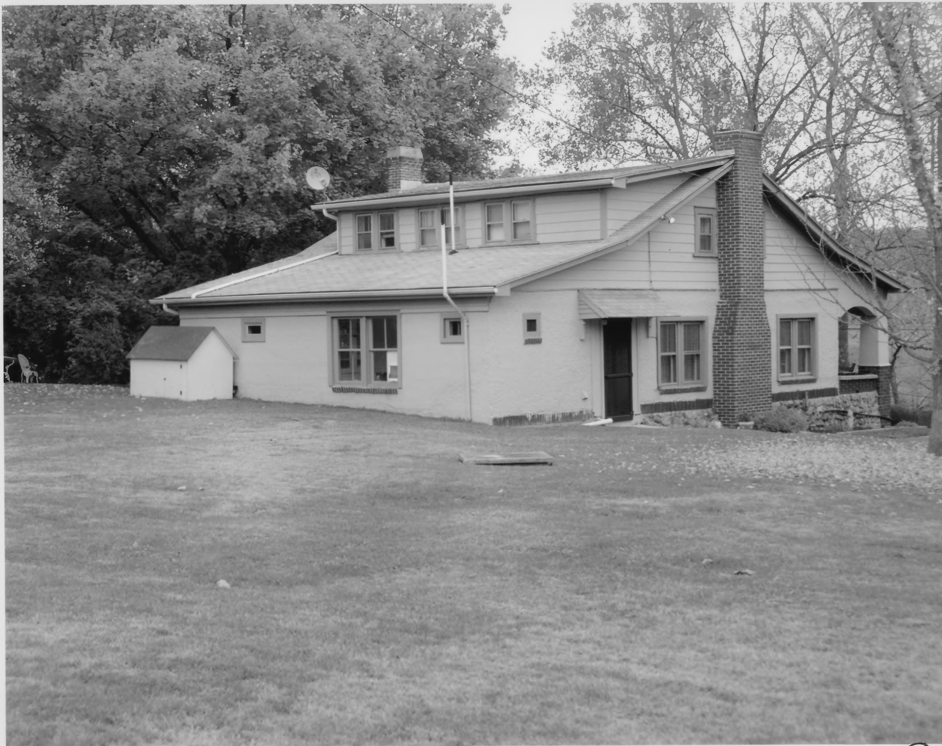
SNYDER, BENJAMIN H., HOUSE, Berkeley Co. WV