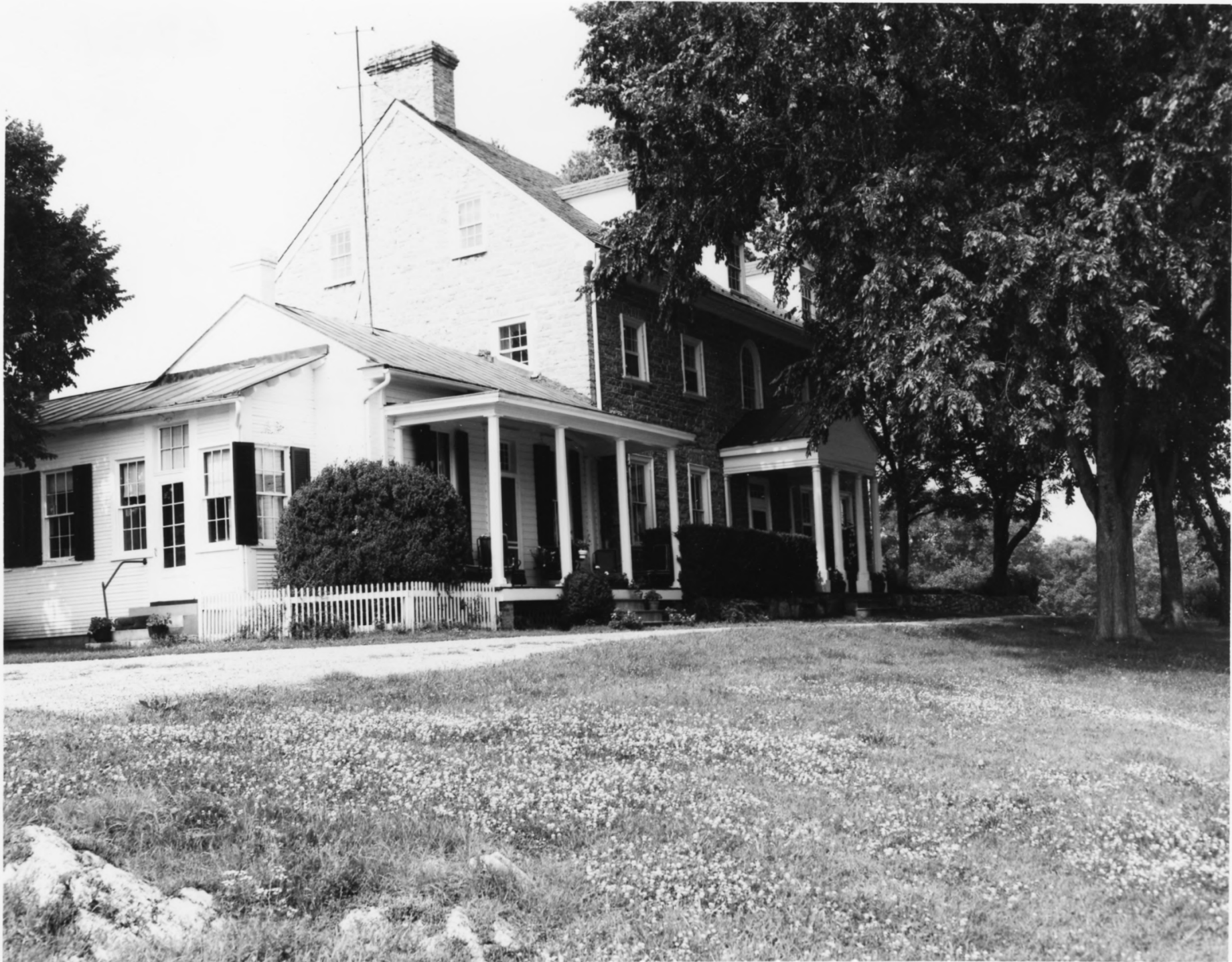
General Daniel Morgan House, Saratoga, Boyce, Virginia (South elevation)