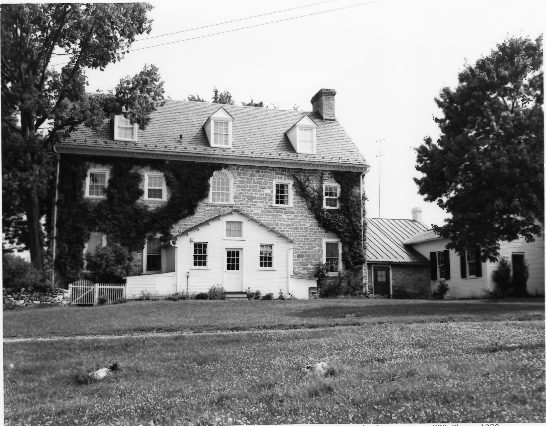
General Daniel Morgan House, Saratoga, Boyce, Virginia. (North elevation).