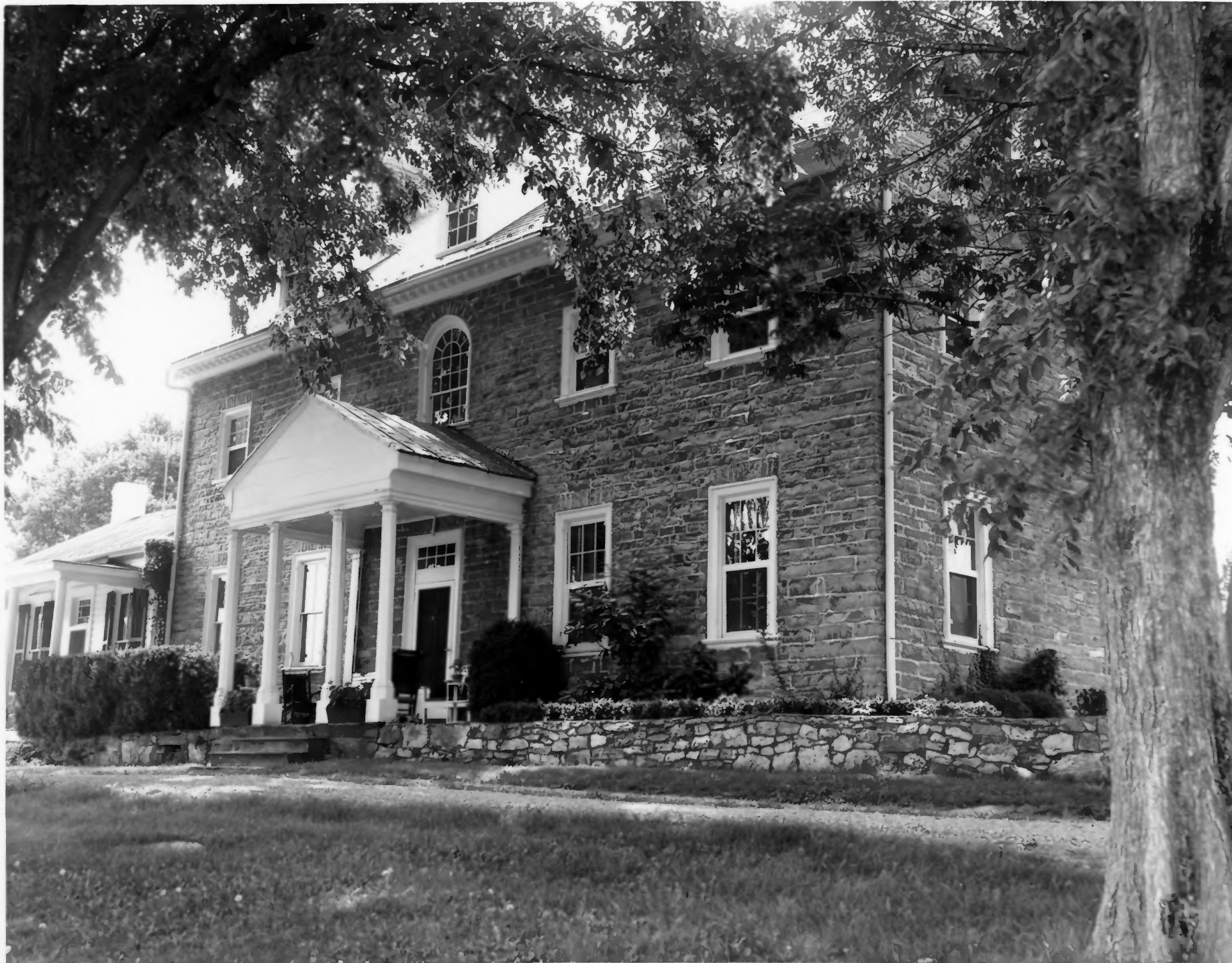
General Daniel Morgan House, Saratoga, Boyce, Virginia. (South elevation).