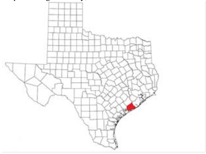
Map 2: Google Earth, accessed March 1, 2018