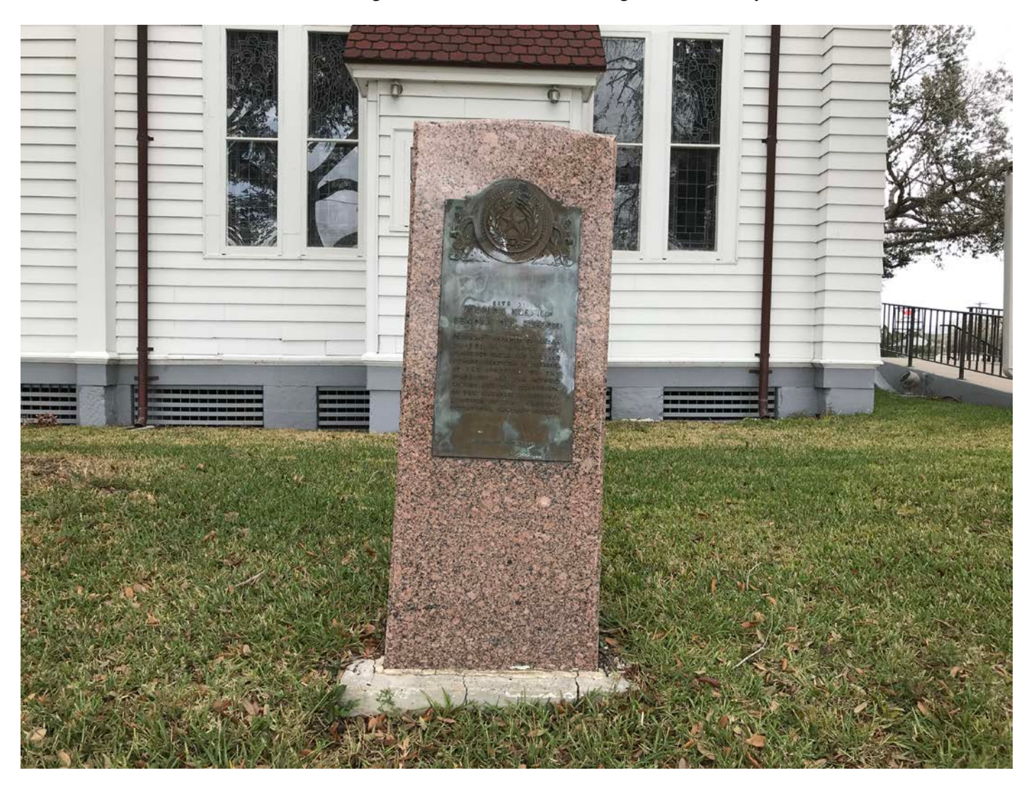
Photo 1: Mission Nuestra Señora del Refugio monument—camera facing north, February 15, 2018.