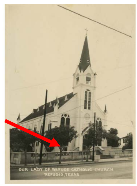
Figure 3: Second location of the mission monument, 1979.