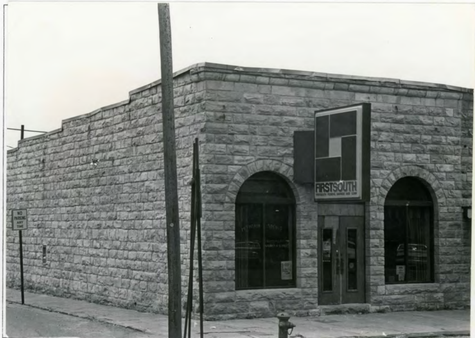
Historic Resources in Stone County C. L. Smith & Son General Store, ST-101 Mountain View 1983 Negative on file at the AHPP Viewed from the northeast