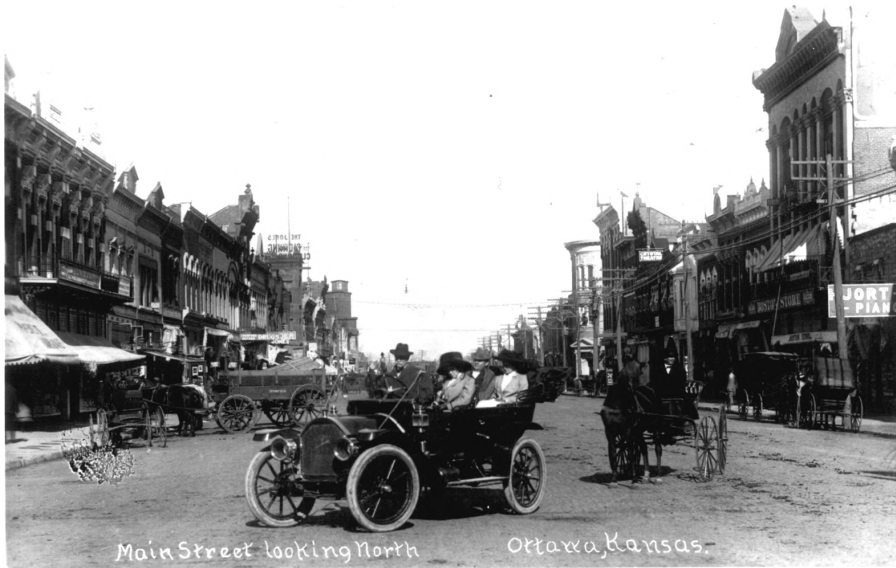
Main Street looking North