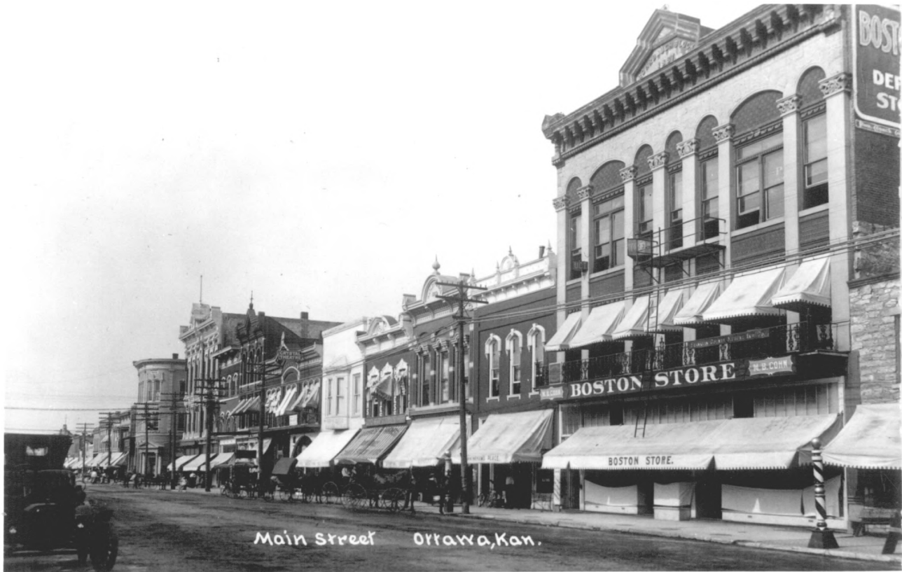
Main Street Ottawa, Kan.