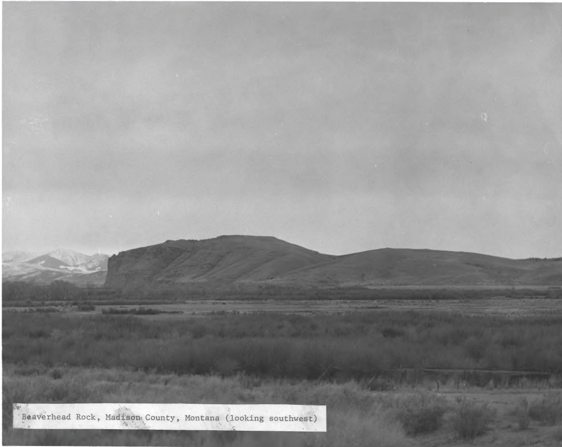
Beaverhead Rock, Madison County, Montana (looking southwest)