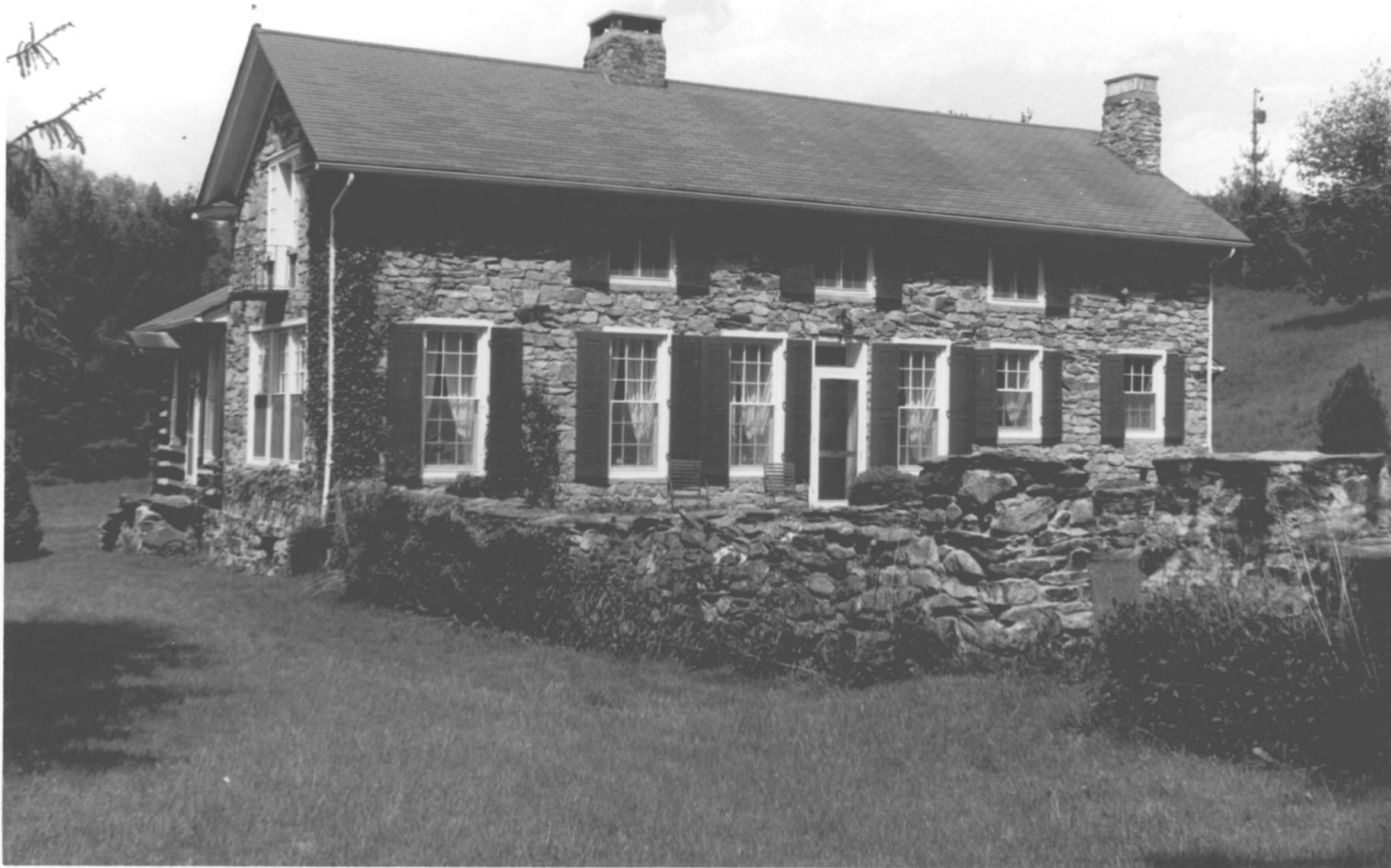
Sherwood Anderson House ("Ripshin Farm"), Trout Dale, Virginia