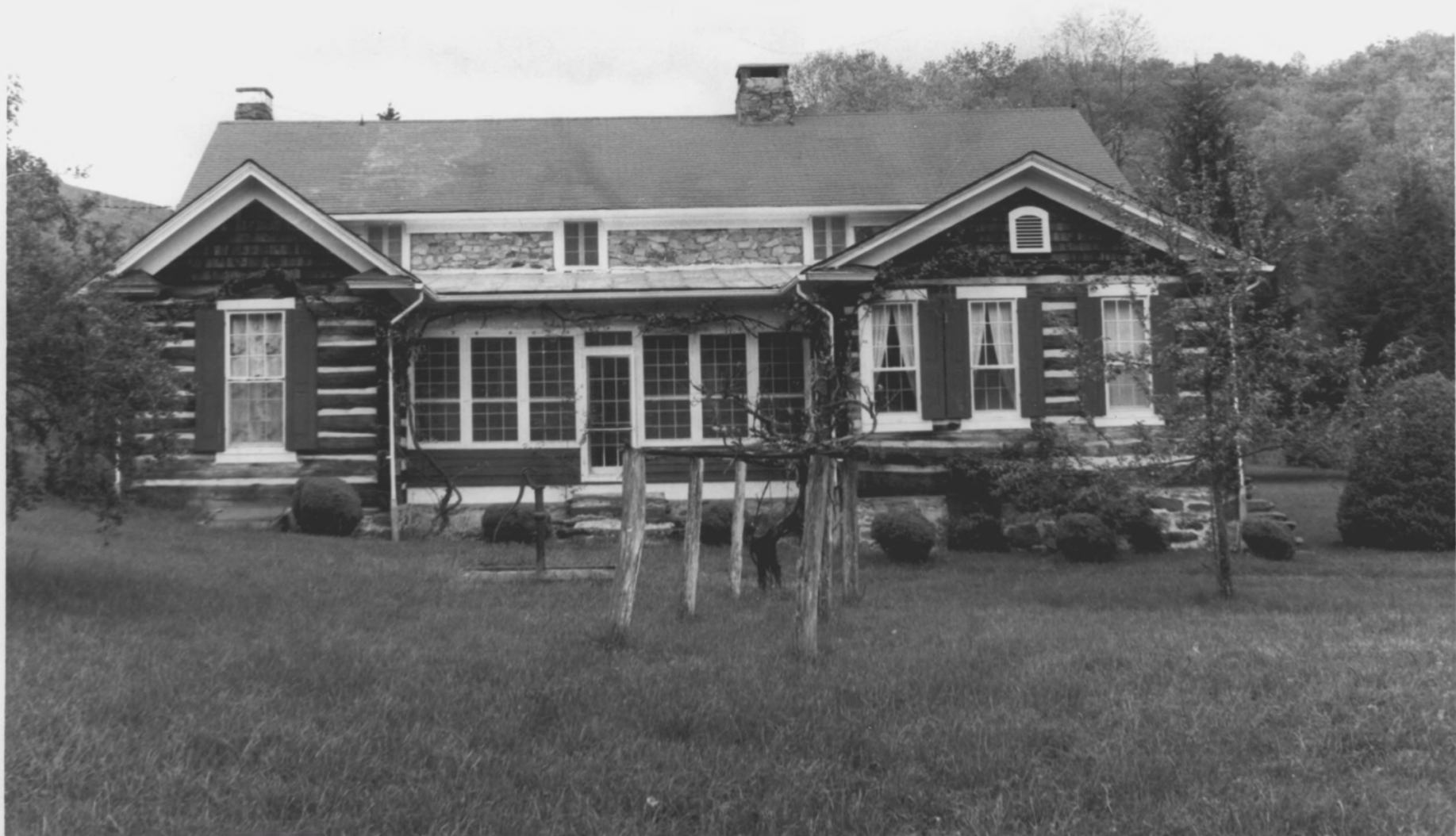
Sherwood Anderson House ("Ripshin Farm"), Trout Dale, Virginia