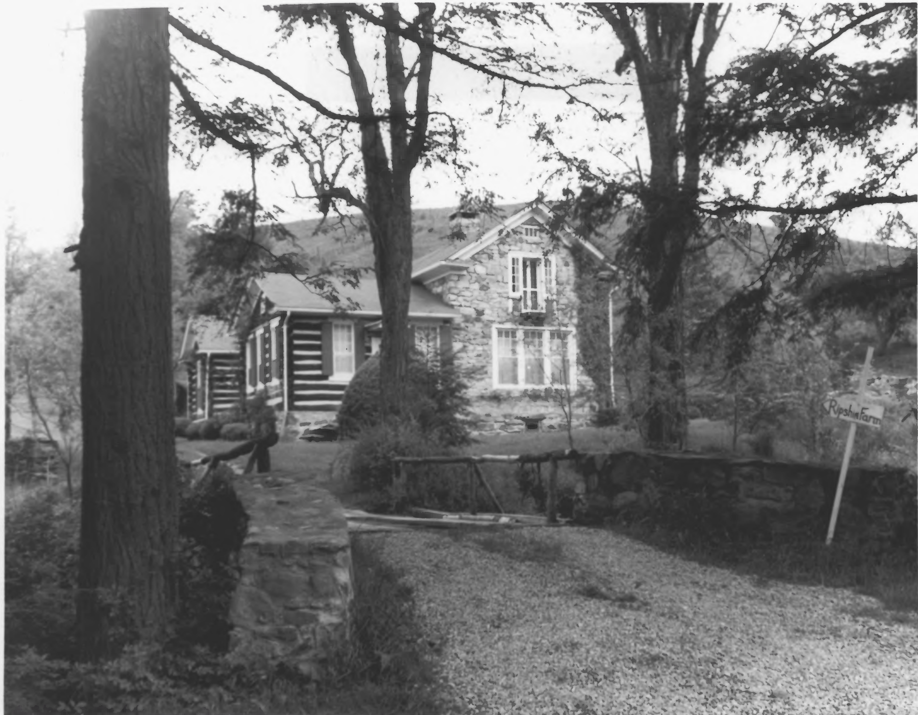
"Ripshin Farm," Sherwood Anderson House, Trout Dale, Virginia (entrance)