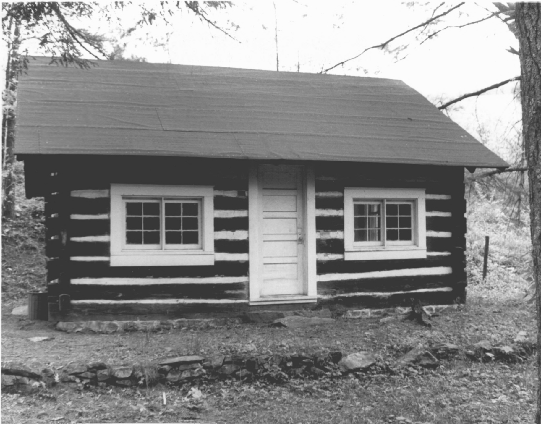
"Ripshin Farm," Sherwood Anderson House, Trout Dale, Virginia (writing cabin)