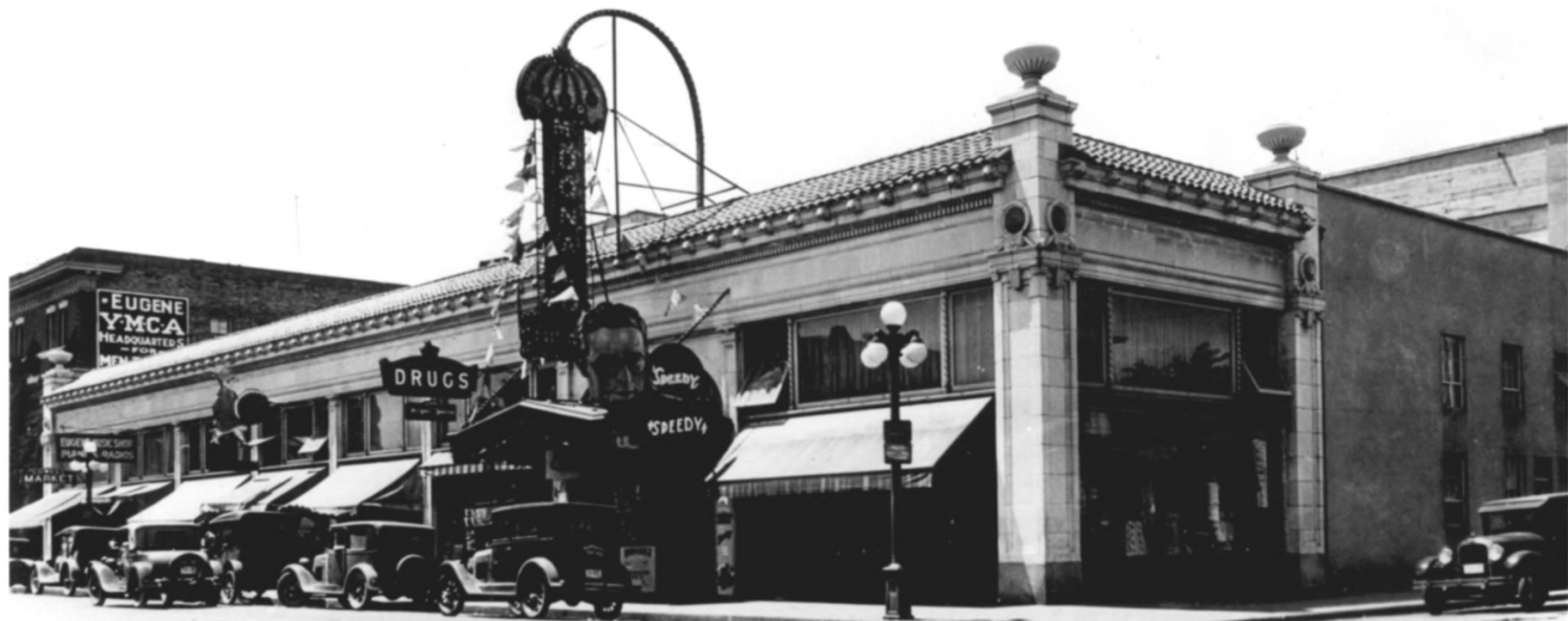
McDonald Theatre Bldg Eugene Ore