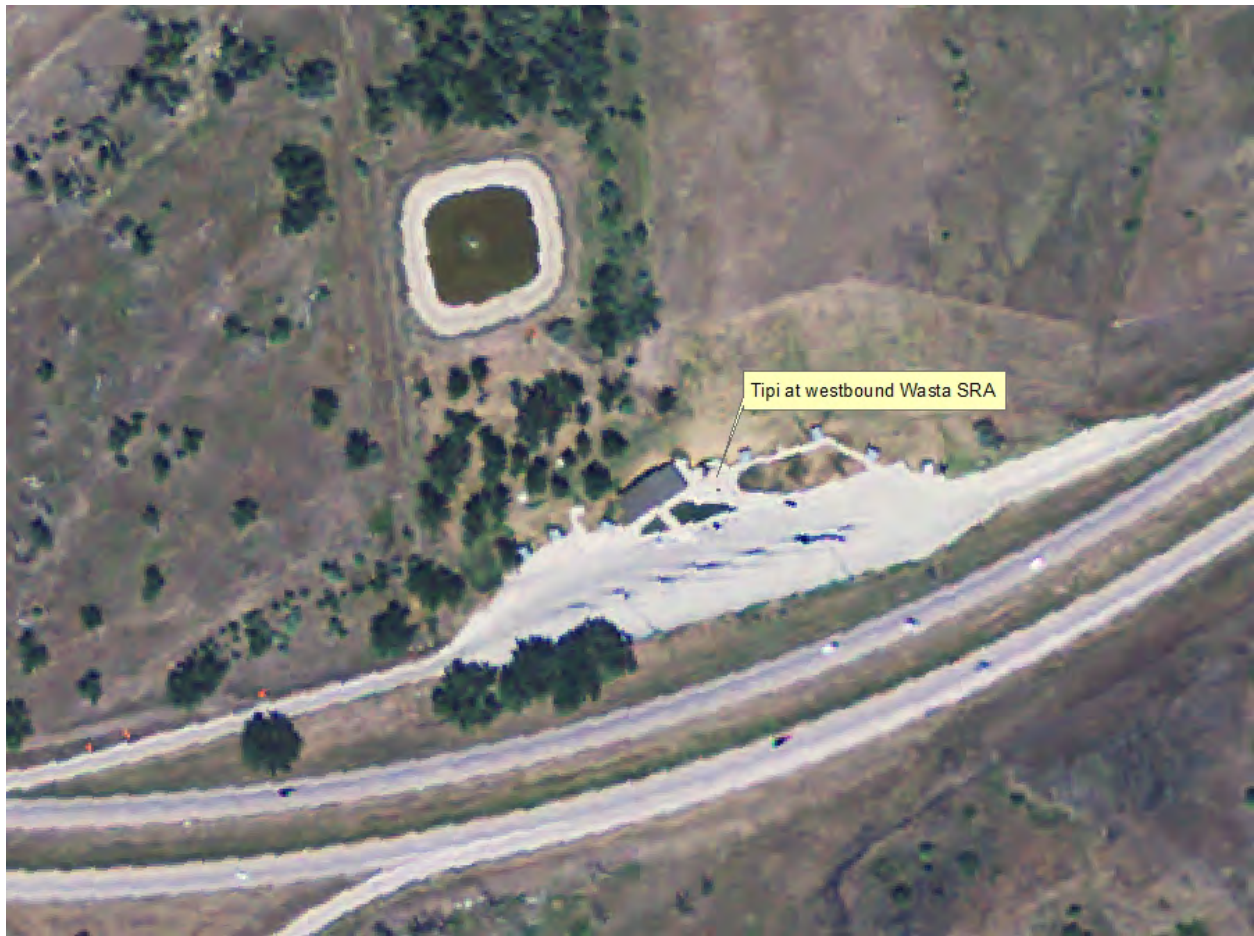
SD_PenningtonCounty_ConcreteInterstateTipisofSouthDakotaMPS_WastaRestStopTipi-Westbound: NW¼, NE¼, S9, T1N, R14E; UTM Z=13 E=705470 N=4882280. 7.5 Minute Quadrangle Map, 1:24,000. Produced in ArcMap 8 August 2014.