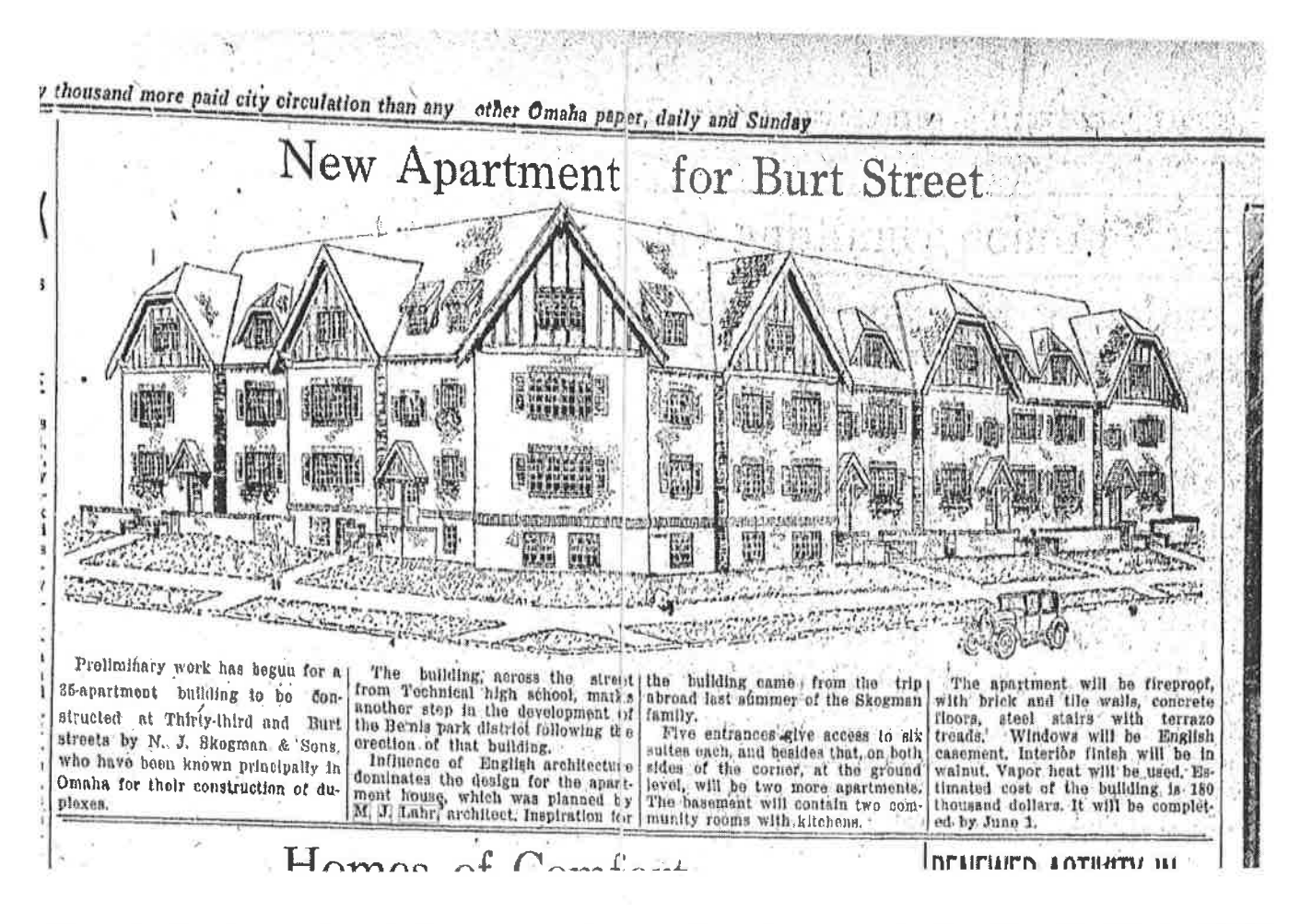
Figure 3: Rendering of the Nottingham Apartments. "New Apartment for Burt Street." Omaha World Herald. January 4, 1925, Pg. 15.