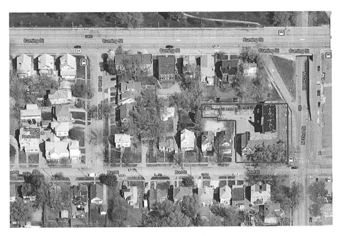
Figure 1: Nottingham Apartments, northwest corner of 33rd Street and Burt Street, Omaha. Boundary outlined in red.

Section number <u>Additional Information</u> Page <u>1</u>