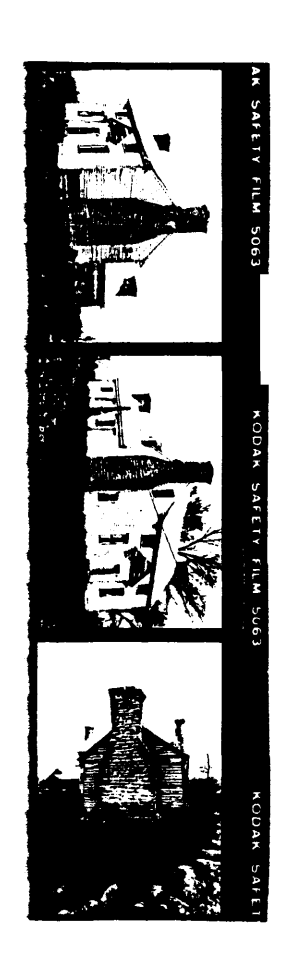
18.(cont.) Log partition between rooms visible where porch removed.