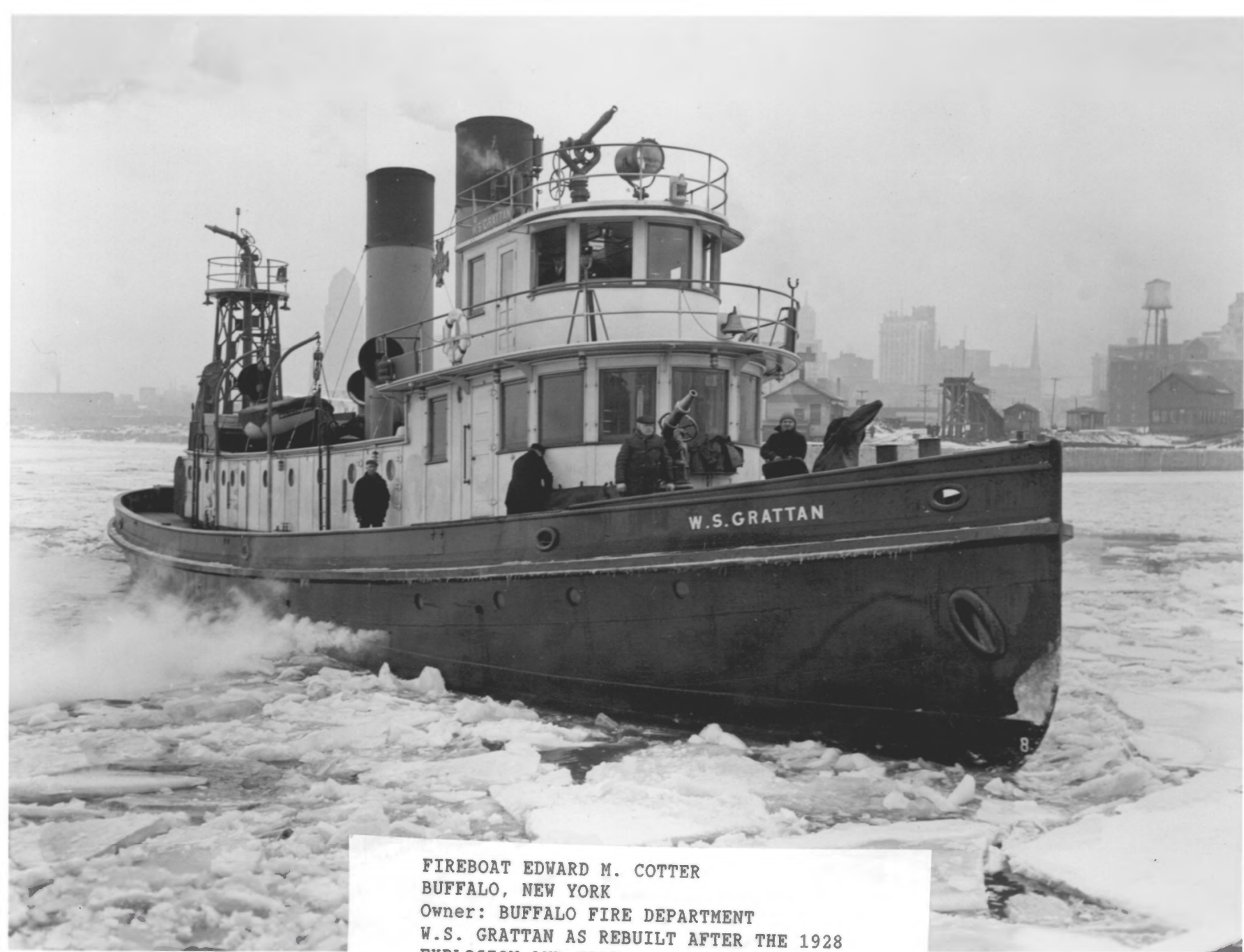
FIREBOAT EDWARD M. COTTER BUFFALO, NEW YORK Owner: BUFFALO FIRE DEPARTMENT W.S. GRATTAN AS REBUILT AFTER THE 1928 EXPLOSION AND FIRE. Photo #2 by UNKNOWN, CIRCA 1960 Courtesy of: BUFFALO & ERIE CO. HIST. SOC.