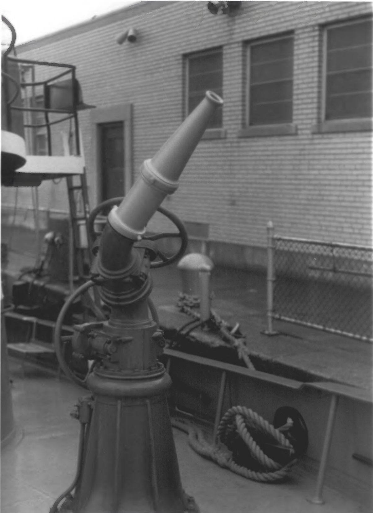
FIREBOAT EDWARD M. COTTER BUFFALO, NEW YORK Owner: BUFFALO FIRE DEPARTMENT BOW MONITOR, PORT SIDE. THIS IS ONE OF THE ORIGINAL, 1900-INSTALLED MONITORS. Photo #7 by JAMES P. DELGADO, 1989 Courtesy of: NATIONAL PARK SERVICE