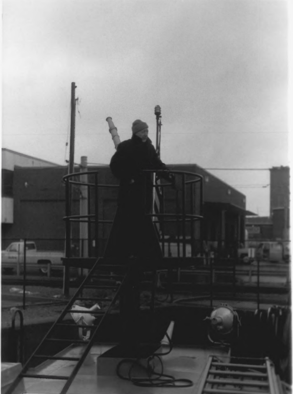
FIREBOAT EDWARD M. COTTER BUFFALO, NEW YORK Owner: BUFFALO FIRE DEPARTMENT HYDRAULIC TURRET TOWER WITH SLIDING LADDER IN THE PROCESS OF ELEVATING. Photo #8 by JAMES P. DELGADO, 1989 Courtesy of: NATIONAL PARK SERVICE