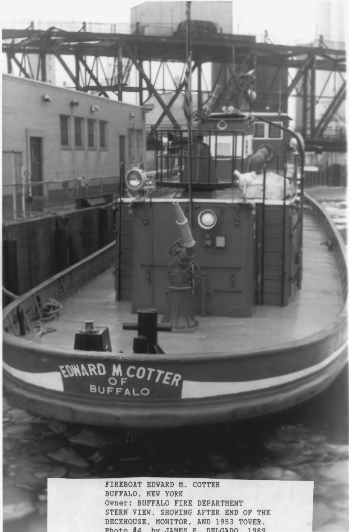
FIREBOAT EDWARD M. COTTER BUFFALO, NEW YORK Owner: BUFFALO FIRE DEPARTMENT STERN VIEW, SHOWING AFTER END OF THE DECKHOUSE, MONITOR, AND 1953 TOWER. Photo #4 by JAMES P. DELGADO, 1989 Courtesy of: NATIONAL PARK SERVICE