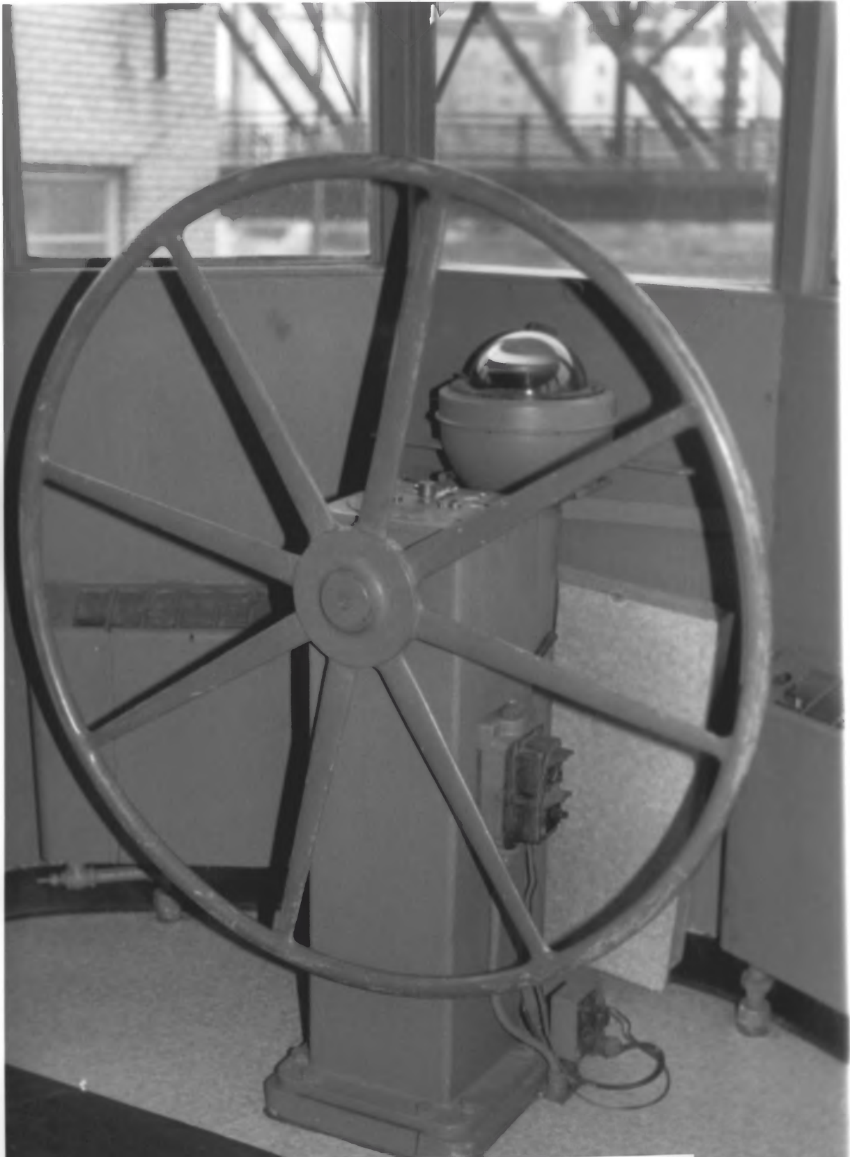
FIREBOAT EDWARD M. COTTER BUFFALO, NEW YORK Owner: BUFFALO FIRE DEPARTMENT PILOTHOUSE INTERIOR SHOWING WHEEL AND BINNACLE.

Photo #11 by JAMES P. DELGADO, 1989 Courtesy of: NATIONAL PARK SERVICE