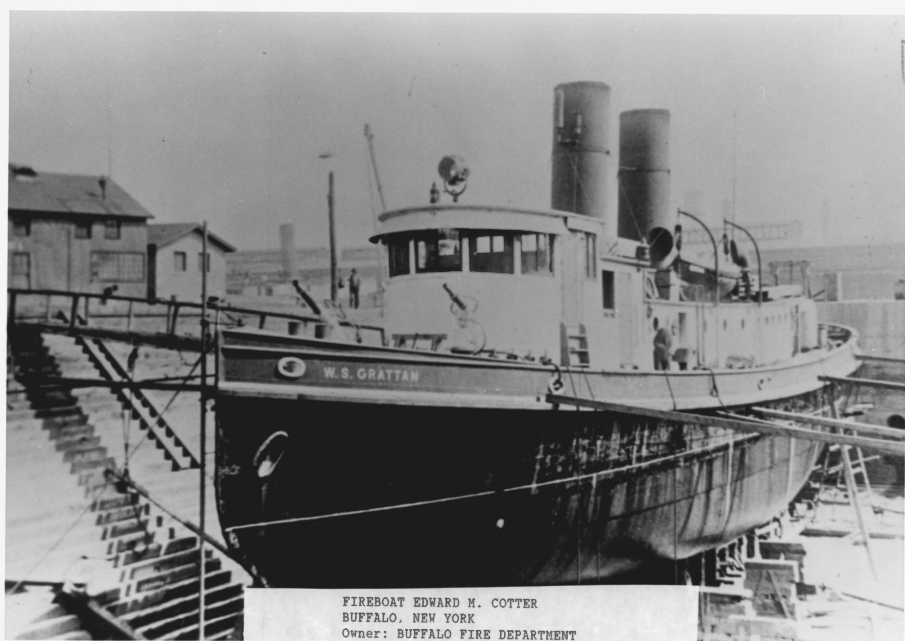
FIREBOAT EDWARD M. COTTER BUFFALO, NEW YORK Owner: BUFFALO FIRE DEPARTMENT COTTER AS W.S. GRATTAN, JULY 1920. Photo #1 by UNKNOWN, 1920 Courtesy of: JACK SUPPLE