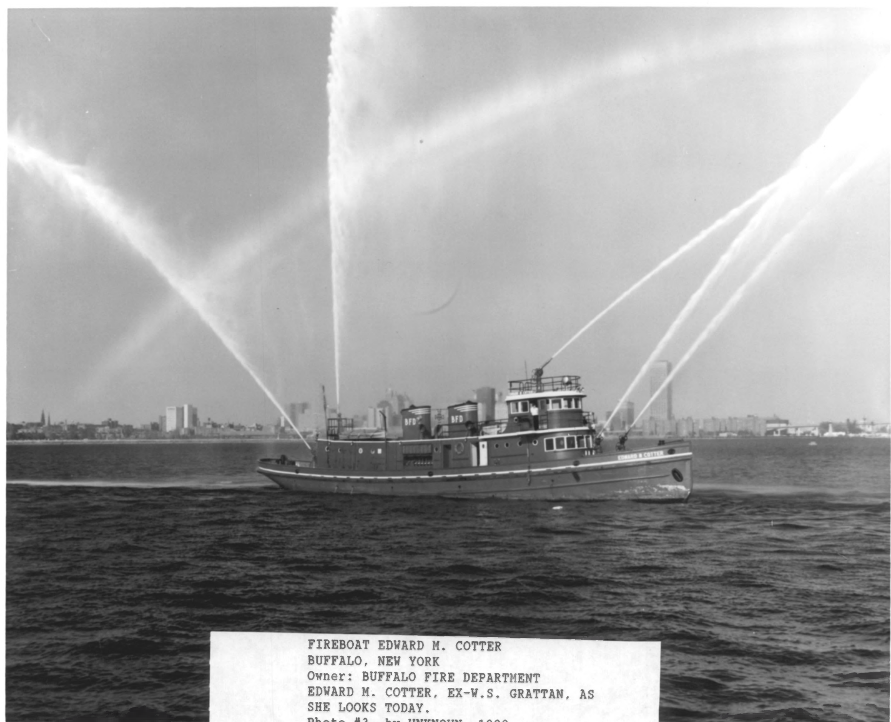
FIREBOAT EDWARD M. COTTER BUFFALO, NEW YORK Owner: BUFFALO FIRE DEPARTMENT EDWARD M. COTTER, EX-W.S. GRATTAN, AS SHE LOOKS TODAY. Photo #3 by UNKNOWN, 1988 Courtesy of: JACK SUPPLE