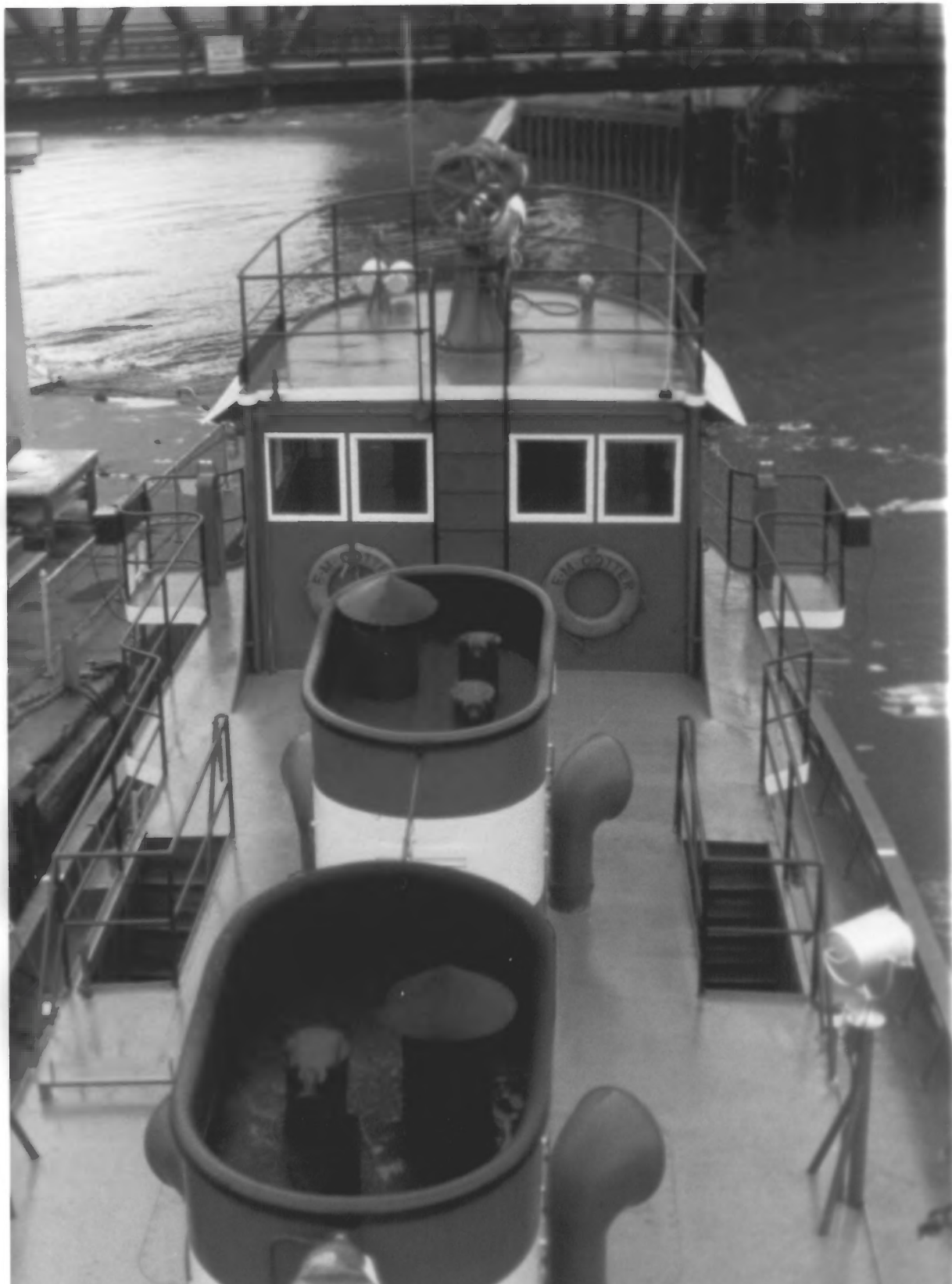
FIREBOAT EDWARD M. COTTER BUFFALO, NEW YORK Owner: BUFFALO FIRE DEPARTMENT VIEW FROM TOWER OF UPPER (BOAT) DECK AND PILOTHOUSE.

Photo #5 by JAMES P. DELGADO, 1989 Courtesy of: NATIONAL PARK SERVICE