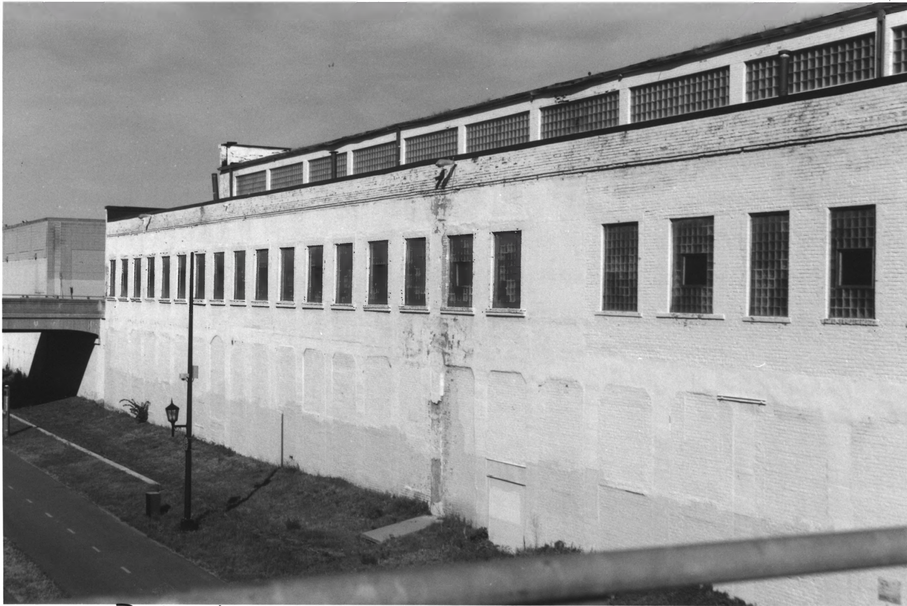
CM & ST P Grade Separation Hennepin Co., Mn 014510-1A