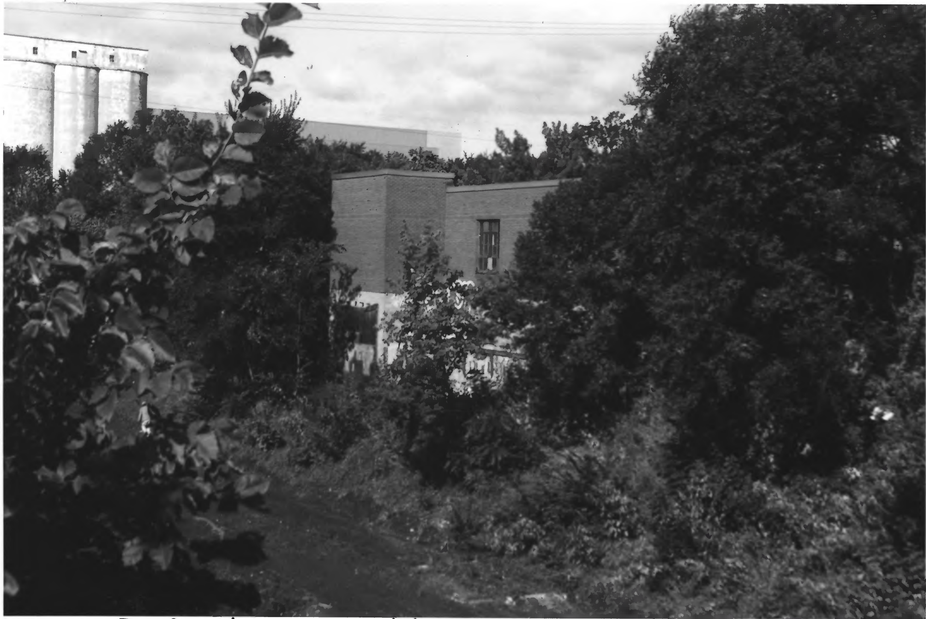
OM + STP Grade Separation Hennepin Co., MN 014508 - 15/15A