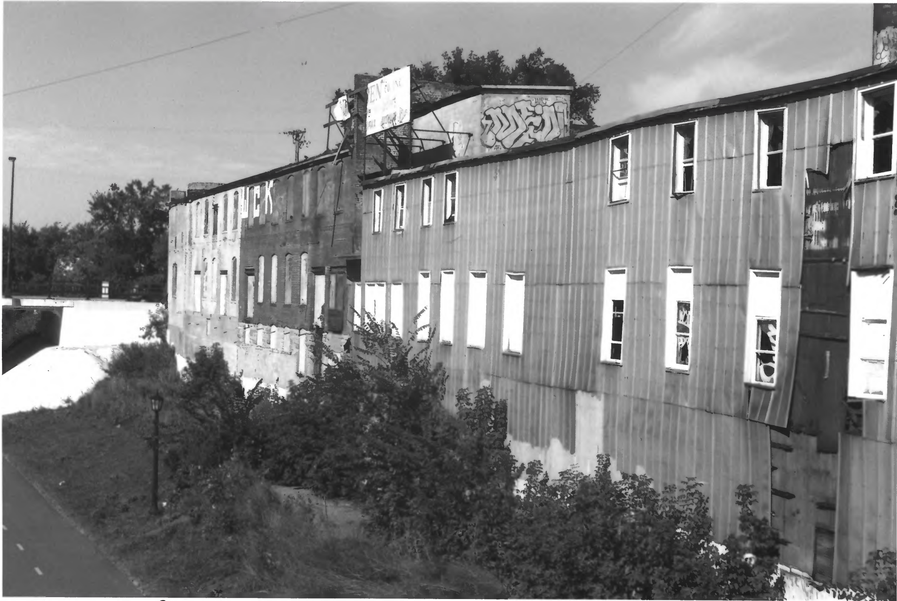
OM + STP Grade Separation Hennepin Co., Mn 014510-16A/17