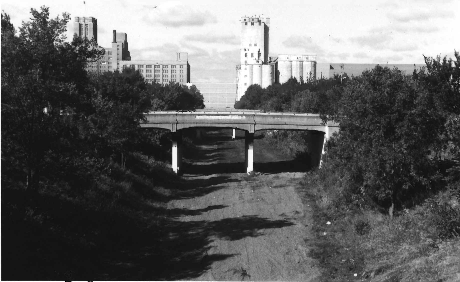
CM + STP Grade Separation Hennepin Co., Mn 014508 - 11/11A