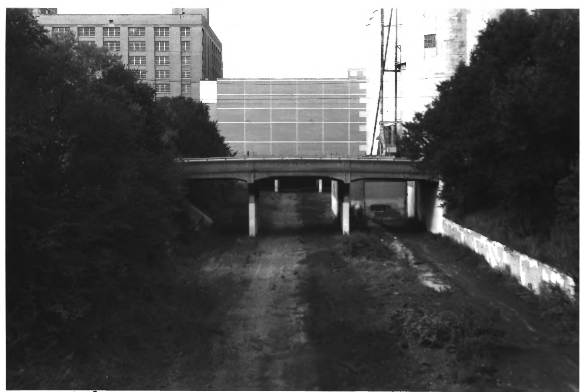
CM + STP Grade Separation Hennepin Co., Mn 014508 - 18118A