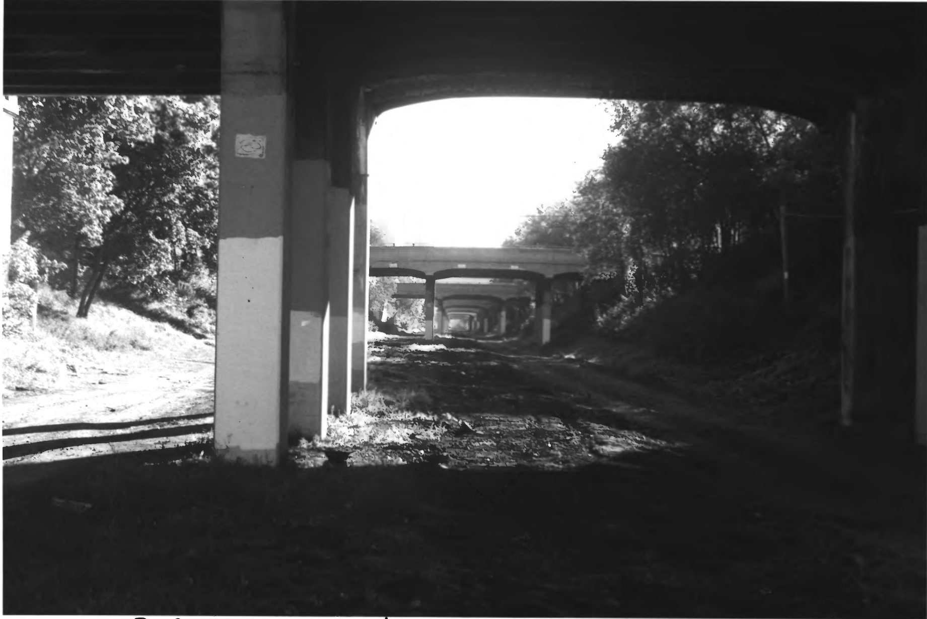
© M + ST P Grade Separation Hennepin Co., Mn 014509- 11/11A