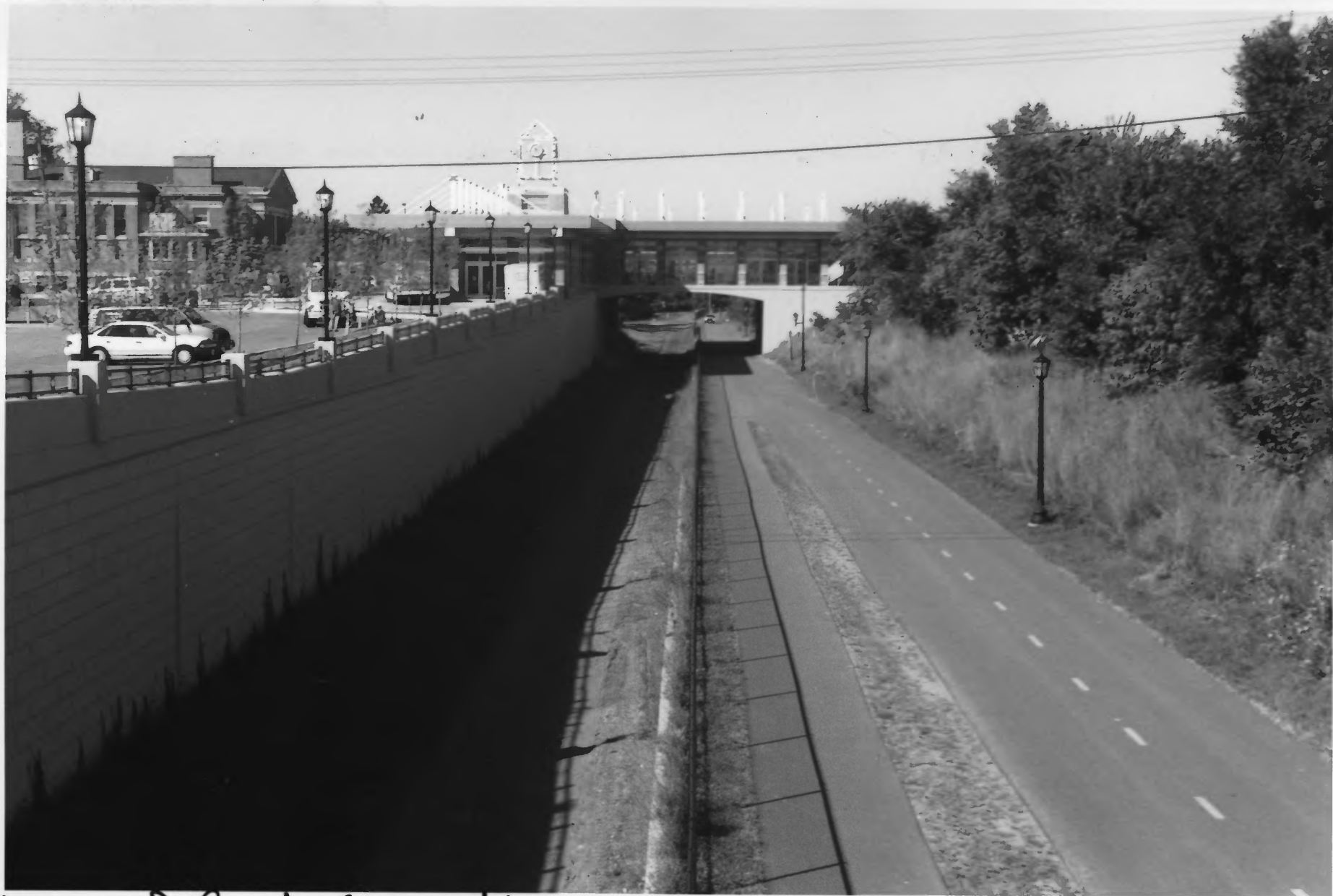
CM + STP Grade Separation Hennepin Co., MN 014510-24A