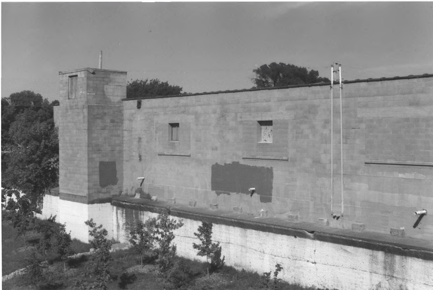
CMR St P Grade Separation Hennepin Co., MN 014510-22A/23