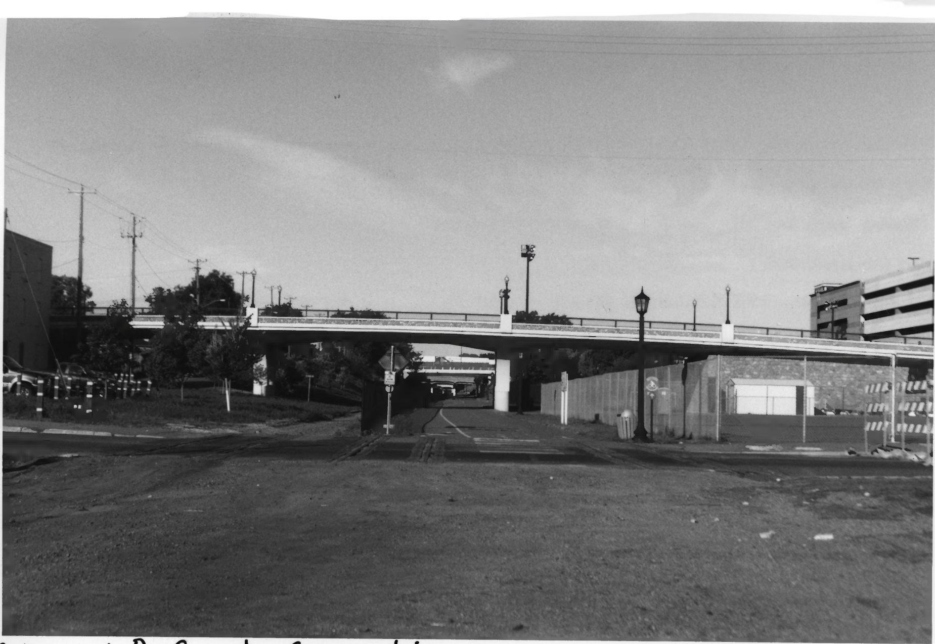
2nd St P Grade Separation Hennepin Co., Mn 014509-14/14A