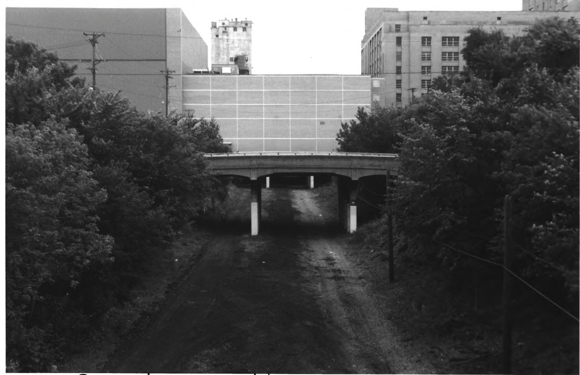
CM + STP Grade Separation Hennepin Co., MN 014509-414A