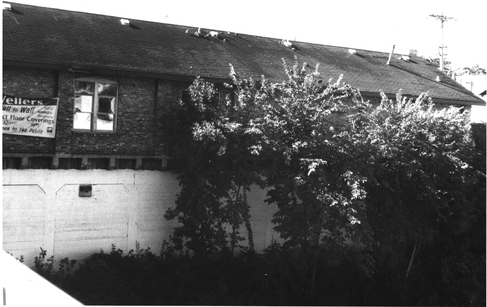
CM & St P Grade Separation Hennepin Co., Mn 014510 - 5A/6