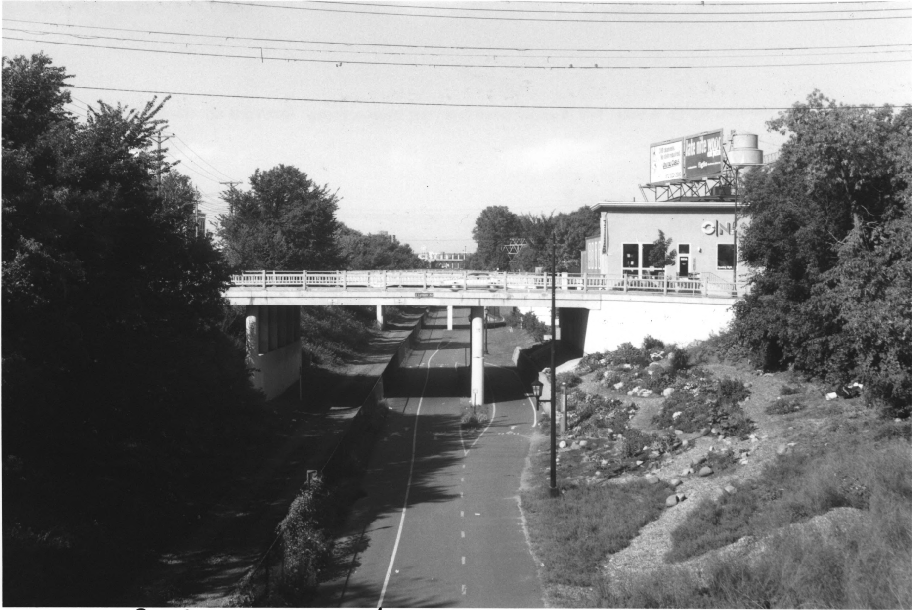
CM + St P Grade Separation Hennepin Co., Mn 014510 - 9A110