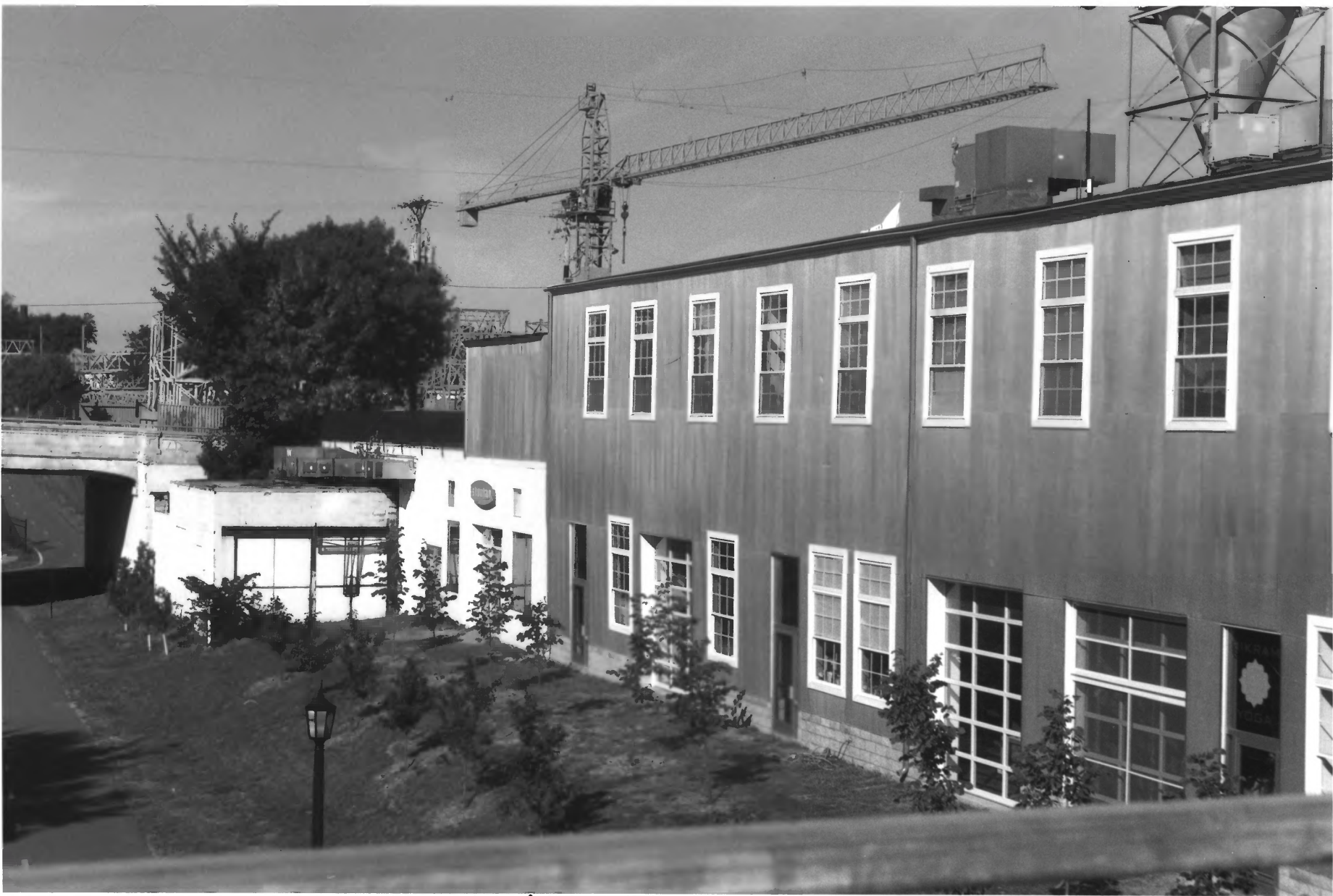
CM + StP Grade Separation Hennepin Co., MN 014510-10A/11