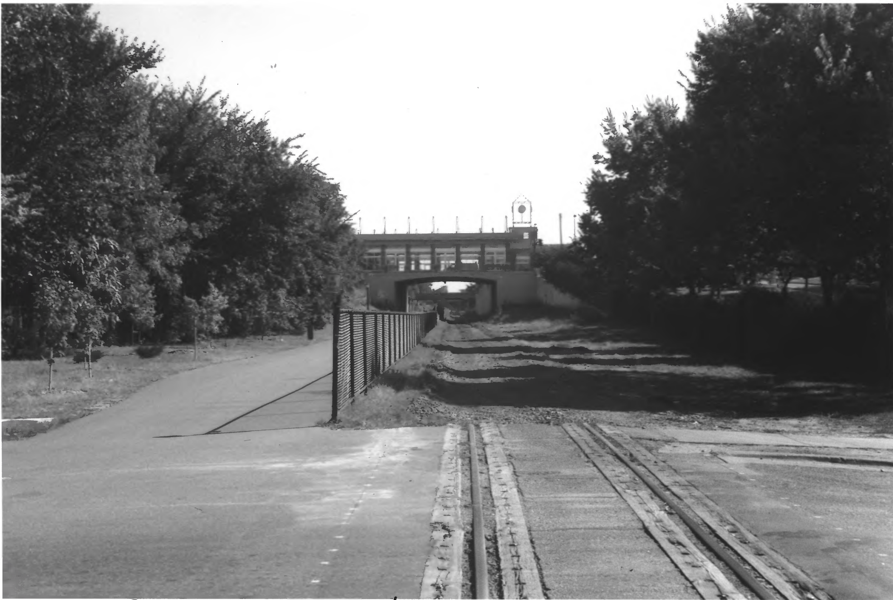
CM + ST P Grade Separation Hennepin Co., MN 014511-1A/2