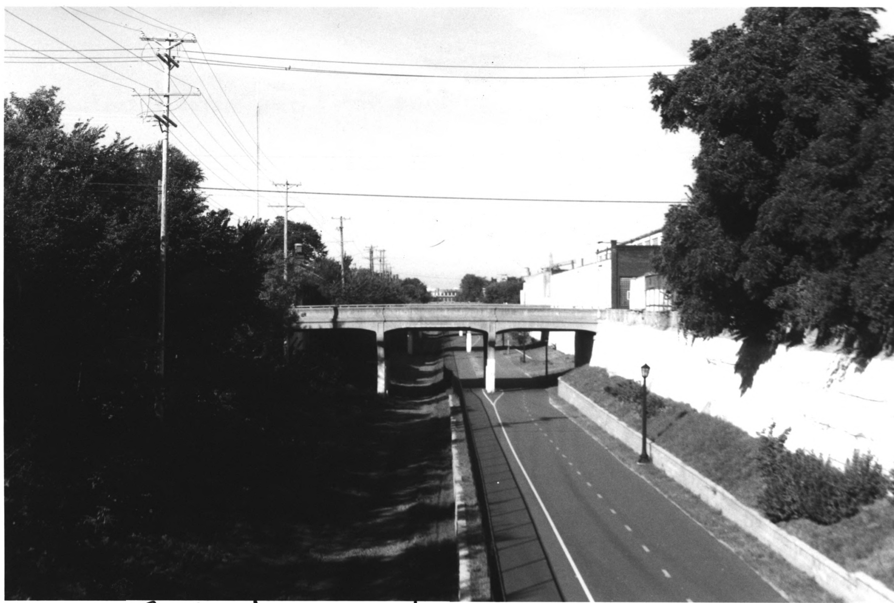
@ M + St P Grade Separation Hennepin Co., Mn 014510-0A