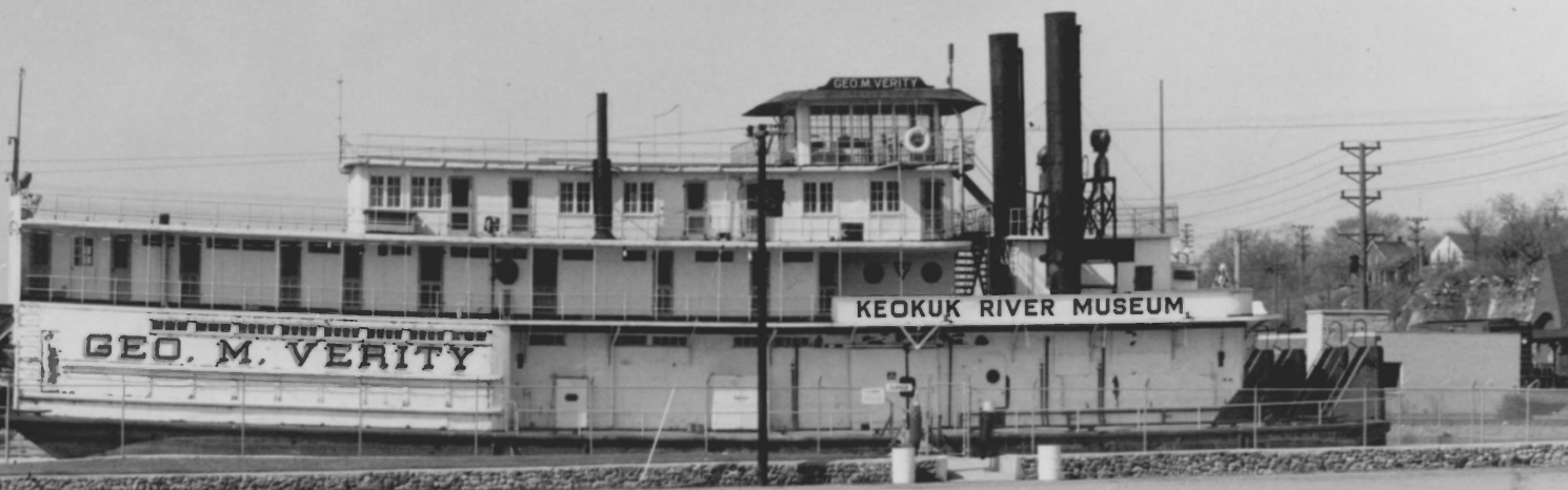
GEO. M. VERITY KEOKUK, IOWA Owner: KEOKUK RIVER MUSEUM Broadside view, in dry berth Photo # 4 by UNKNOWN, 1988 Courtesy of: KEOKUK RIVER MUSEUM