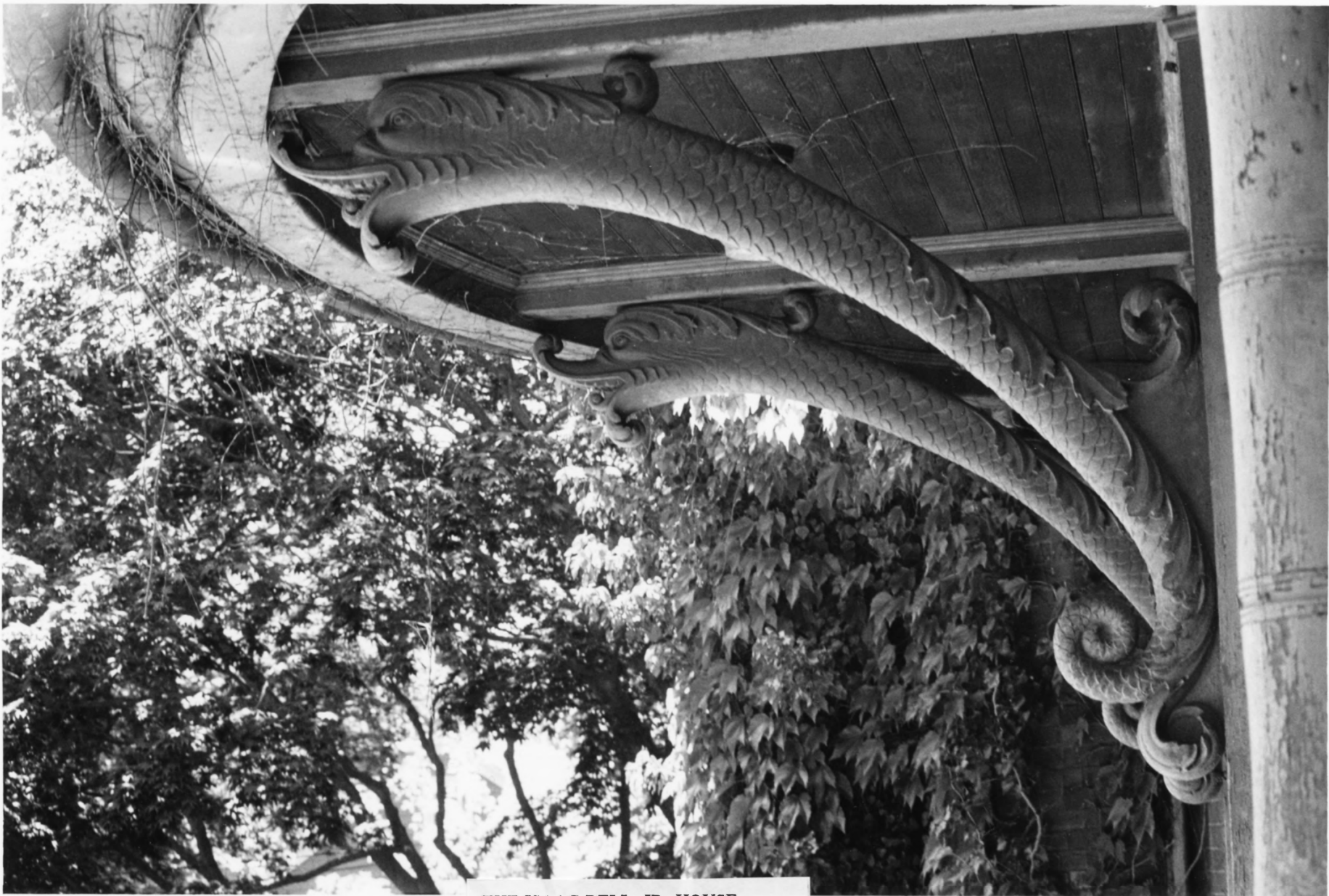
THE ISAAC BELL, JR. HOUSE Newport, Rhode Island Dolphins brackets