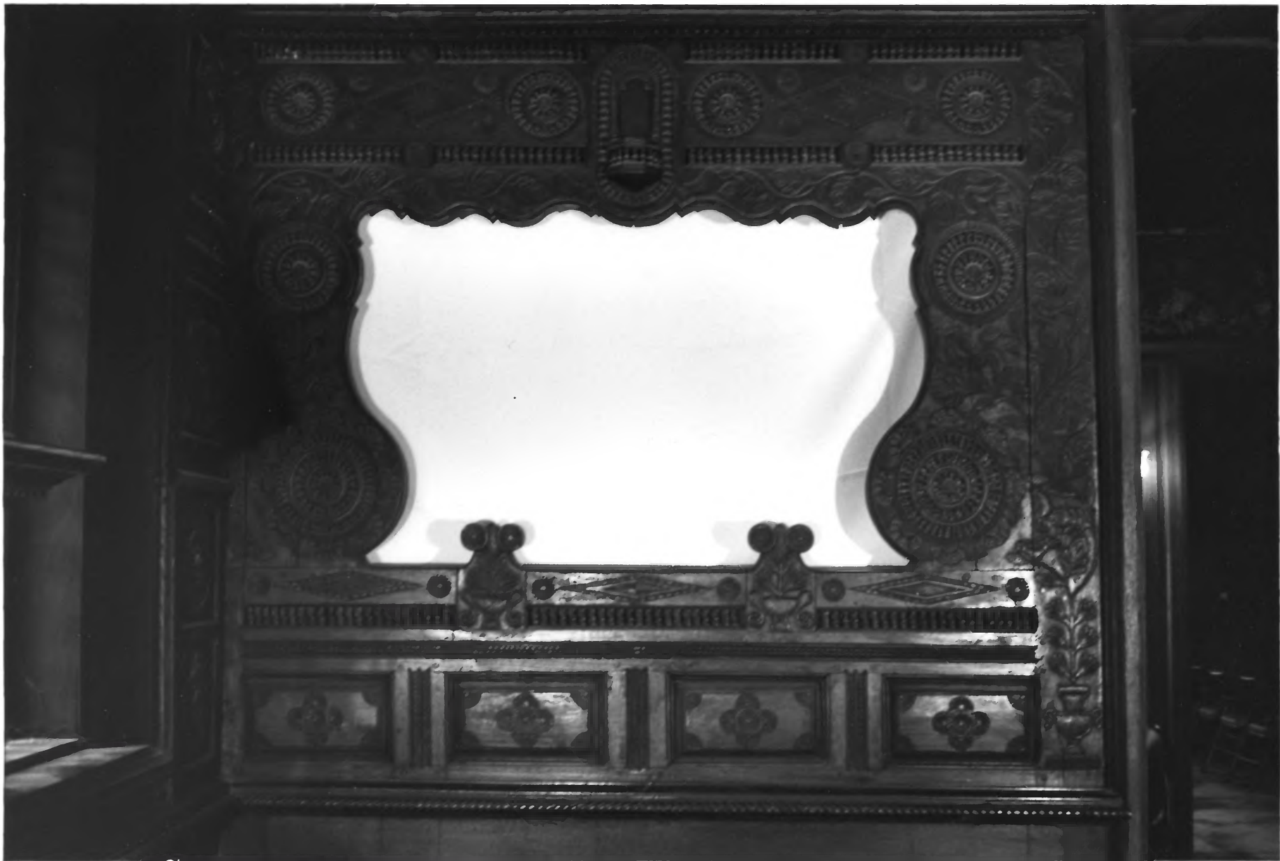
THE ISAAC BELL, Jr. HOUSE Newport, Rhode Island North Panel of fireplace alcove.