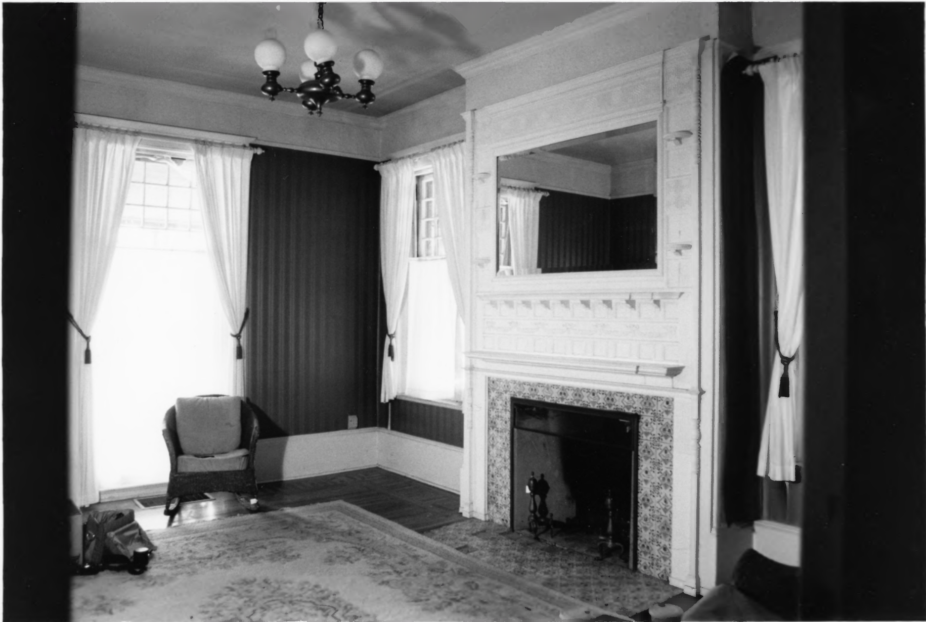
THE ISAAC BELL, Jr. HOUSE Newport, Rhode Island Reception Room