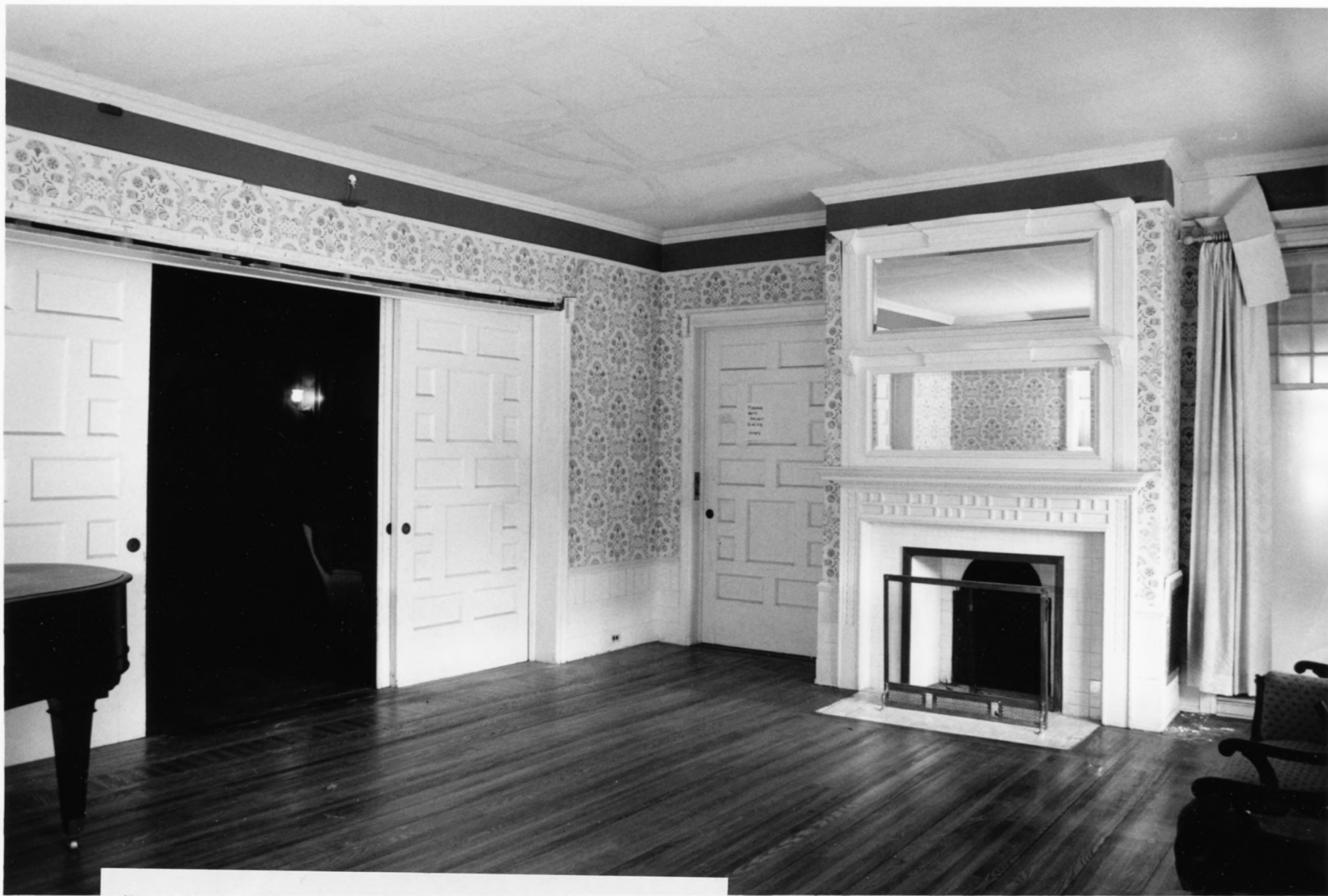
THE ISAAC BELL, Jr. HOUSE Newport, Rhode Island Drawing Room

The brightness of the drawing room is a marked contrast to the dark living hall.