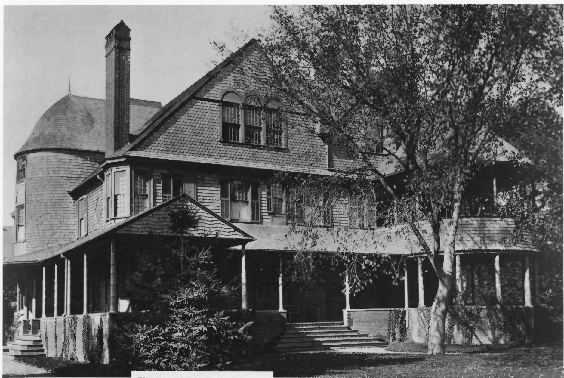
THE ISAAC BELL, JR. HOUSE Newport, Rhode Island Historic Photo of the Front Facade c. 1886 Photo: Artistic County Seats (1886-87) by George Sheldon