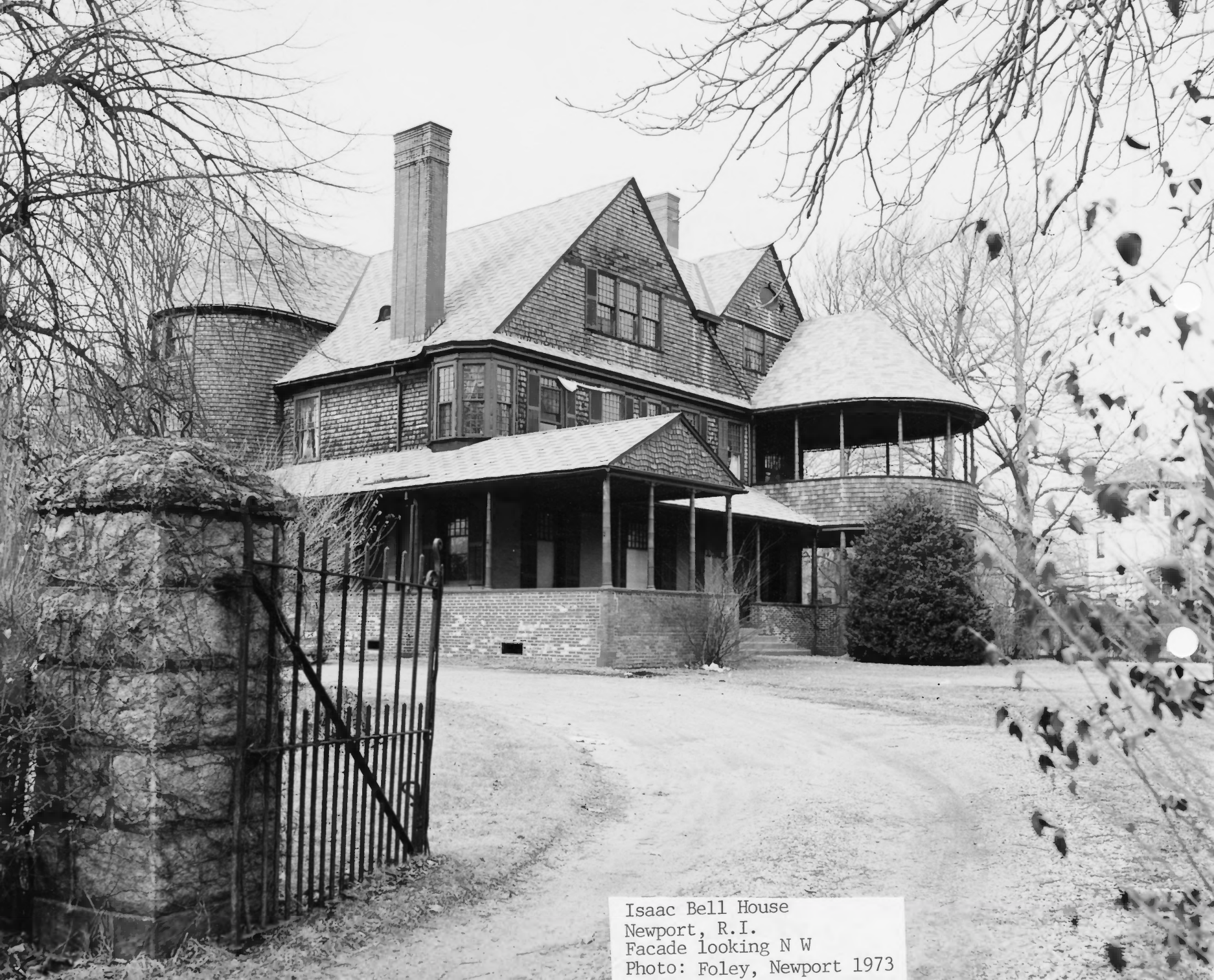
Isaac Bell House Newport, R.I. Facade looking N W Photo: Foley, Newport 1973