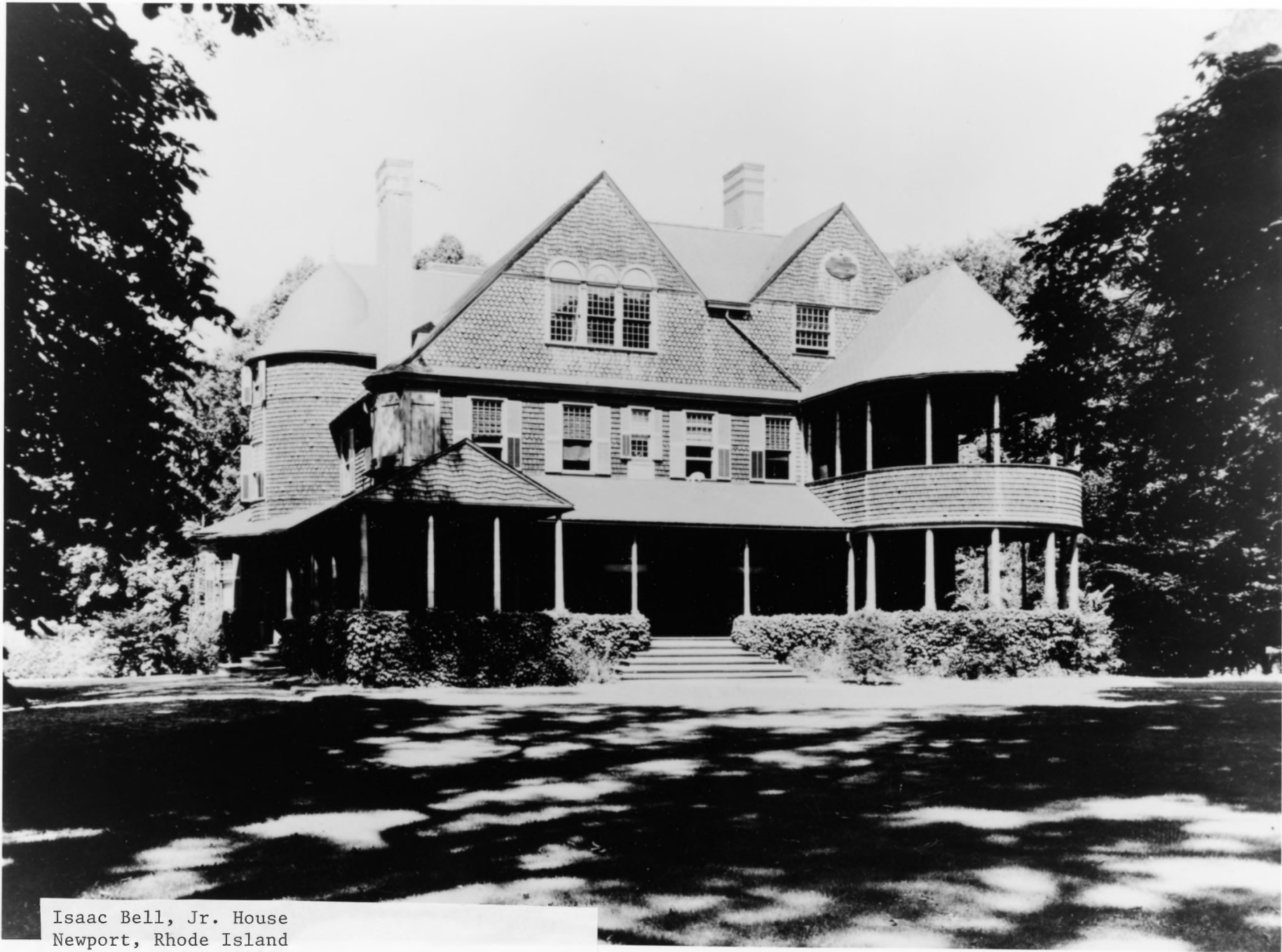
Isaac Bell, Jr. House Newport, Rhode Island East Elevation c.1950