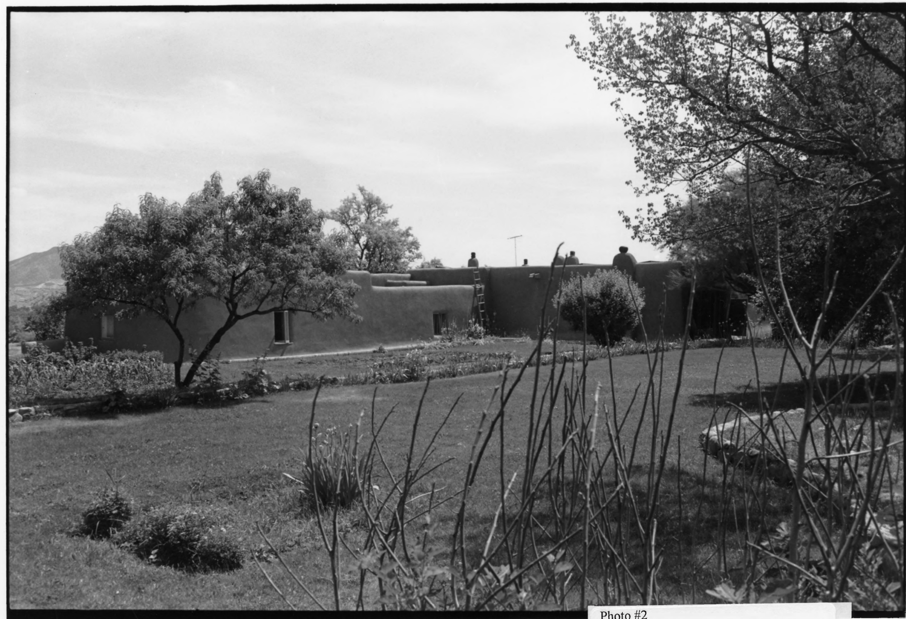
Photo #2 O'Keeffe, Georgia, Home and Studio Abiquiú, New Mexico South and west elevations, looking northeast from garden. HABS, 1996