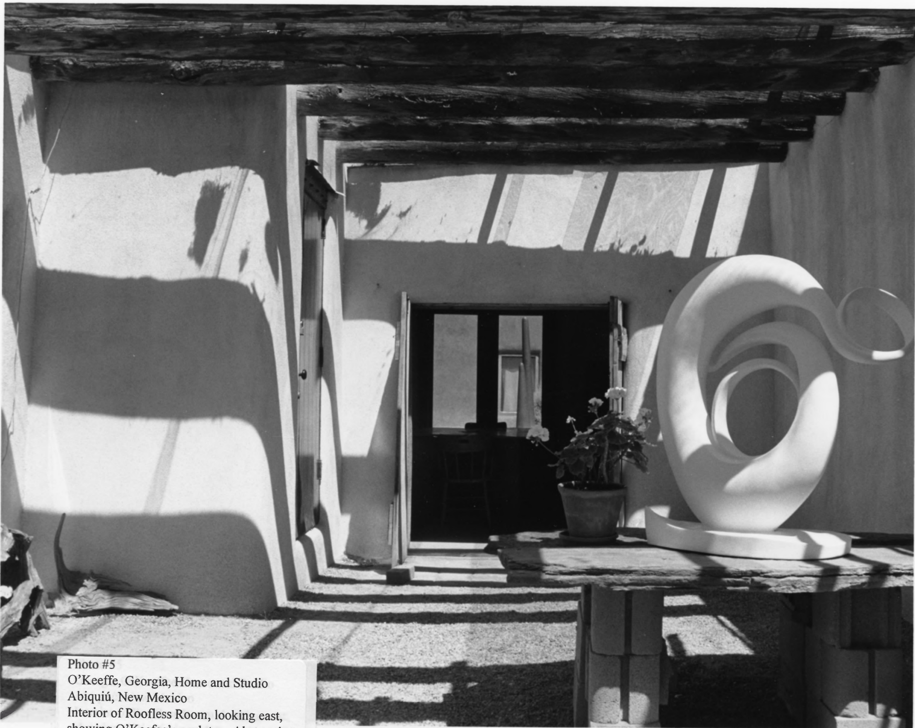
Photo #5 O'Keeffe, Georgia, Home and Studio Abiquiú, New Mexico Interior of Roofless Room, looking east, showing O'Keeffe's sculpture Abstraction . HABS 1996