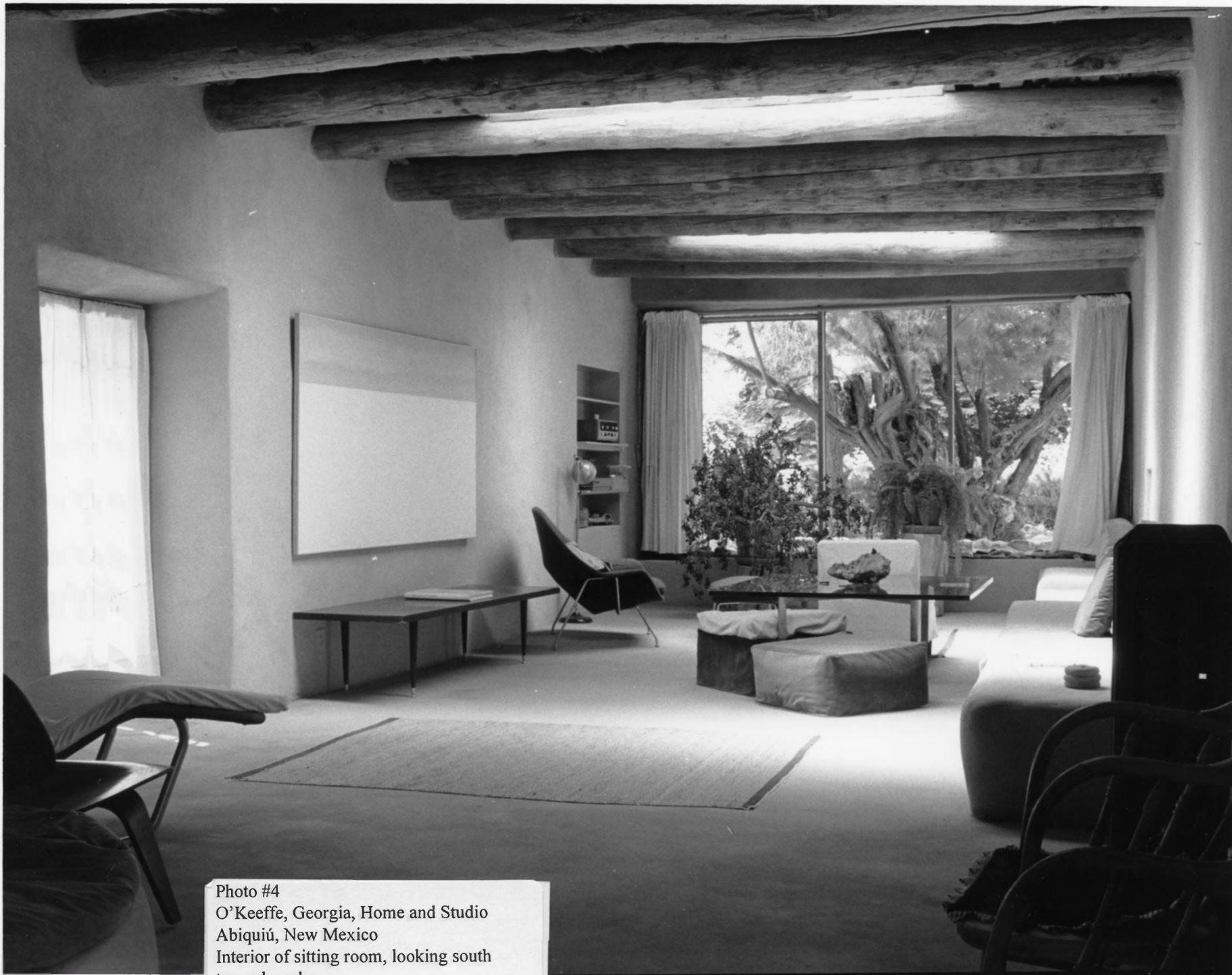
Photo #4 O'Keeffe, Georgia, Home and Studio Abiquiú, New Mexico Interior of sitting room, looking south toward garden. HABS, 1996