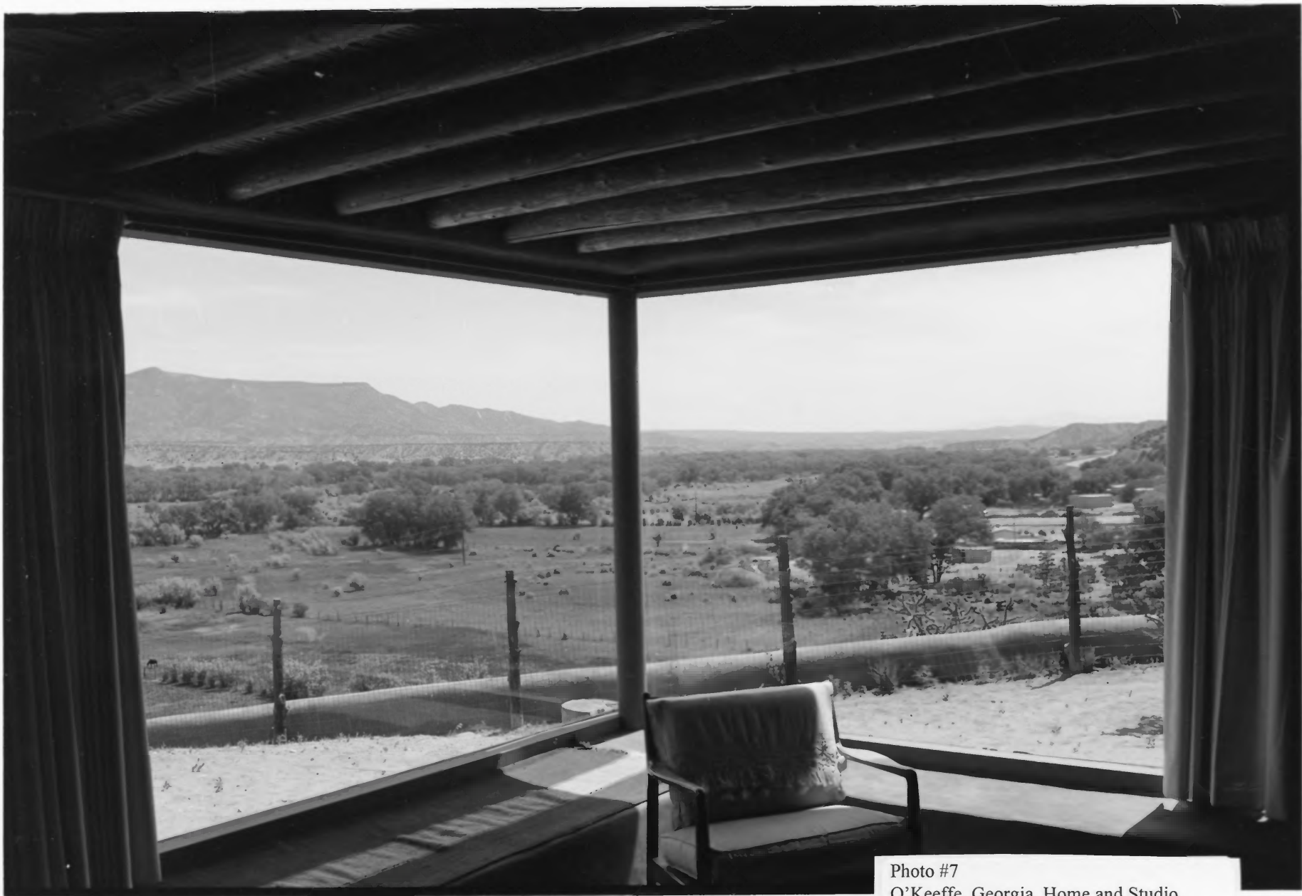
Photo #7 O'Keeffe, Georgia, Home and Studio Abiquiú, New Mexico Bedroom, looking northeast into Chama River Valley. HABS, 1996