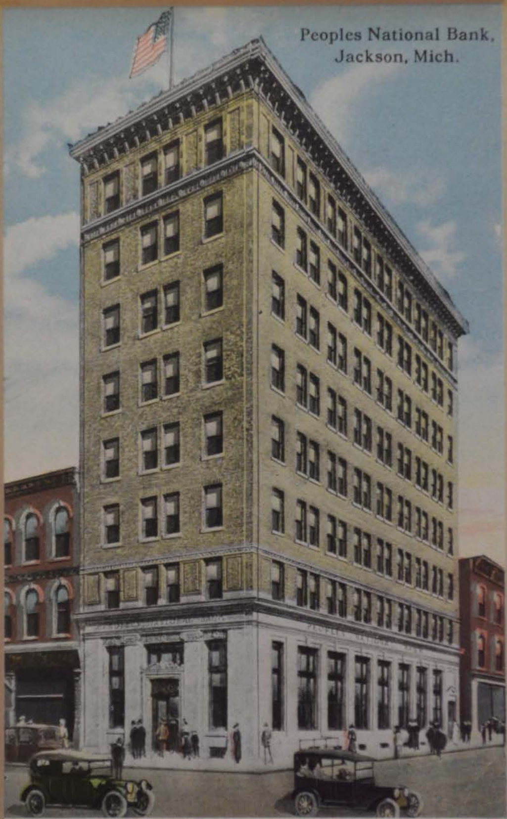
Peoples National Bank, Jackson, Mich.