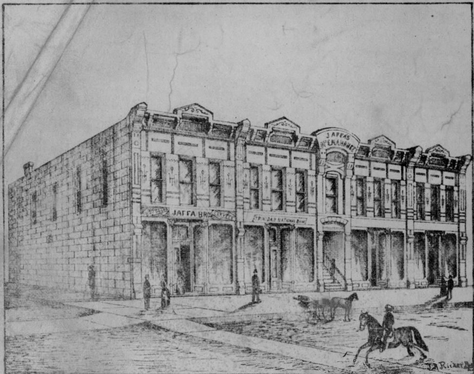
JAFFA OPERA HOUSE BLOCK.

drop slightly in such a way that the cars will carry themselves to the dump of their own weight. If Trinidad was dependent alone on her coal interests her future would be assured. They alone would in time make her the leading railroad, manufacturing and smelting city of the west.