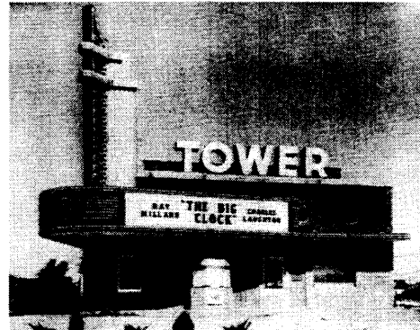
Tower Theatre, 1948.

Also, an illustration of Art Moderne-gone-whimsical was seen in the Big Bun Restaurant (c. 1946, 4724 E. Central. Demolished). 2 The popularity of rounded shapes was turned into a representation of a hamburger bun-shaped café that served sandwiches on oversized buns. High gloss metal and neon emphasized the sleek look of the times. Streamlining was typically emphasized in signage, which was usually an integral part of the architecture as seen in the neon waterfall effect and rounded lettering of the Miller Theater marquee (installed 1940, 115 N. Lawrence. Demolished), and the wing-shaped Santa Fe logo on the Union Bus Depot sign (1942, 312 S. Broadway. Extant). Another streamlined theater, the Tower, which employed a curved marquee, wave motifs, and porthole windows, was built across the street from the Big Bun in 1948.