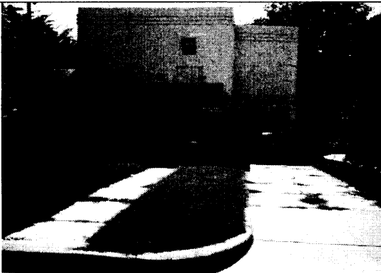
617 N. Bluff, 2004.