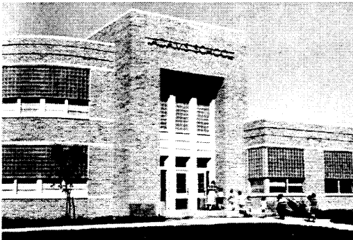
Adams Elementary School, 1948.

As in many other U.S. cities, Art Moderne styling in commercial and public architecture was common in Wichita. Examples of the style in public structures are Adams Elementary School (1947, 4802 E. 9th Street. Extant), Fire Station #9 (1947, 4704 E. Kellogg. Demolished), and the Union Bus Depot (1946, 308-316 S. Broadway. Extant). Commercial buildings are represented by the Griffin office building (1940, 416 S. Market. Extant), Whitney Standard Service Station (1942, 731 N. Broadway. Extant), the Rounds and Porter Lumber Company (1947, 430 N. Waco. Extant), and the Tower Theatre (1948, 4800 E. Central, second floor, marquee and sign demolished, basic building extant).