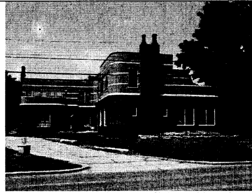
102-104 N. Pinecrest, 2006.

A single-family residence at 617 N. Bluff exhibits the style in modest proportions. The plain stucco walls are ornamented with horizontal banding. The roof is flat; the proportions are asymmetrical, but the house is without any rounded elements.