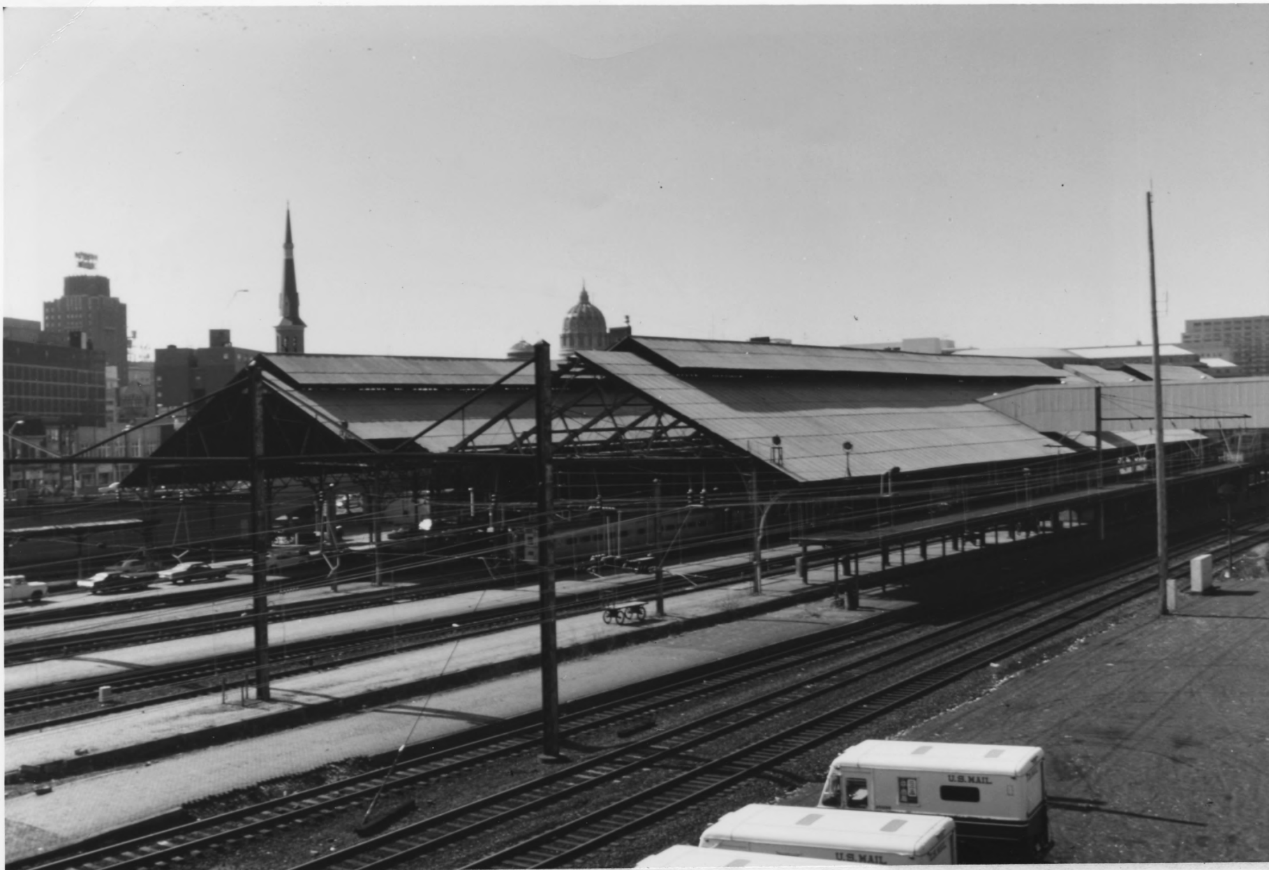
Penn Central Railroad Station and Shed, Harrisburg, Pennsylvania Aberdeen Street