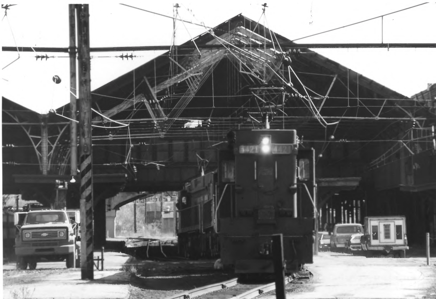
Penn Central Railroad Station and Shed, Harrisburg, Pennsylvania