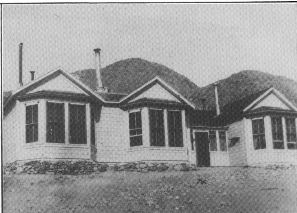
View Looking west at front facade Date c. 1906