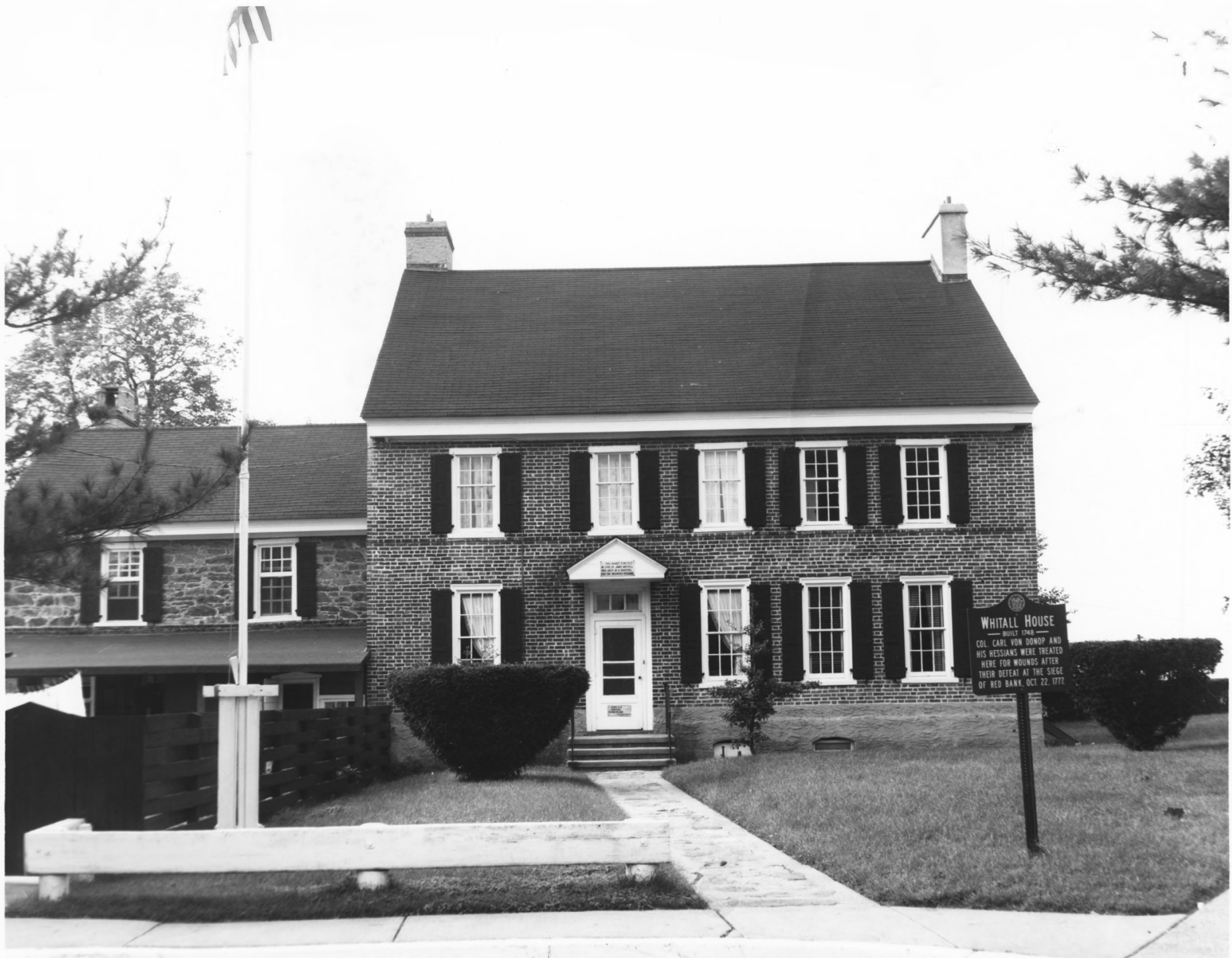
James Whitall House, Red Bank Battlefield, National Park, New Jersey