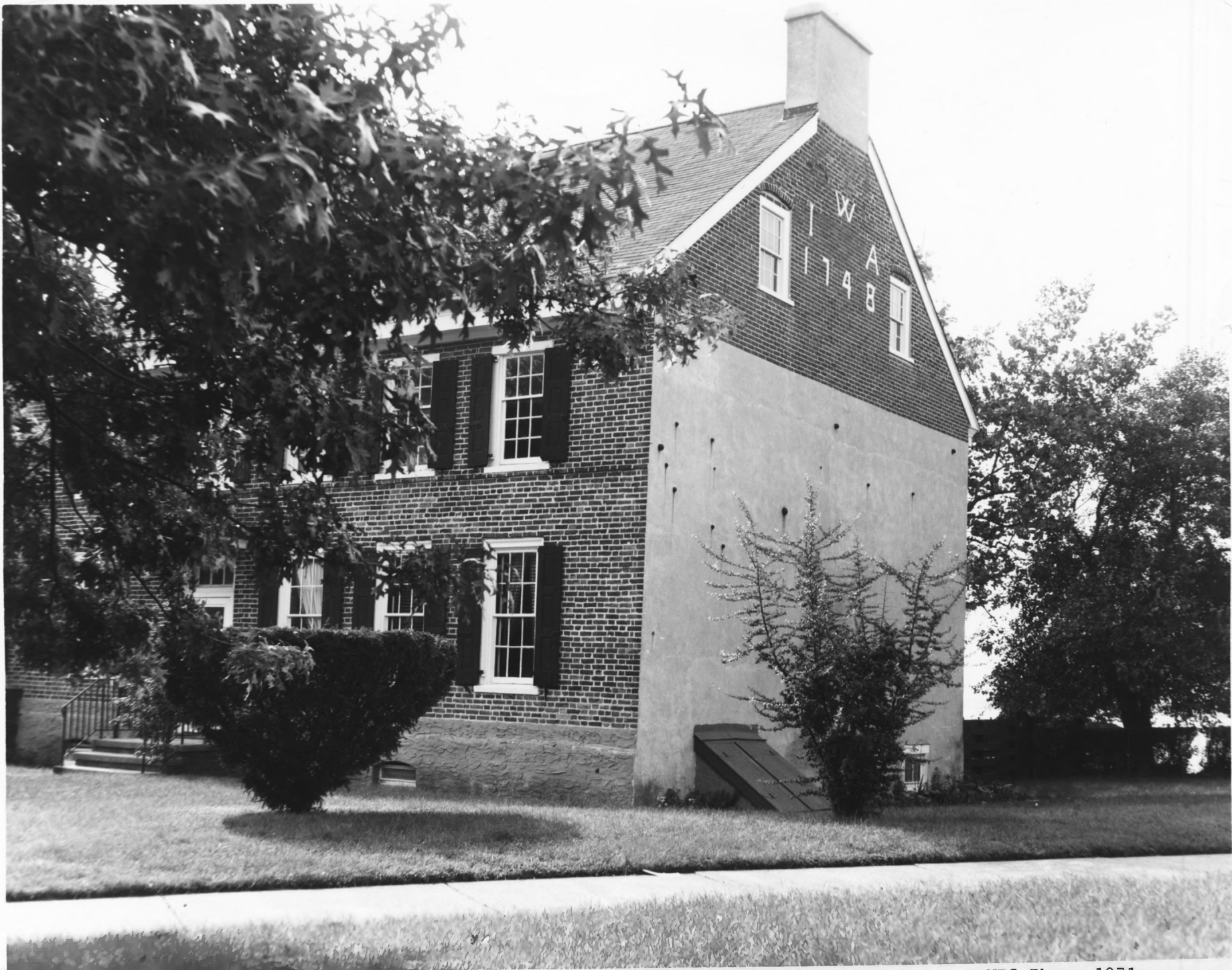
James Whitall House--Note cannon balls embedded in north wall. Red Bank Battlefield, National Park, New Jersey.