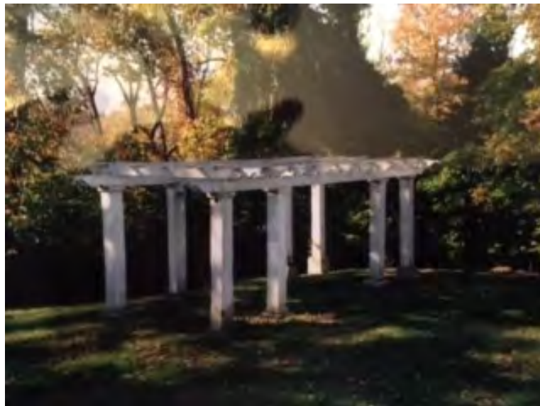
Historic view of Pergola published in a magazine