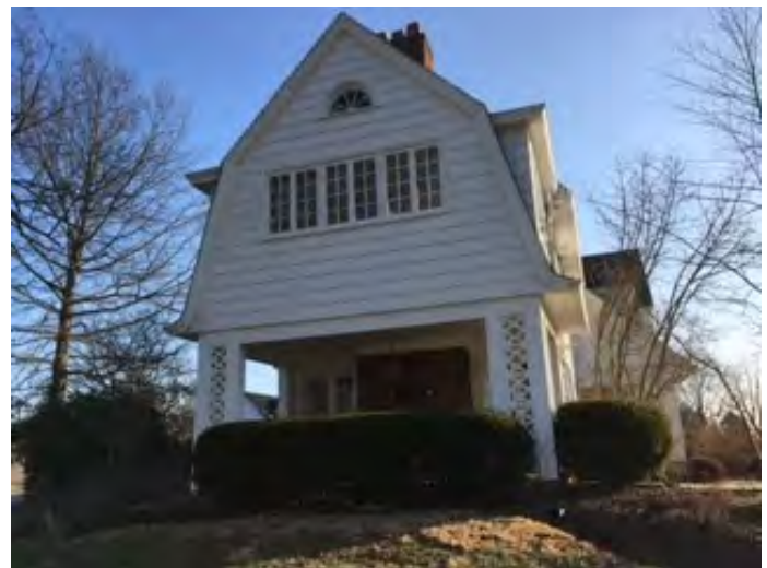
West Side façade