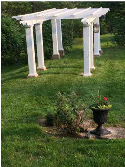
Current view of Pergola

The pergola has a concrete base and 8 wood columns and wooden planks on top.