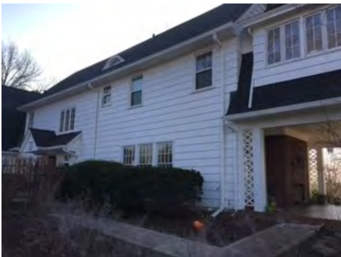
North side (back)

The house's large gambrel roof is most evident on the east side, as is the house's full two-floor height. A single dormer is visible on this side. The roof also has numerous gangs of triple 8-over-8-light double-hung sash windows. Windows and most doors were made of white pine.