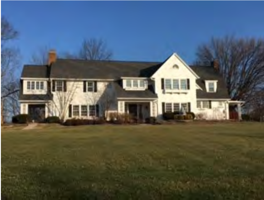
South (main) façade

house has many windows, several ganged in sets of three, others puncturing the wall singly, all with double-hung 8-over-8 wood sashes. Numerous porches, a porte cochere on the west, a bay-sized room, and dormers project from the main body of the house. The many projections and windows allow for a great deal of natural light to pass into the house.