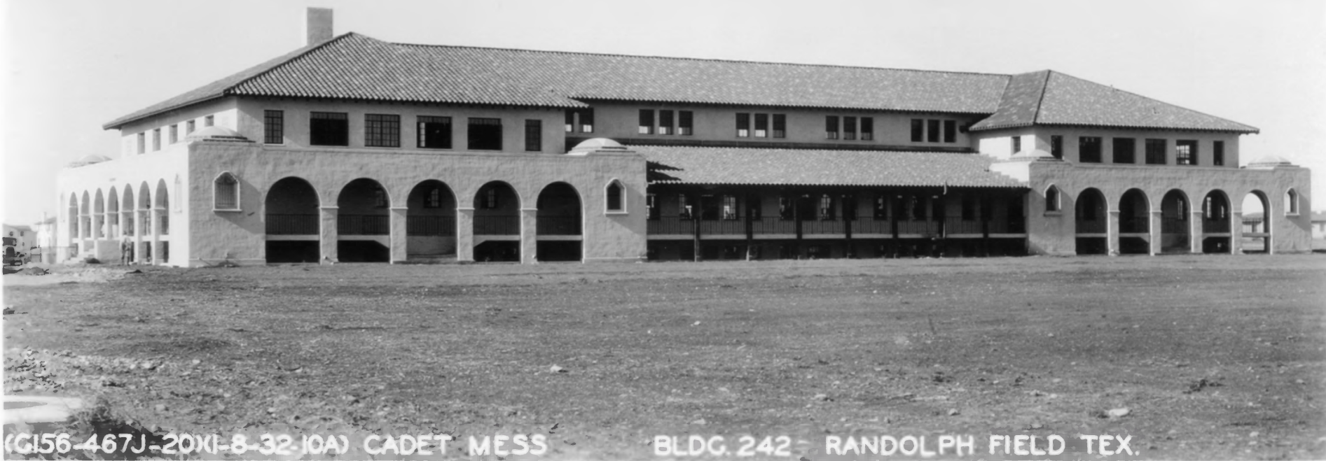
(G156-467J-20)(I-8-32-10A) CADET MESS