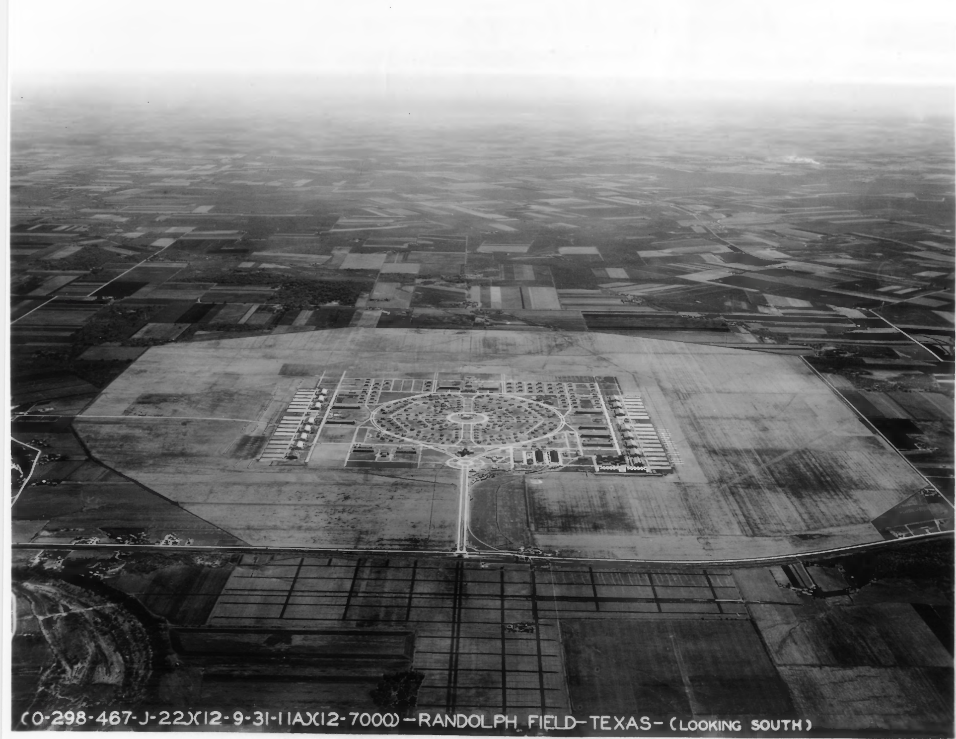
(O-298-467-J-22)(12-9-31-11A)(12-7000) - RANDOLPH FIELD - TEXAS - (LOOKING SOUTH)