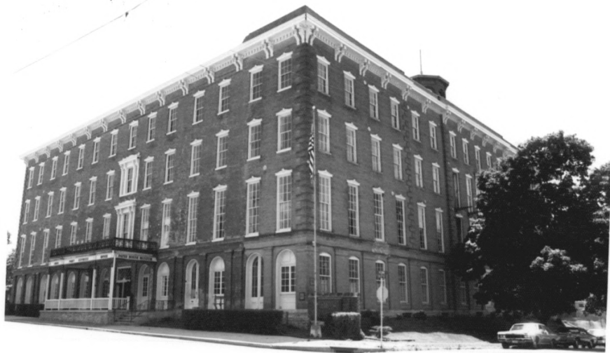
View SE, looking at N and W exposures of building. These two sides have been restored. Note new porch. Note brick work done to restore window, 3rd window S, 2nd floor, W exposure.