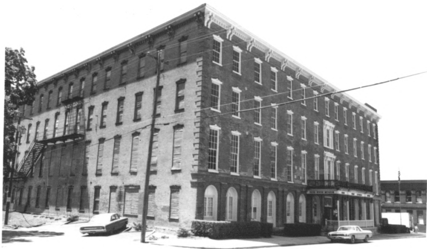
View SW, looking at N and E exposures. Restoration work is currently being planned for E and S exposures.