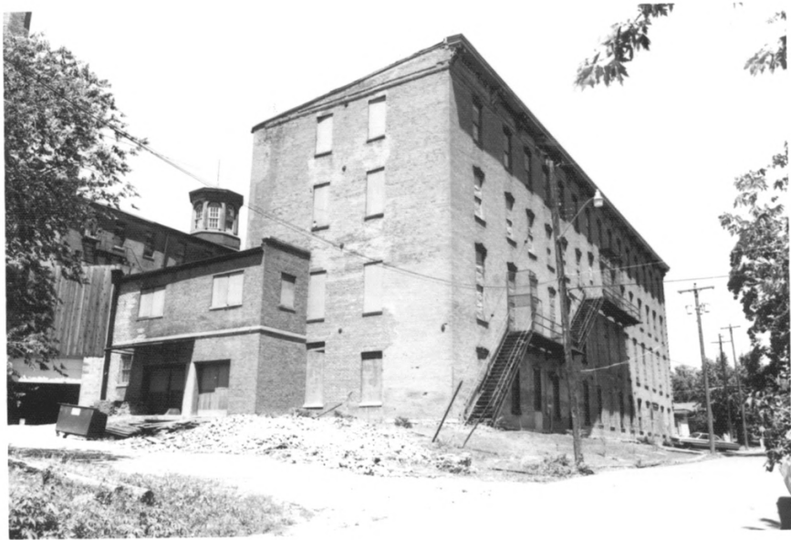
View NW, looking at S and E exposures. Pile of bricks is being used to build veneer over concrete blocks used when display area was enlarged. Note cupola.