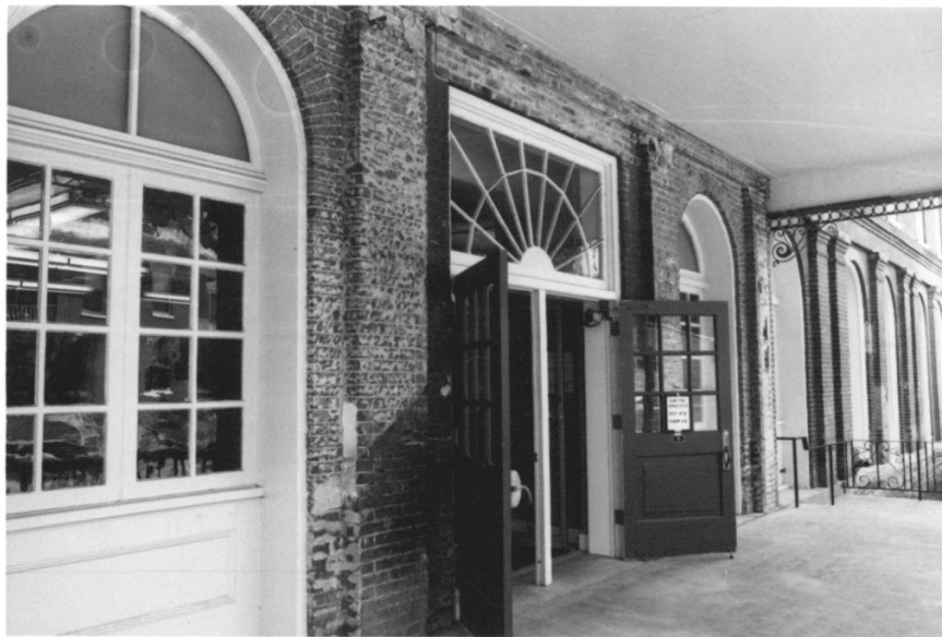
View of recently installed porch and restored main entrance. Plaque will be mounted on one of these brick columns. Note lighter brick, exposed during restoration - this brick in need of preservative treatment.