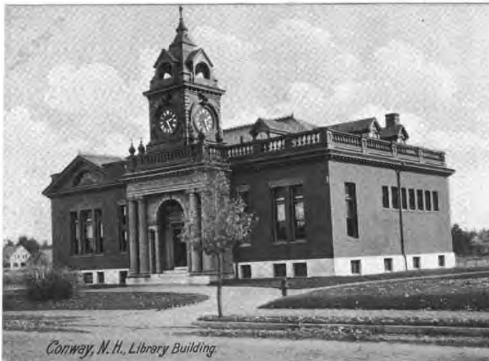
Illustration 2. Undated postcard showing the Conway Public Library shortly after initial construction.

Paperwork Reduction Act Statement: This information is being collected for applications to the National Register of Historic Places to nominate properties for listing or determine eligibility for listing, to list properties, and to amend existing listings. Response to this request is required to obtain a benefit in accordance with the National Historic Preservation Act, as amended (16 U.S.C. 460 et seq.).