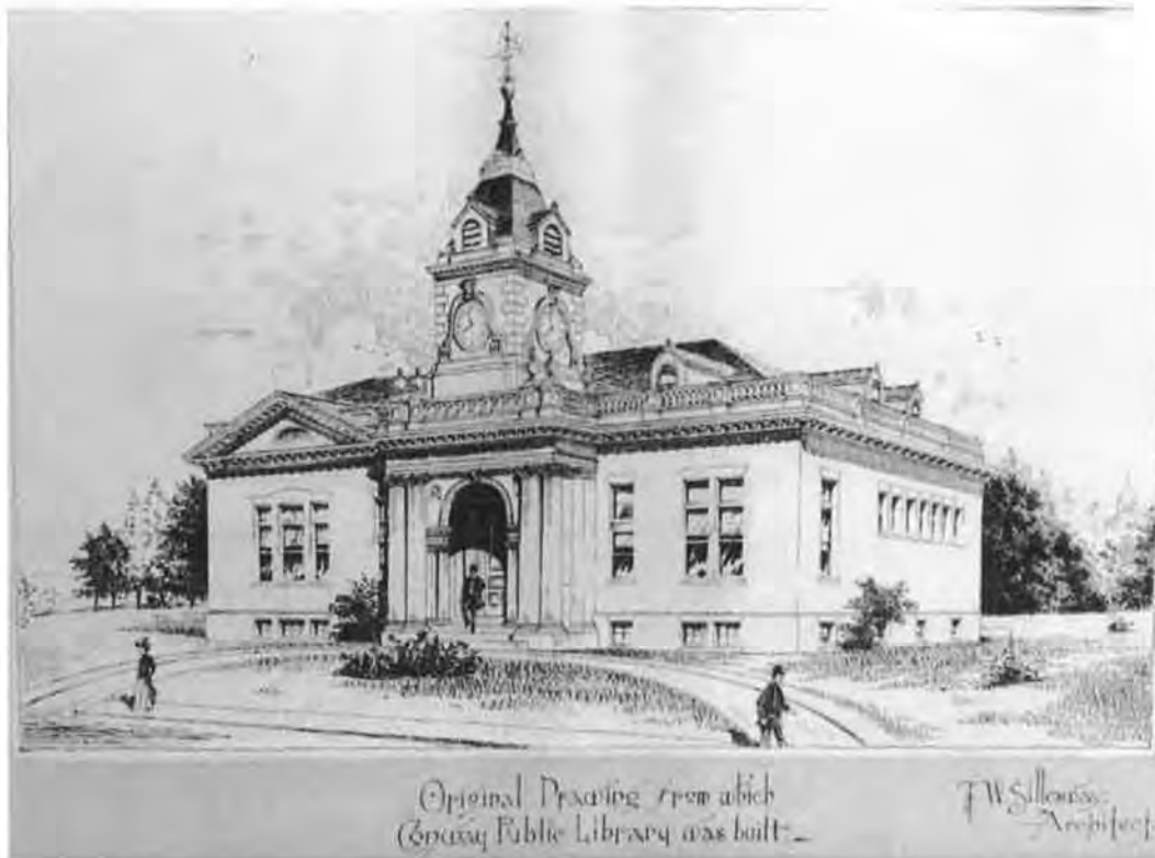
Illustration 1. Rendering showing Thomas W. Silloway's original design for the Conway Public Library.