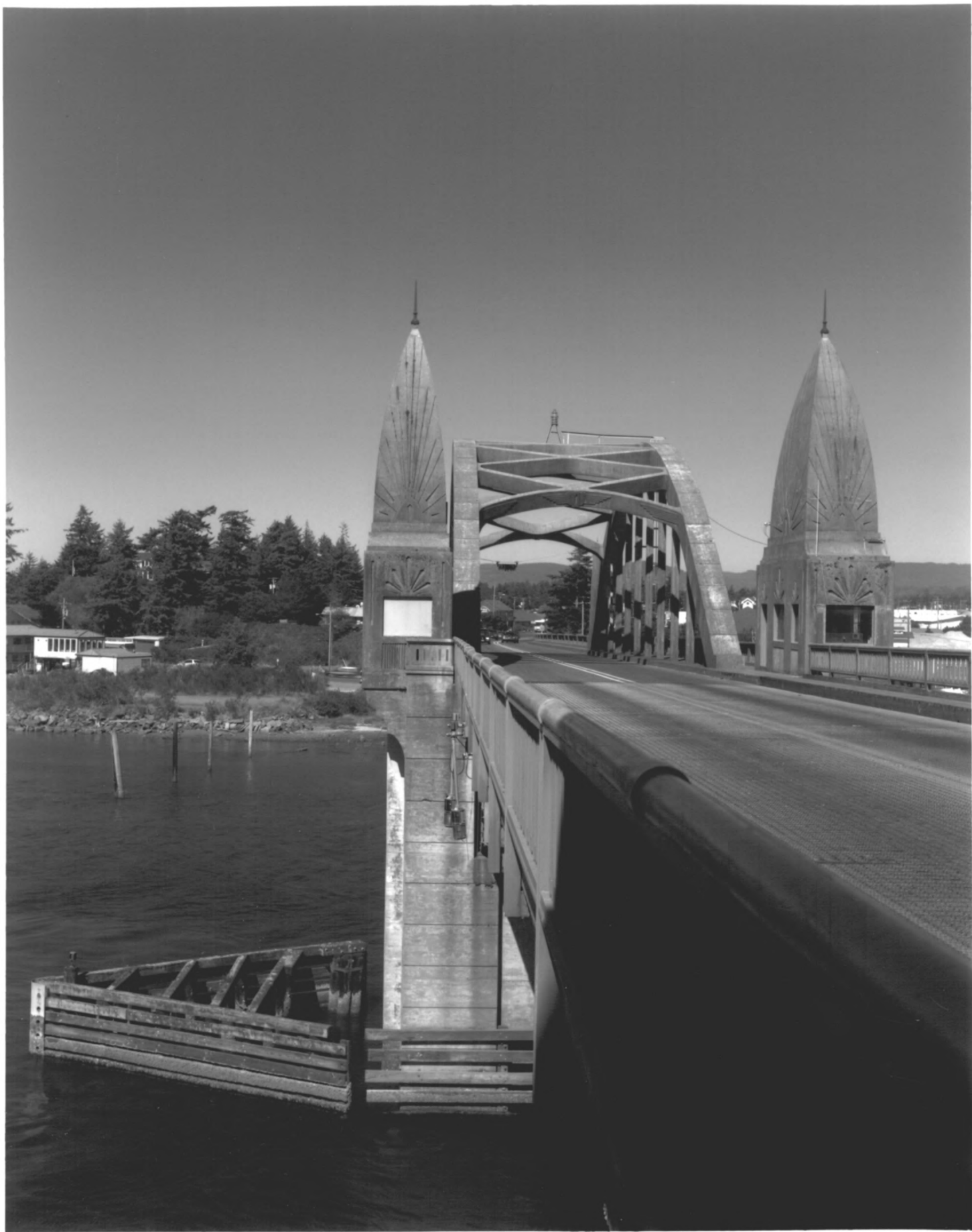
Siuslaw River Bridge, Florence, Oregon #7