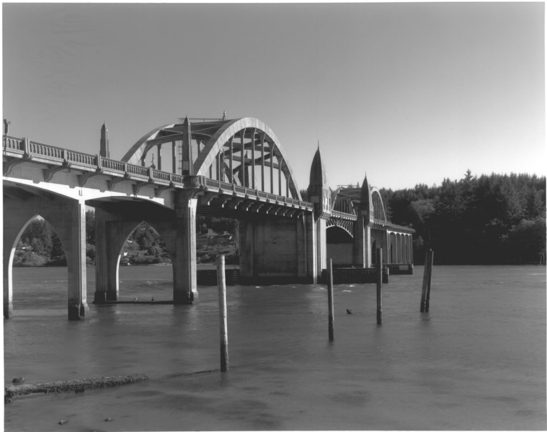
Siuslaw River Bridge, Florence, Oregon # 6