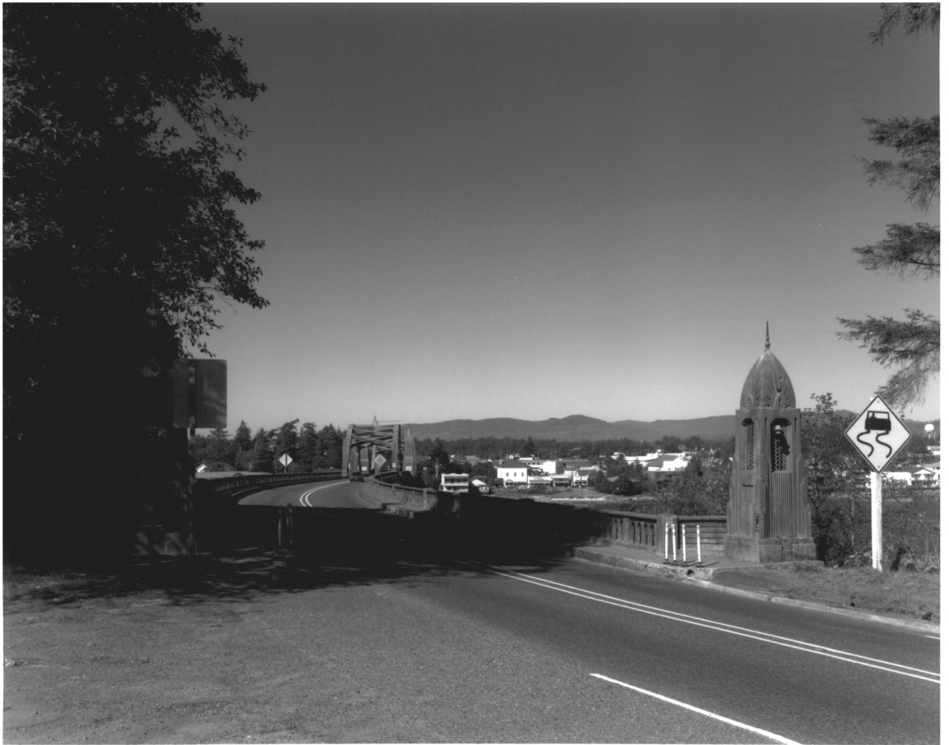
SISLAW RIVER BRIDGE, FLORENCE, OREGON #2