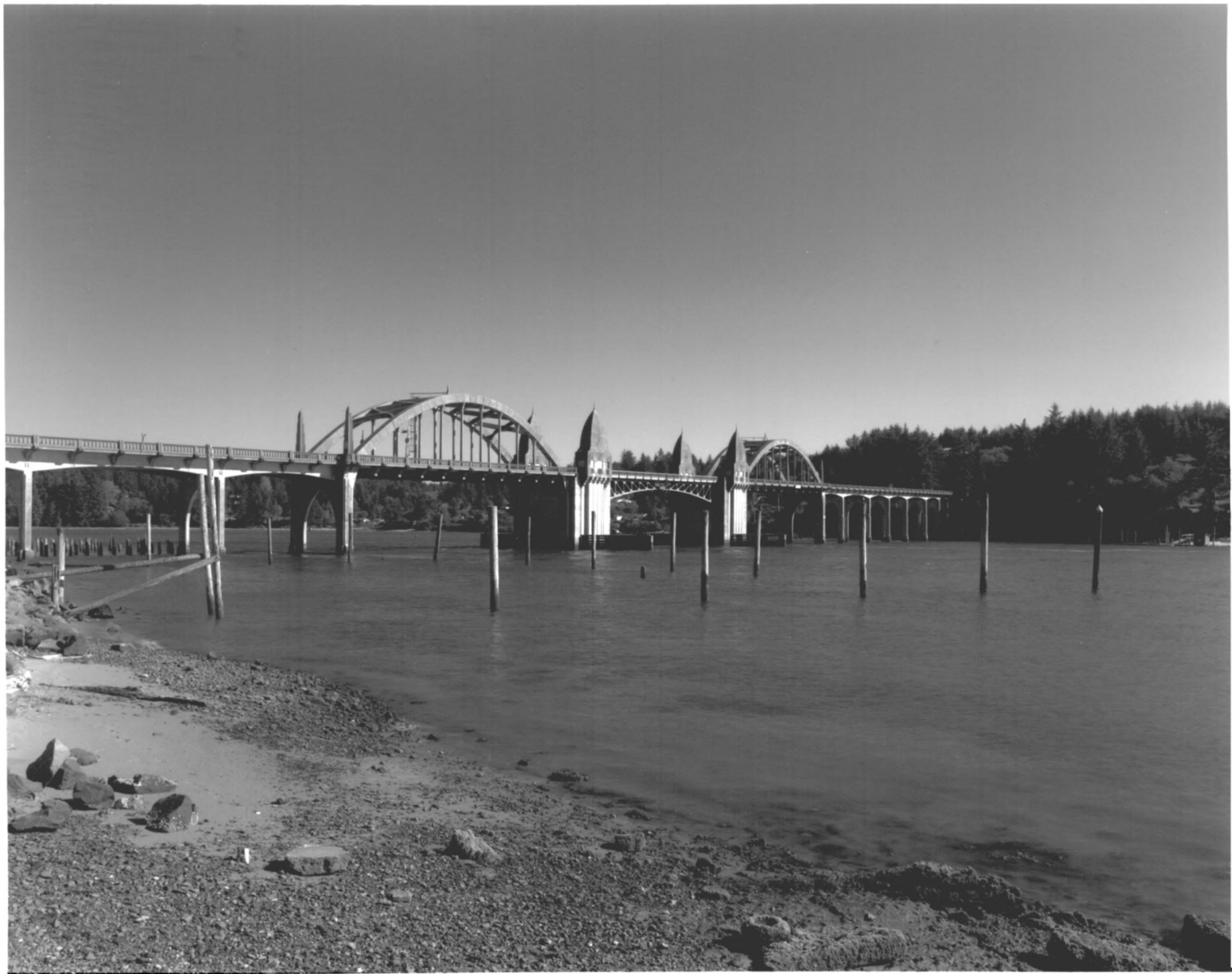
SIOU SLAW RIVER BRIDGE, FLORENCE, OREGON #3