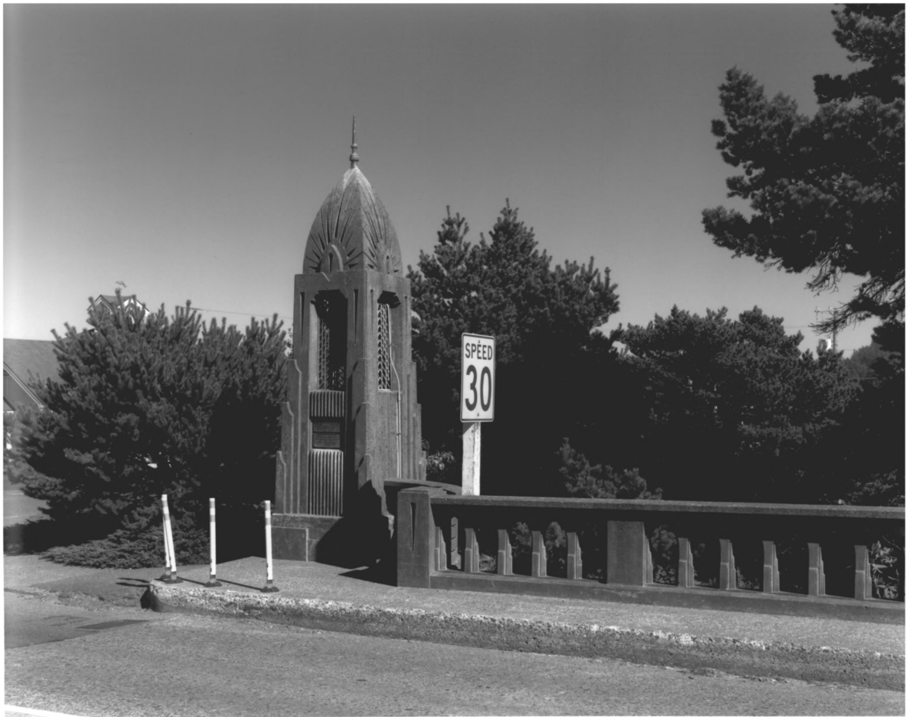
Siuslaw River Bridge, Florence, Oregon