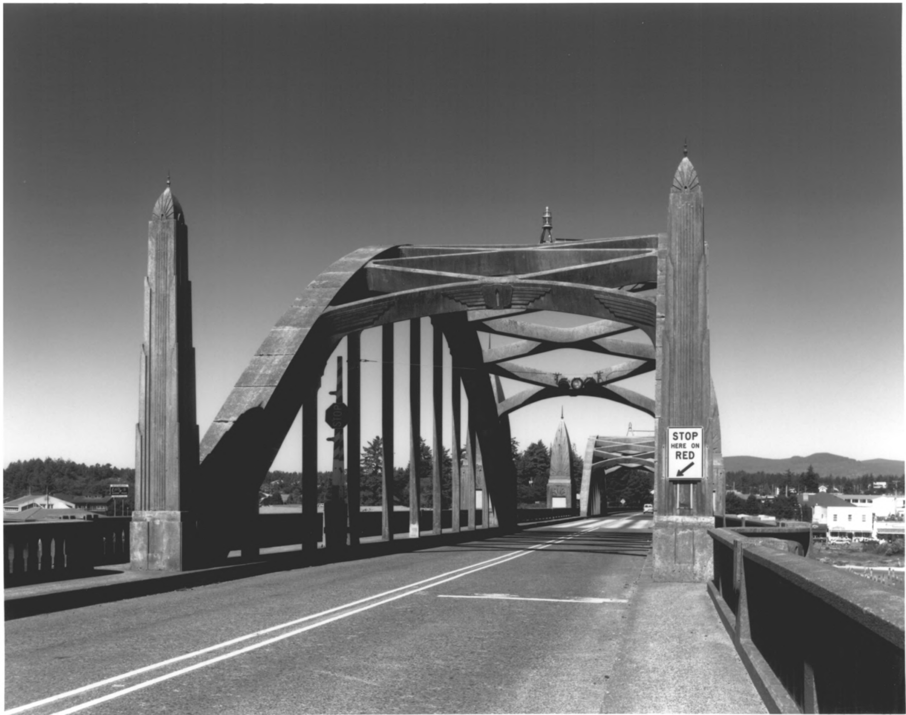
Siuslaw River Bridge, Florence, Oregon #3