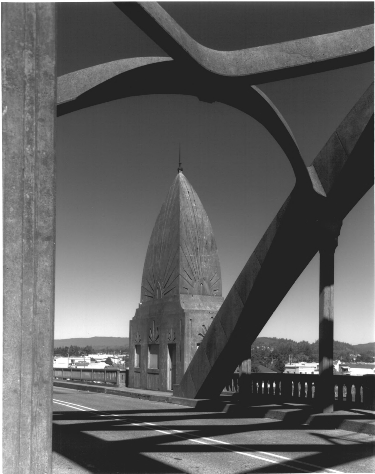
Siuslaw River Bridge, Florence, Oregon, #10