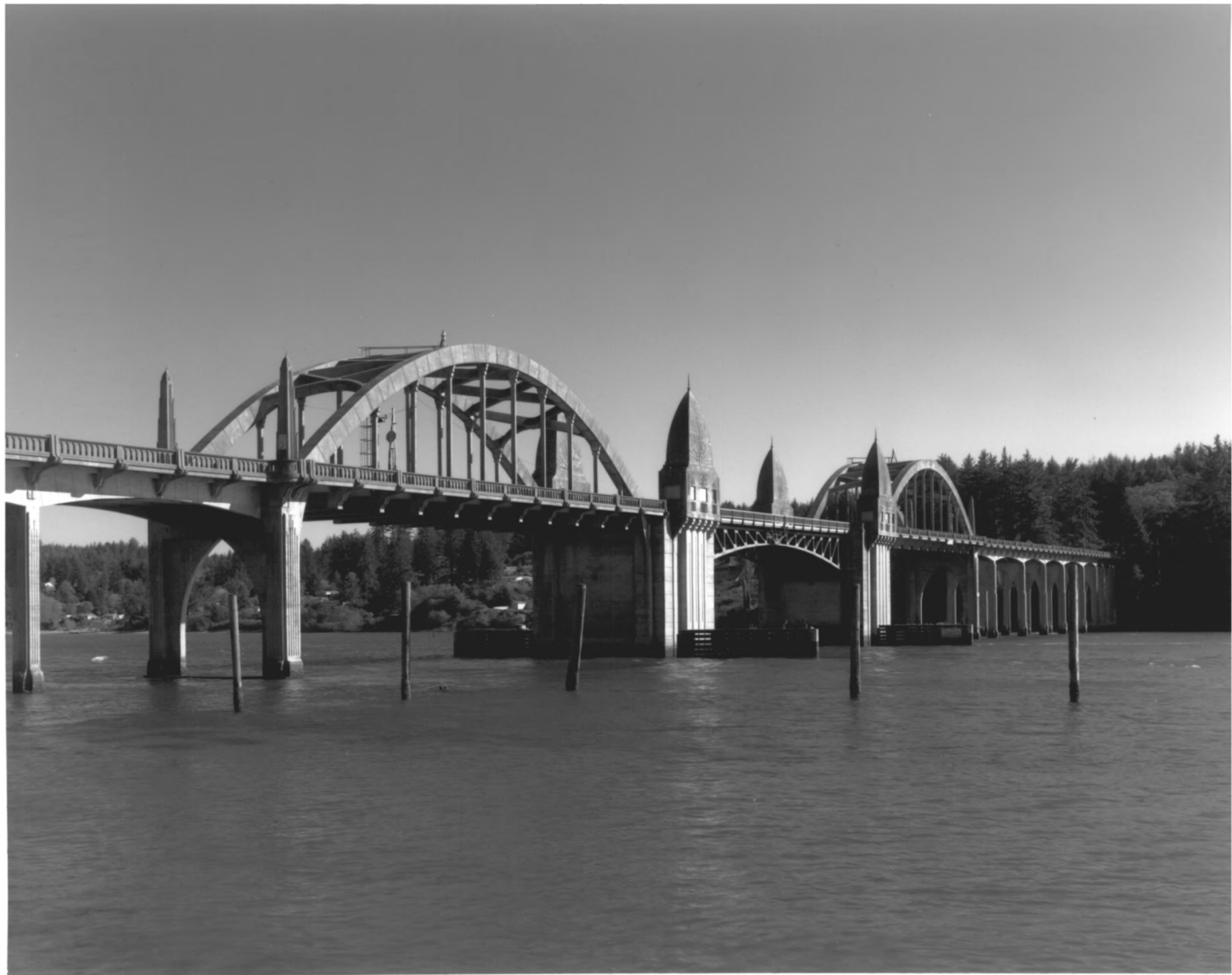
Siuslaw River Bridge, Florence, Oregon #5