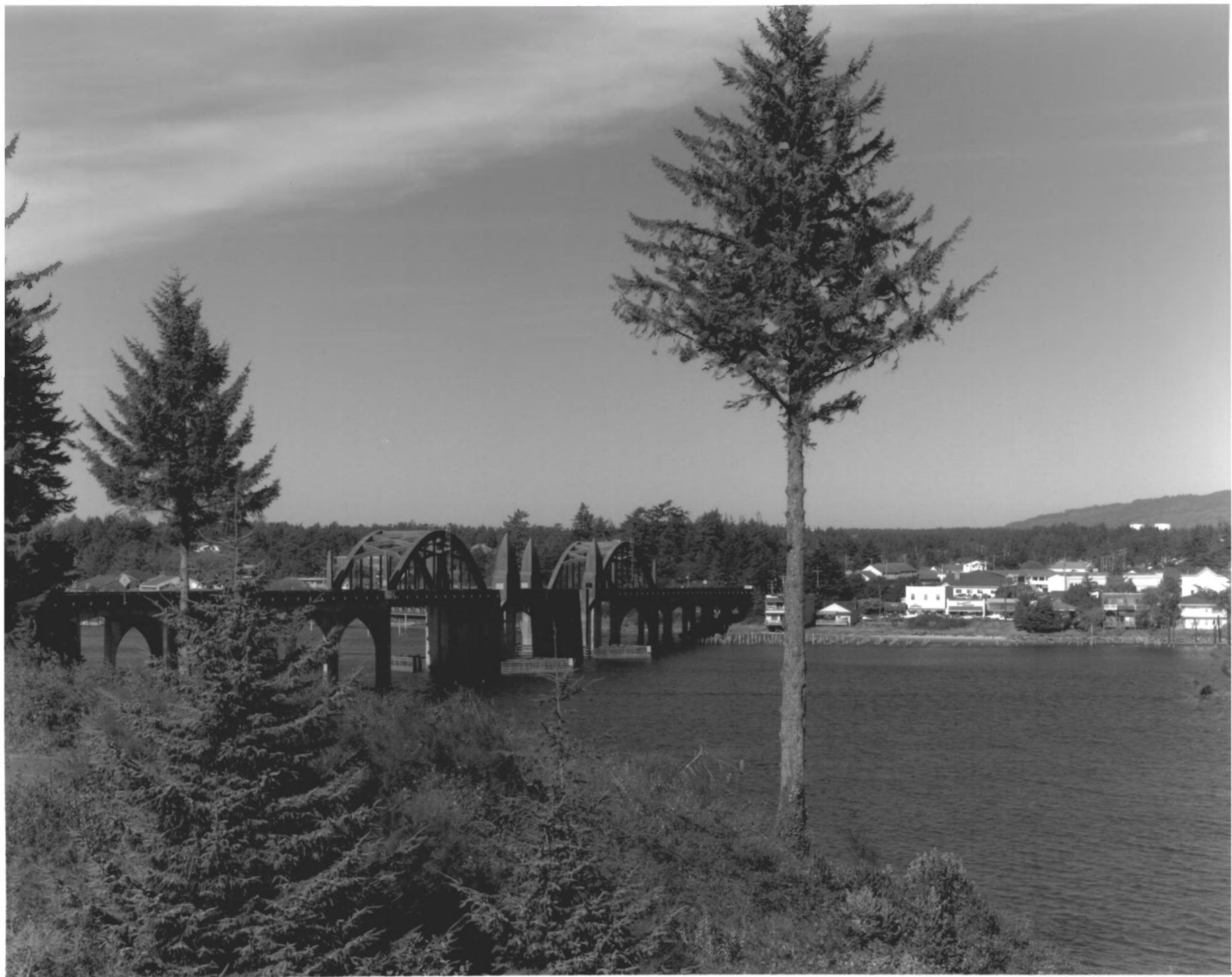
SIOUSLAW RIVER BRIDGE, FLORENCE, OREGON