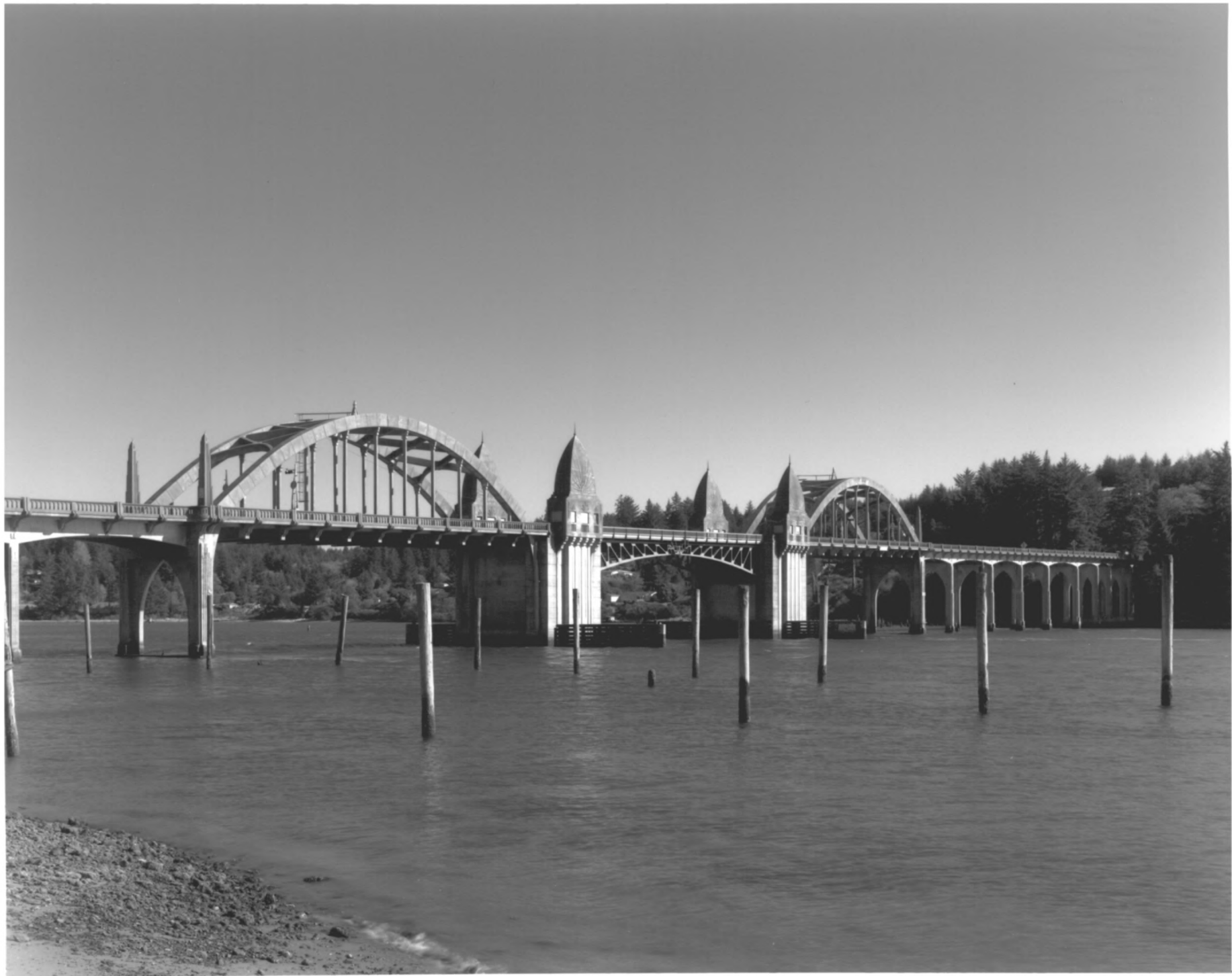
SIOUSLAW RIVER BRIDGE, FLORENCE, OREGON #4