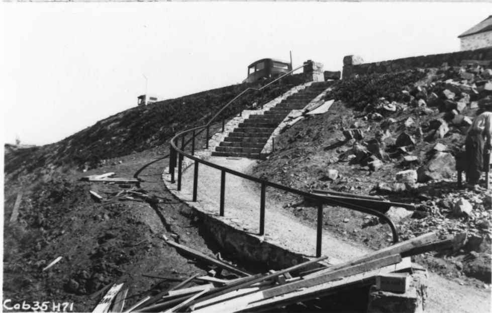
CAB35H71 West entrance steps to comfort station after installation of hand rails, bitumuls walks and boulders on highway guard wall.