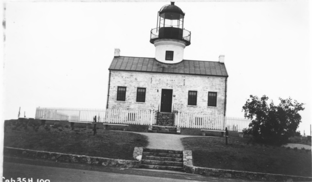
F.P.619 - Cabrillo National Monument, California LIGHTHOUSE Showing completed structure.