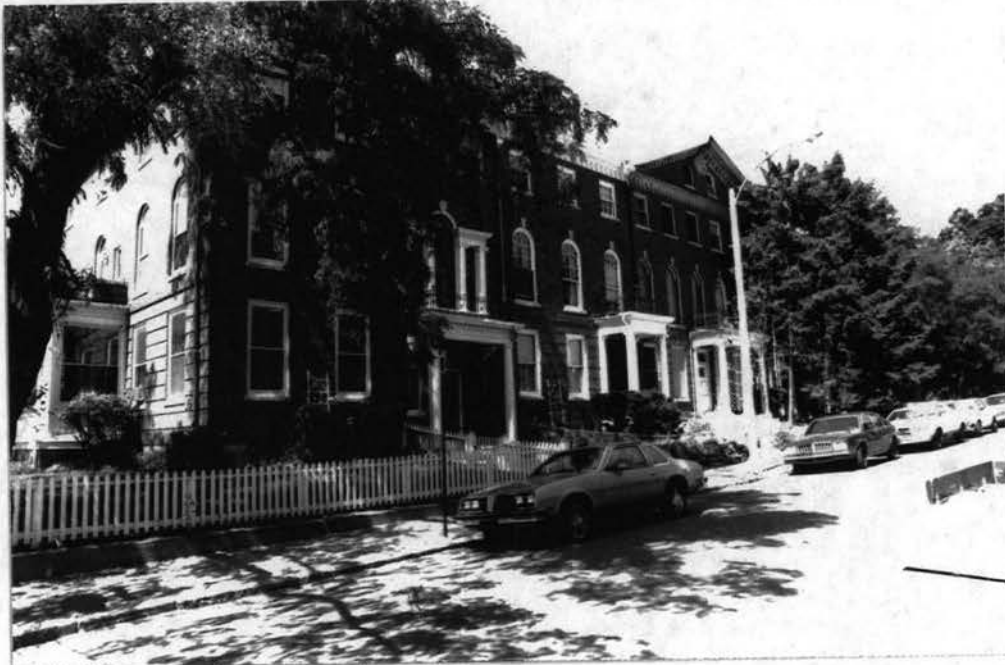
44-55 GARRELSON RD

Indicate each item on inventory form which is being continued below.