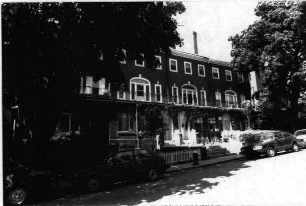
33-43 GARRISON RD