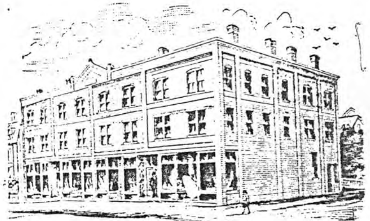
HARRINGTON'S BLOCK, MOODY STREET.

As the Harrington Block neared completion in the fall of 1885, a reporter for the Daily Free Press noted that "the whole combined makes an imposing and handsome block, an investment which is beneficial to the city, and will be profitable to the builder. The building is rightly named Harrington's Block."