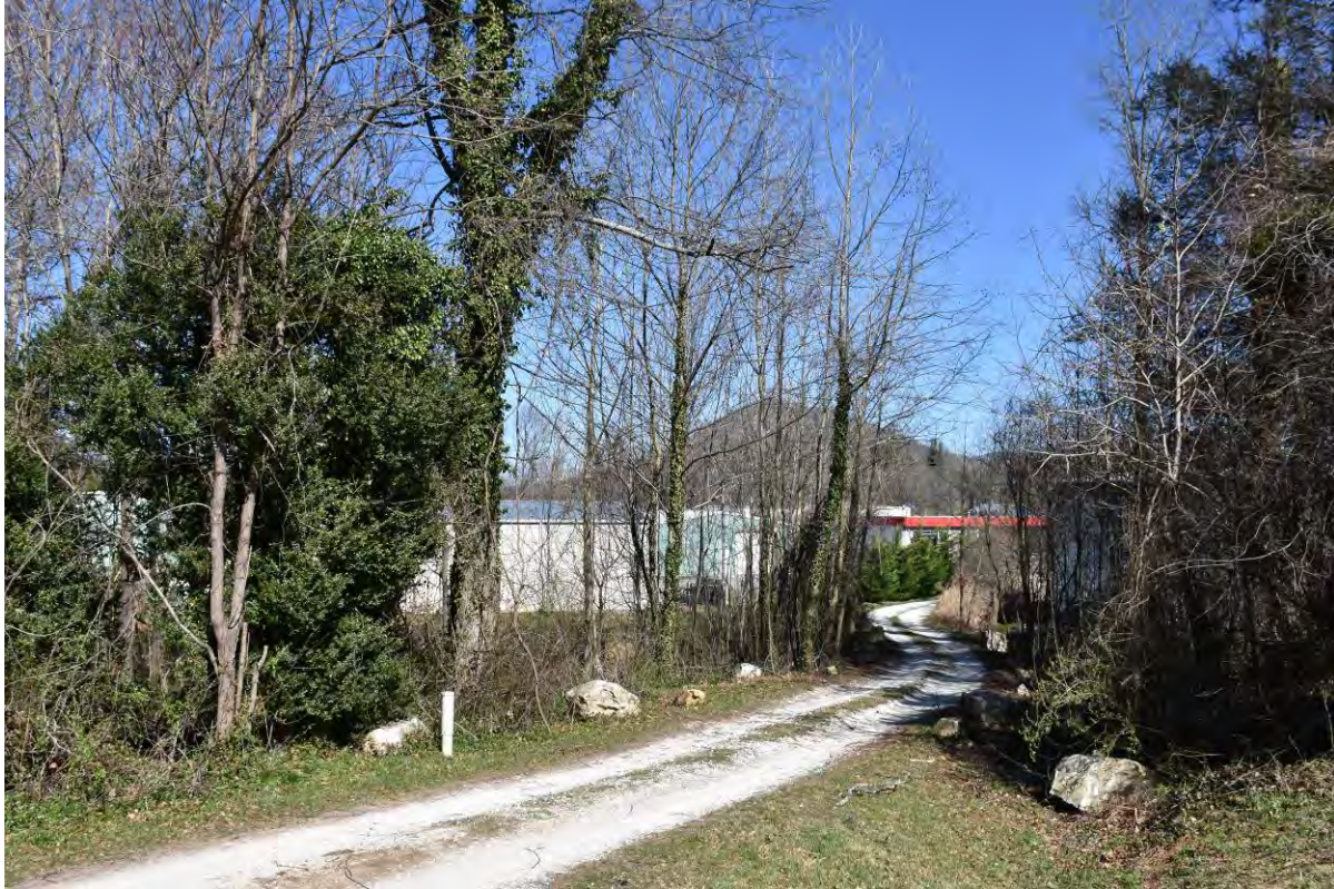
5. Looking northeast from front lawn toward self-storage-unit complex and Fletcher Commercial Drive

Section number 11 Page 13 The Meadows (Boundary Decrease) Photos Henderson County, NC