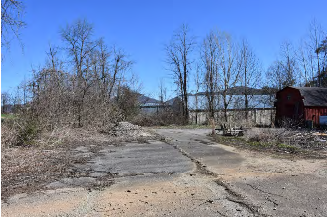
3. Looking east on lot south of reduced boundary

Section number 11 Page 11 The Meadows (Boundary Decrease) Photos Henderson County, NC