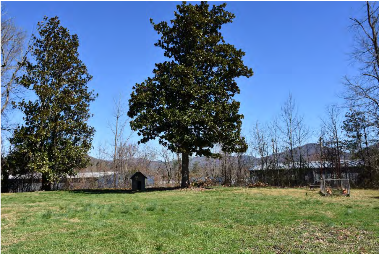
2. Front lawn, looking east toward commercial park

Section number 11 Page 10 The Meadows (Boundary Decrease) Photos Henderson County, NC