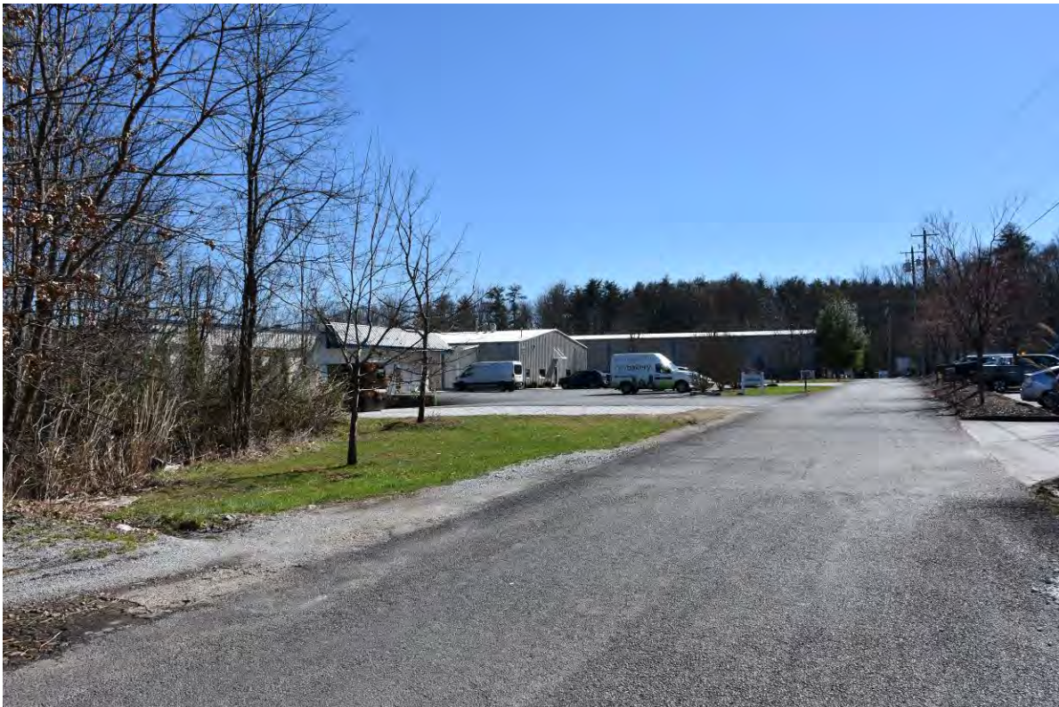
1. Commercial park east of reduced boundary, looking south

All photographs by Heather Fearnbach, Fearnbach History Services, Inc., 3334 Nottingham Road, Winston-Salem, NC, on March 2, 2018. Digital images located at the North Carolina Department of Natural and Cultural Resources.