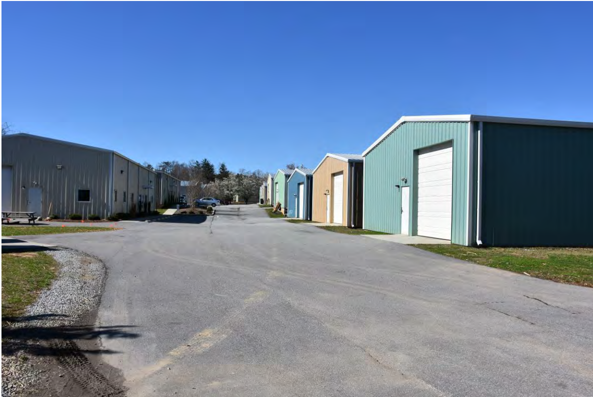
6. Self-storage-unit complex north of boundary decrease, looking west

Section number 11 Page 14 The Meadows (Boundary Decrease) Photos Henderson County, NC