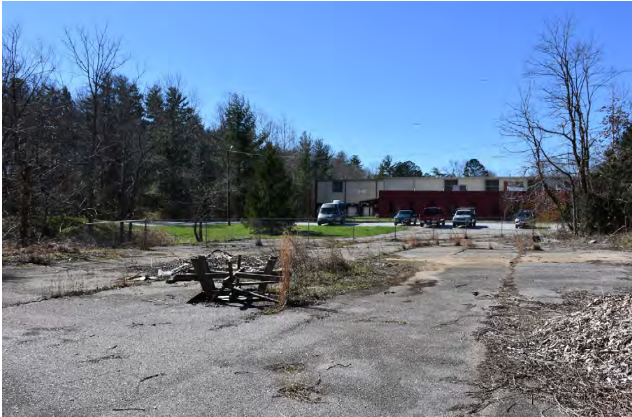
4. Looking west on lot south of reduced boundary

Section number 11 Page 12 The Meadows (Boundary Decrease) Photos Henderson County, NC