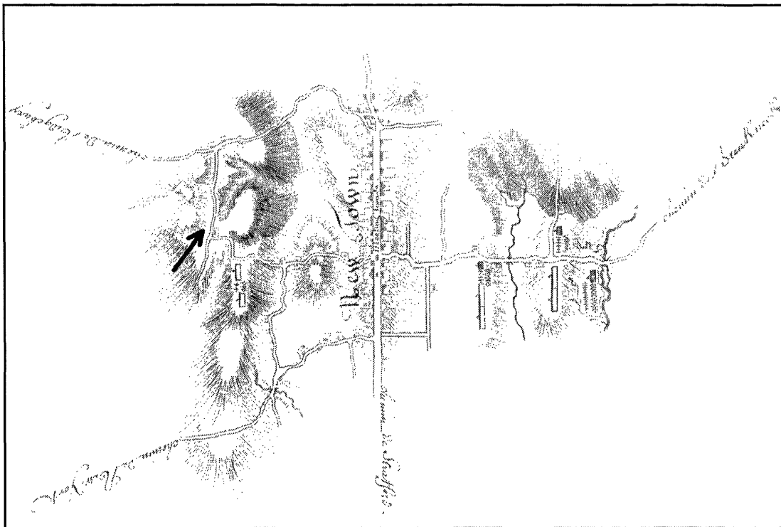
Figure 2: Newtown camps, as drawn by Louis-Alexandre Berthier, military engineer for the French army, with the portion of the route along Reservoir Road indicated by an arrow (from Rice and Brown 1972).