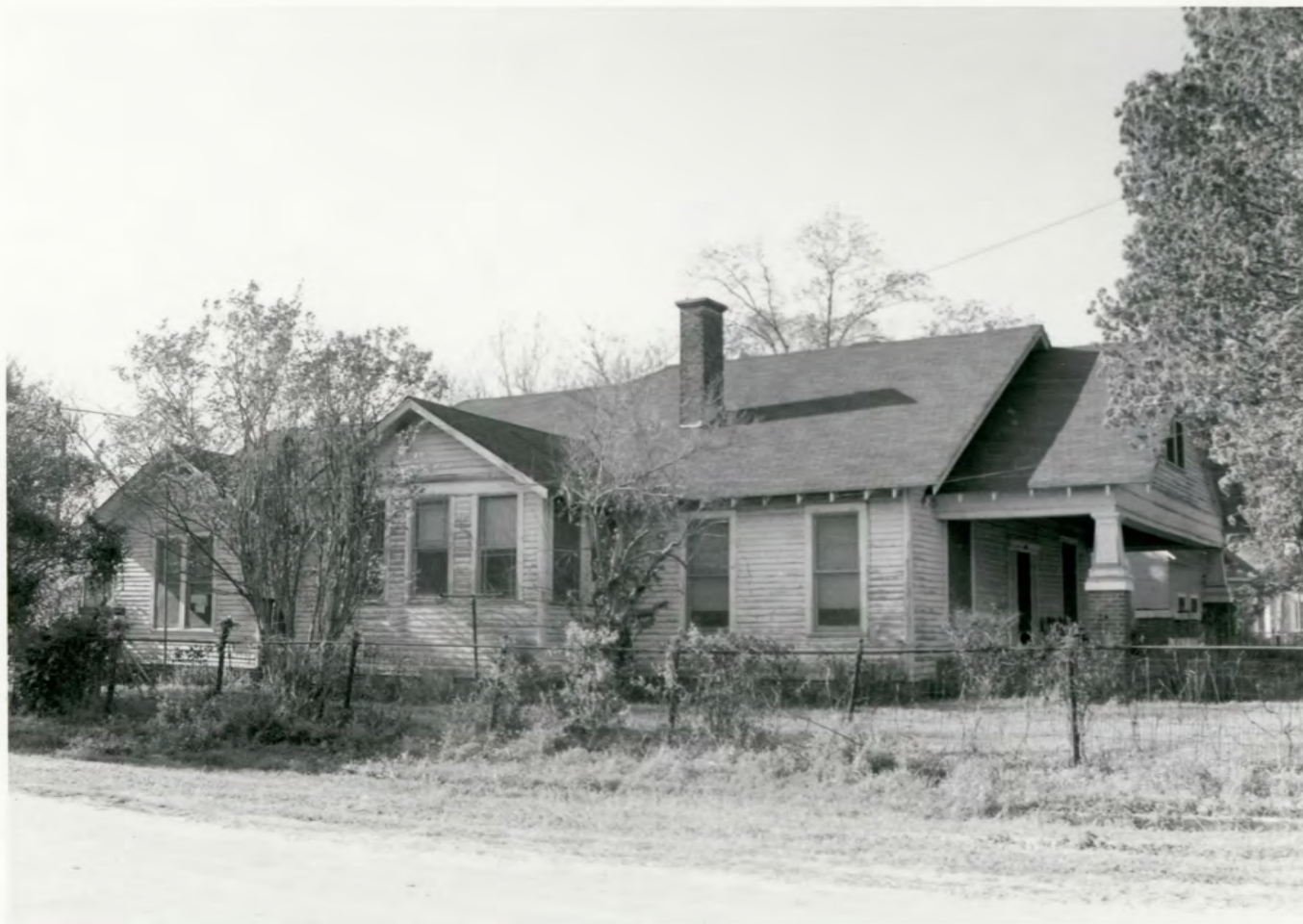
CL-49 Anderson Boarding House 201 Main HISTORIC RESOURCES OF CLARENDON Viewed from the Southeast