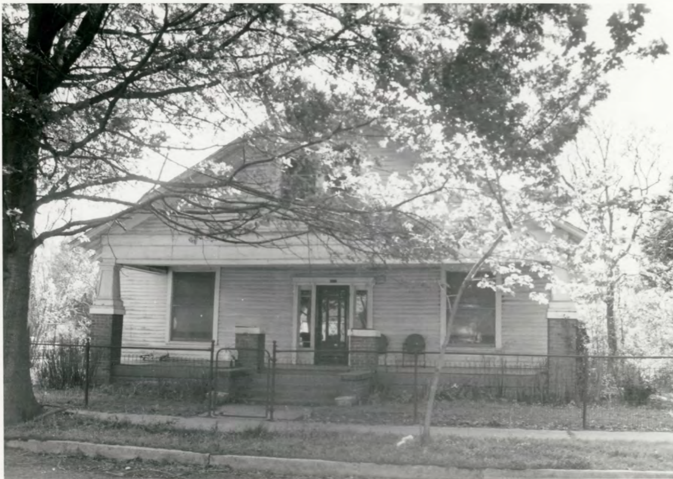
CL-49 Anderson Boarding House 201 Main HISTORIC RESOURCES OF CLARENDON Negatives at AHPP Viewed from the East