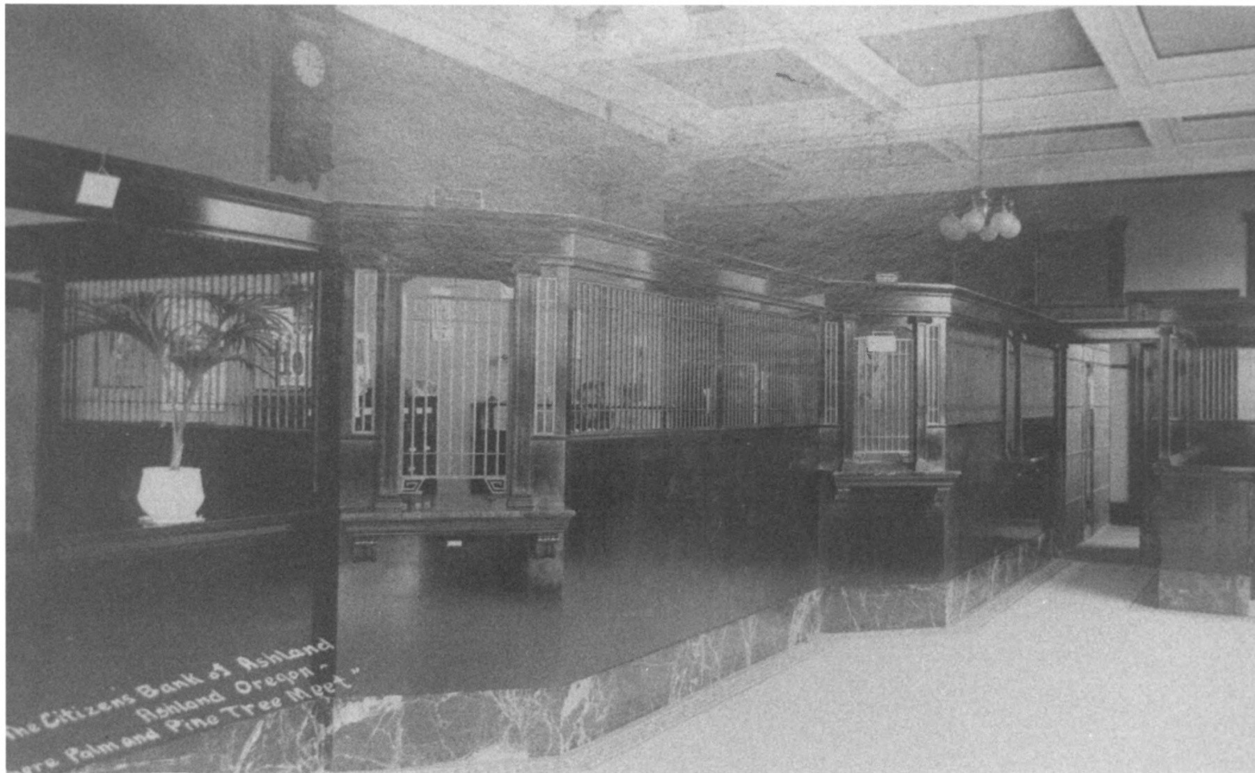
#8 Citizen's Banking & Trust Co. Ashland, Ore. Jackson Co. Interior of Citizen's Bank. Box beam ceiling, bank fixtures, terrazzo tile floor. 1911