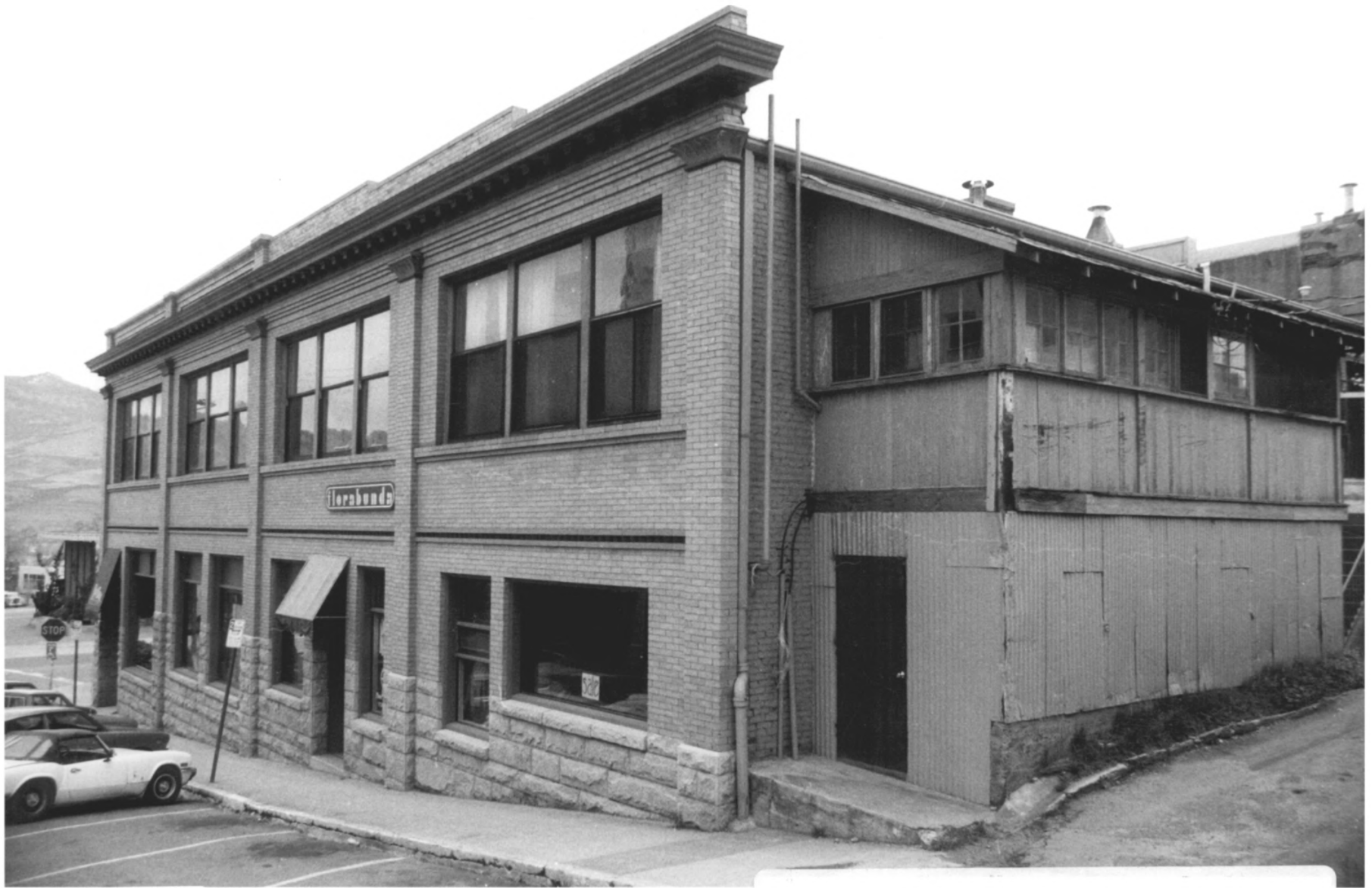
#3 Citizen's Banking & Trust Co. Ashland, Ore. Jackson Co.

North facade & rear shed addition 1984