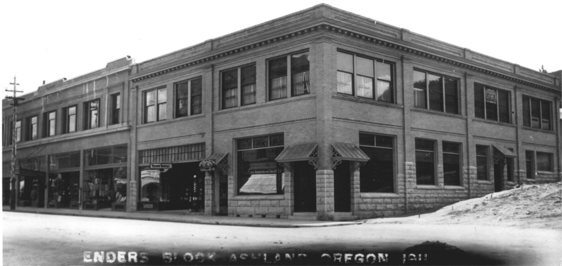
#1 Citizen's Banking & Trust Co. Ashland, Ore. Jackson Co.

Corner view, west & north Facade 1911