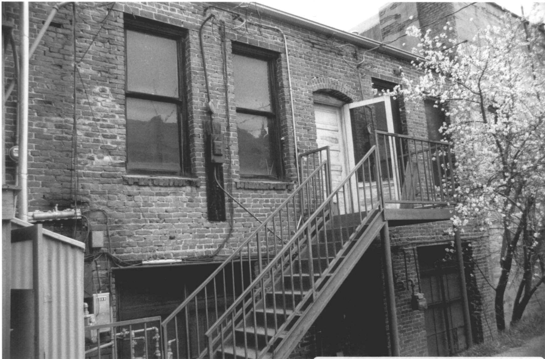
#9 Citizen's Banking & Trust Co. Ashland, Ore.

Payne Block, rear facade 1984 Ashland, Ore.