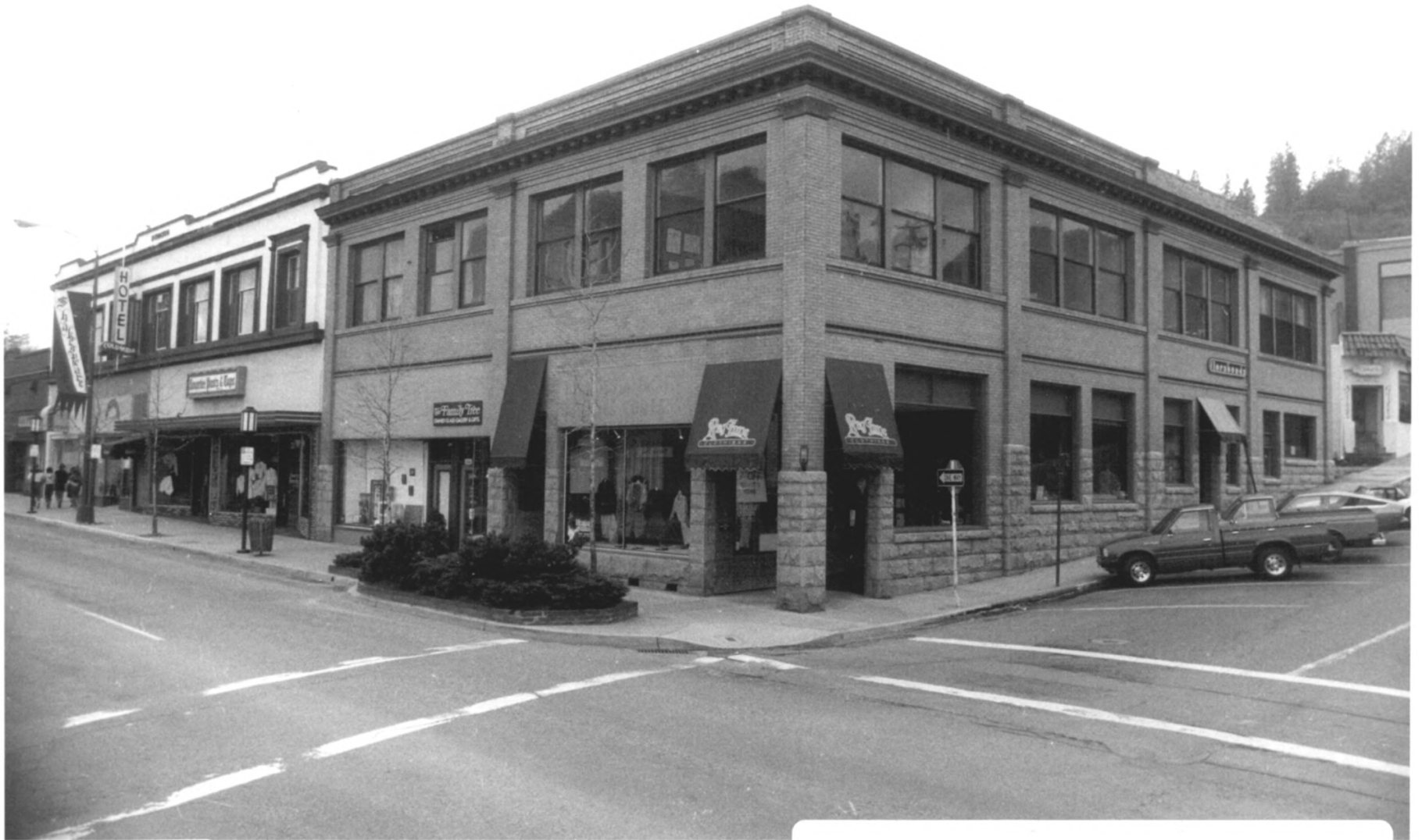
#2 Citizen's Banking & Trust Co. Ashland, Ore. Jackson Co.

Corner view, west & north facade 1984