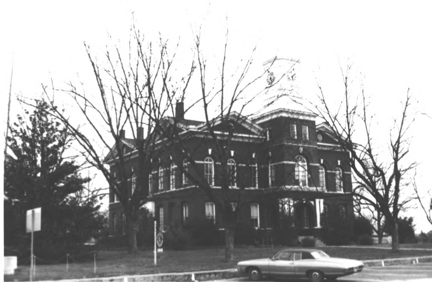
PIKE COUNTY COURTHOUSE

The plan of this courthouse resembles the Y plan of the Johnson County courthouse also done in 1895 by Golucke.