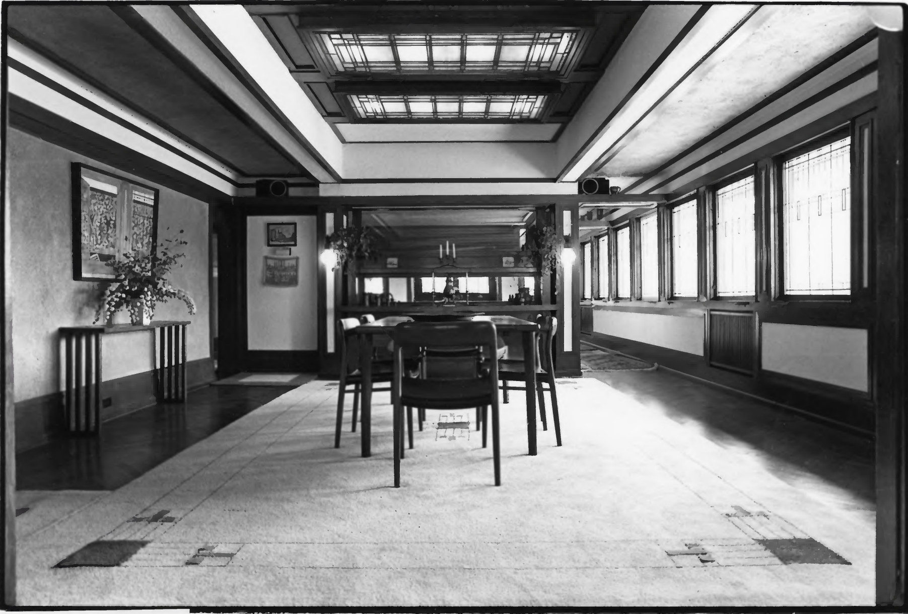
F.F. TOMEK HOUSE Riverside, Illinois Dining Room