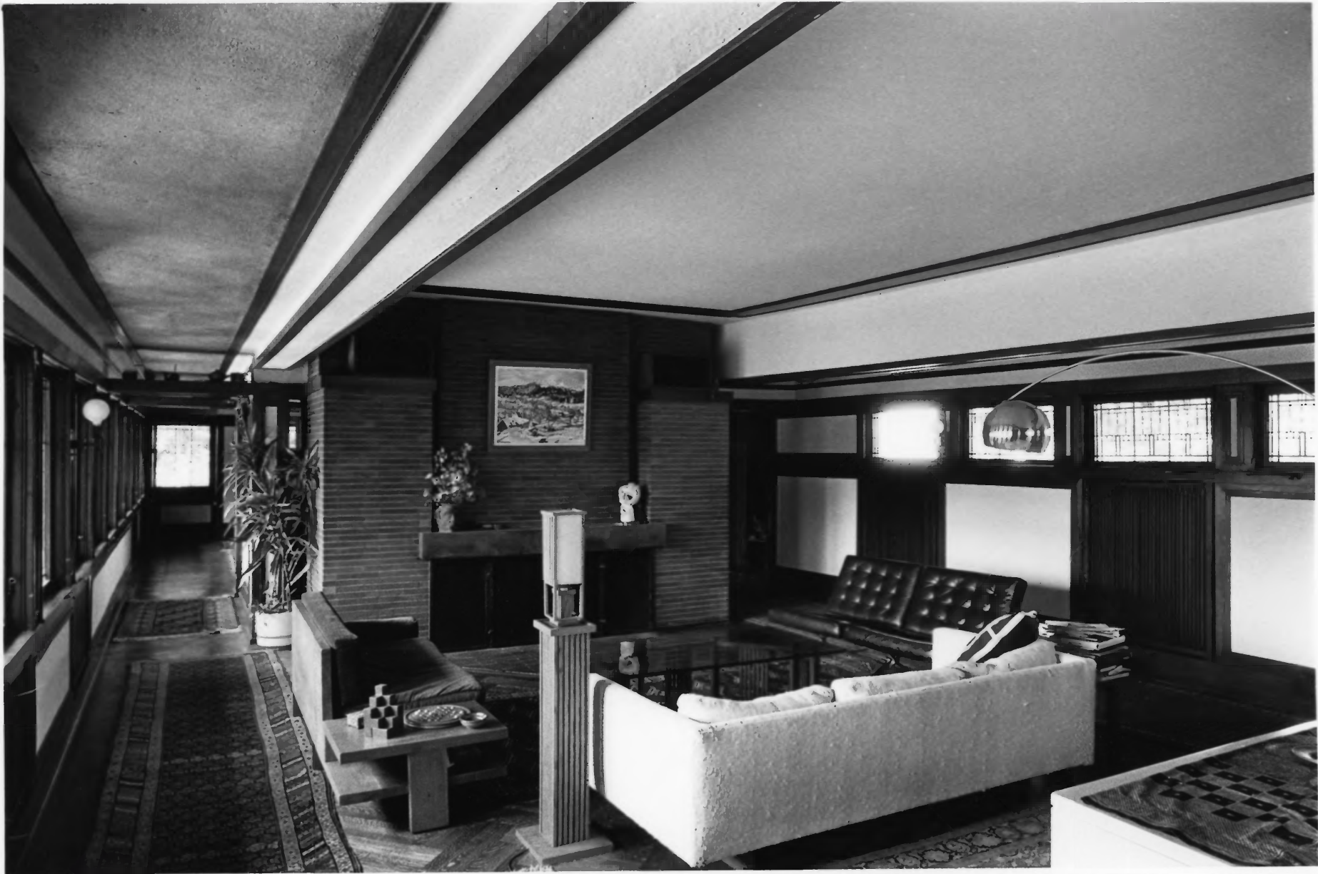
F.F. TOMEK HOUSE Riverside, Illinois Living Room, looking west