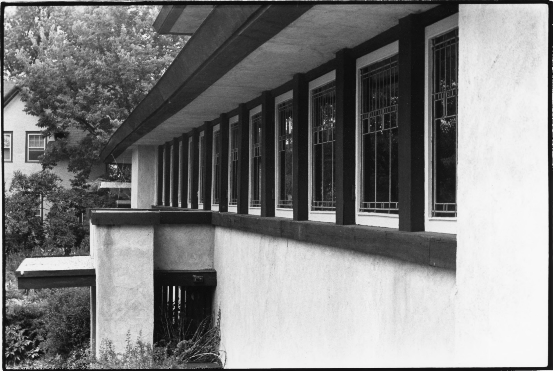
F.F. TOMEK HOUSE Riverside, Illinois Close-up of front facade Photo by Tom Moran, 1992