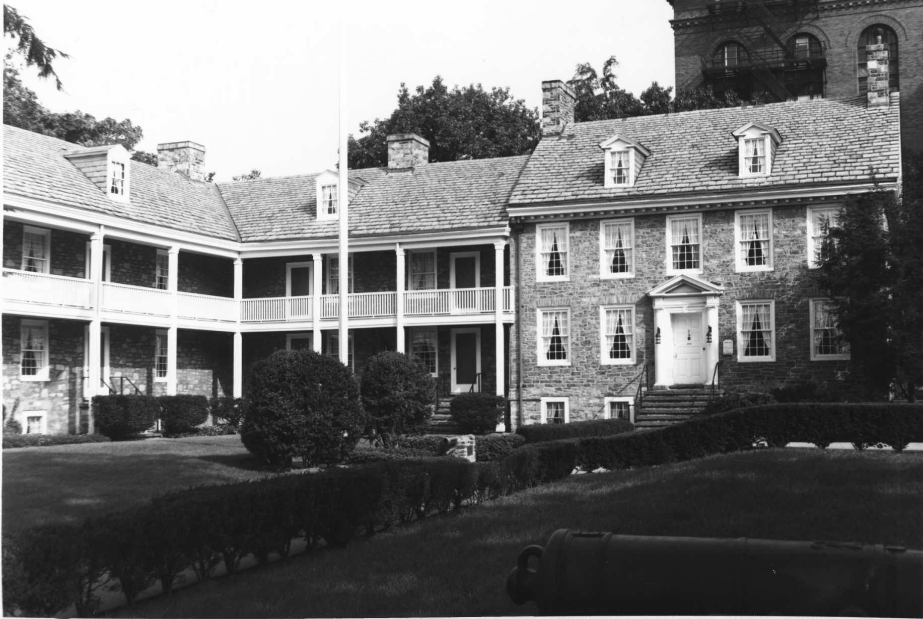
Old Barracks, Trenton, New Jersey