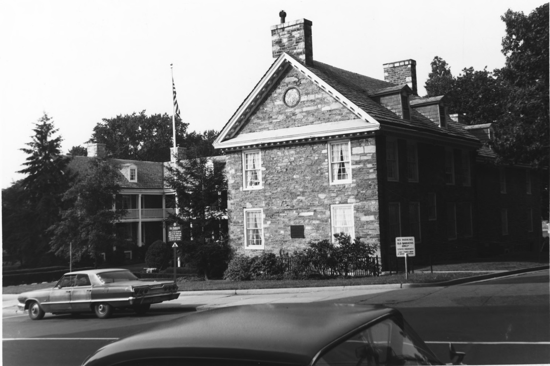
Old Barracks, Trenton, New Jersey