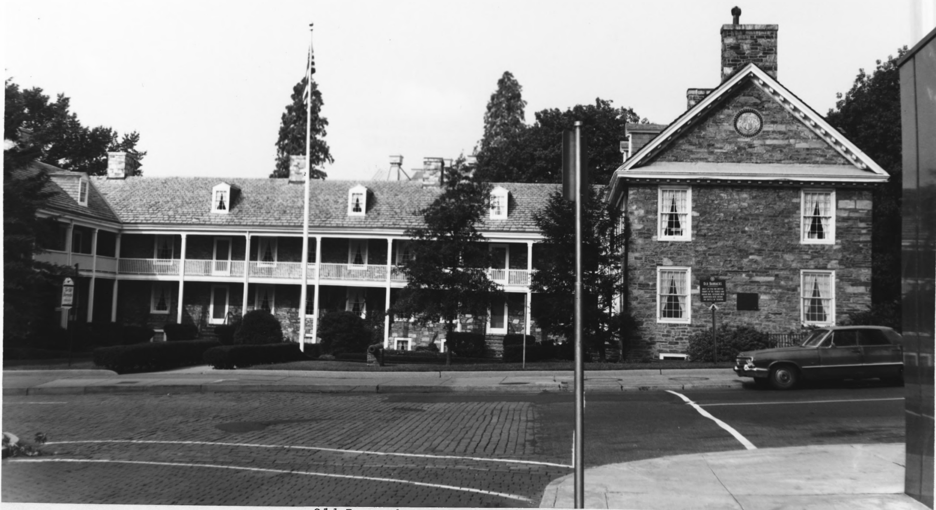
Old Barracks, Trenton, New Jersey