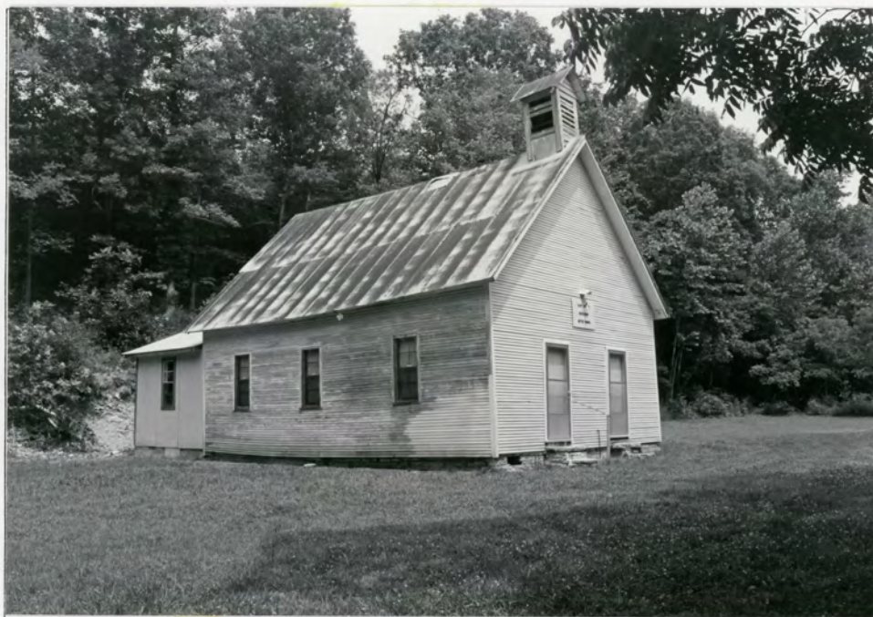
Historic Resources of Stone County Bluff Springs Church & School, ST-215 Landis vicinity Negative on file at the AHPP Viewed from the southwest