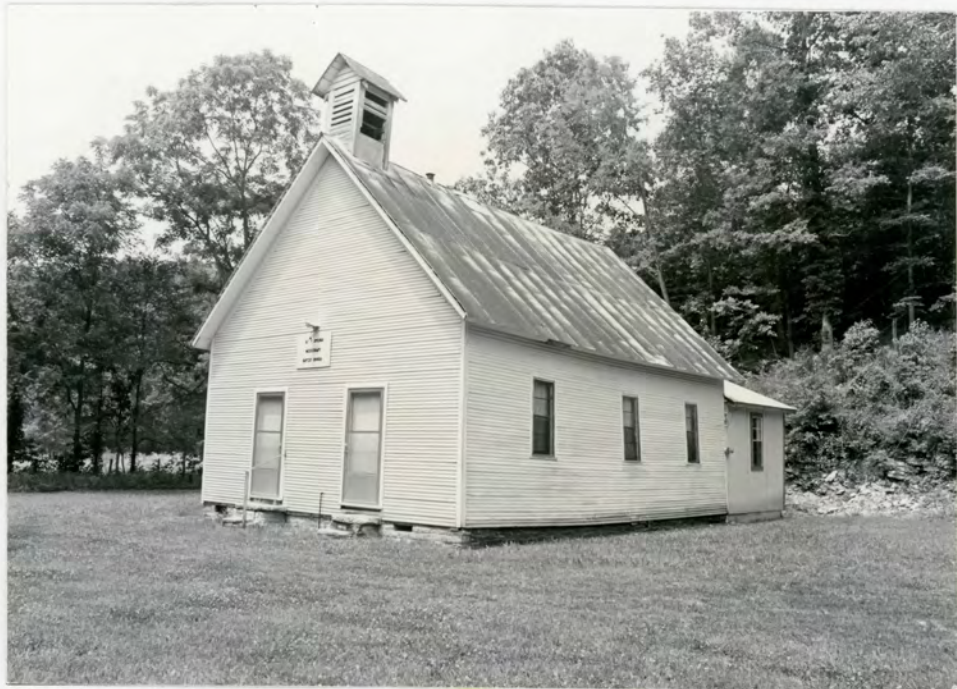
Historic Resources of Stone County Bluff Springs Church & School, ST-215 Landis vicinity Negative on file at the AHPP Viewed from the southeast